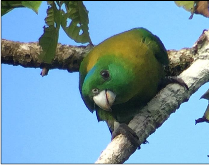
Yellow-breasted Racket-tail by David Erterius

site yielded good numbers of White-headed Stilt and Wood Sandpiper and we were thoroughly entertained by an Intermediate Egret that was busy struggling with an “eel”. We then stopped by at a small, relatively undisturbed swamp, where we added White-faced Dove to the list of Sulawesi-endemics and also caught up with better looks at Wandering Whistling Duck and Sunda Teal.