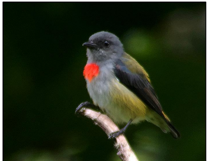
Halmahera Flowerpecker

And so ended another wonderful and richly rewarding adventure through one of the world's endemic hotspots. Our final night together on the island saw us enjoying a scrumptious farewell dinner followed by a good night's sleep, before catching our departure flights home. Thanks once again to yet another wonderful group of enthusiastic and fun participants as well as a superb ground operations team. I am very much looking forward to travelling with you all again!