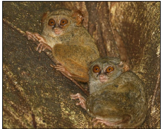
Spectral Tarsier