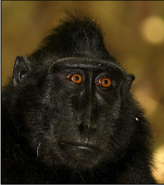
Celebes Crested Macaque by David Erterius

A little further ahead, we managed to connect with another one, although also showing all too briefly. Reaching the edge of the forest and an area of open farmbrush, we were lucky to obtain fantastic perched views of Yellow-breasted Racket-tail (this species is often just seen flying by). At this spot, we also had our first sighting of Silver-tipped Imperial Pigeon and we heard the characteristic “barking” note of Oberholser’s Fruit Dove, although it was reluctant to show itself.