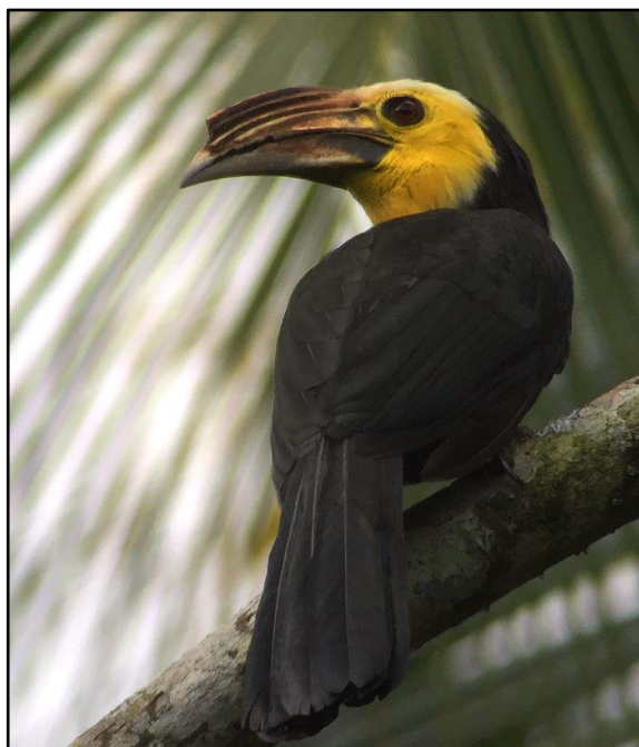
Sulawesi Hornbill

The birding commenced in the afternoon on our first day, as we headed to an area of rice paddies and ponds, mixed with farmbush and grassland. As we were nearing the area, a nice male Spotted Harrier was spotted from the vehicles and we could study it for a few minutes as it was soaring high overhead, being constantly mobbed by a White-breasted Woodswallow. Arriving at the spot, with relatively little effort, we managed to find a good selection of species and were treated to some nice introductory birding. As we walked along the embankments, we enjoyed good numbers of Javan Pond