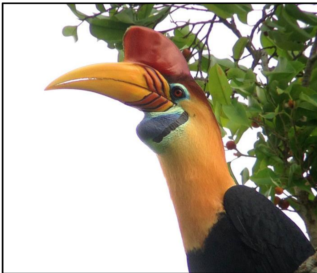
Knobbed Hornbill