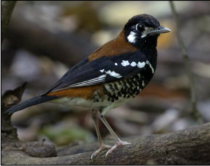
Red-backed Thrush by David Erterius

Leaving Sulawesi, we next boarded a flight from the city of Manado and flew east, across the so-called Weber's Line and into a new biome, the Moluccas. Arriving at the volcanic island of Ternate, we then transferred swiftly by speed boat to the main island, Halmahera. The afternoon was spent in a mangrove forest a bit south of our town on the west coast, primarily to look for Beach Kingfisher. Grey-headed Fruit Dove and Sombre Kingfisher were both new additions to the endemics list and other new species here were Pink-necked Green Pigeon, Pied Imperial Pigeon, Moustached Treeswift, White-bellied Cuckooshrike and Willie Wagtail. The Beach Kingfisher was, however, only heard and glimpsed by some. The next morning started off with some roadside birding in the remnant