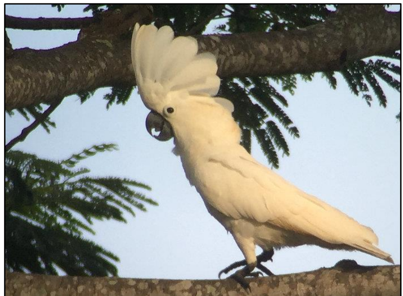
White Cockatoo

The undoubted highlight here, however, was the four males of the fabulous Standardwing displaying to three females for half an hour at eye-level some one-hundred feet away! We all stood in awe as we watched this wonderful show, the male constantly flapping his wings, exposing his standards and dancing from branch to branch as soon as the female approached his display area. This truly was an incredible birding experience and one that I suspect we will all cherish for as long as we live!!! Back on the coast at Sofifi, we finally managed to find a cooperative Beach Kingfisher which showed well for all. Returning to the