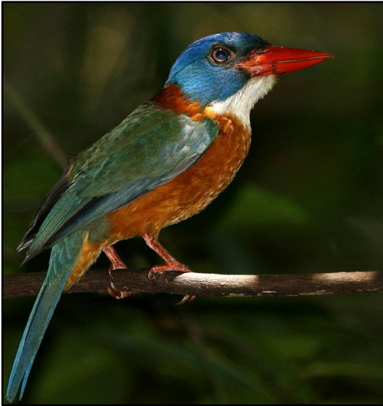
Green-backed Kingfisher

managed to connect with the former twice, along the upper stretch of the track and further down, at a huge landslide whereas we found a total of four birds of the latter.