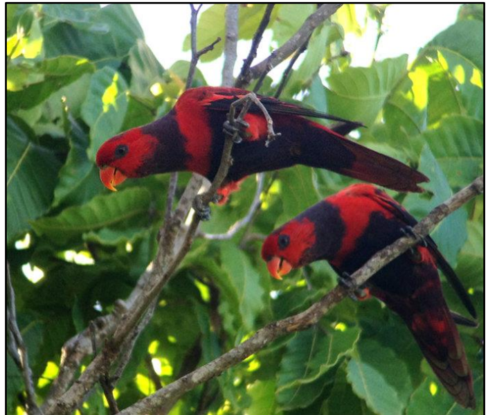
Violet-necked Lory

Halmahera Swiftlet were hawking for insects high overhead and we were fortunate to get brief views of the tricky Moluccan Goshawk. One of