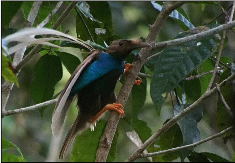
Standardwing by David Erterius

our main quarry in this area was the magnificent Ivory-breasted Pitta, and every now and then we could hear the wonderfully distinctive “wolf-whistle” song of the species, if somewhat always a little too distant. However, we found one individual sitting much closer to the road and next, a small trail had us walking into a massive bamboo stand in order to find a good spot for watching the bird.