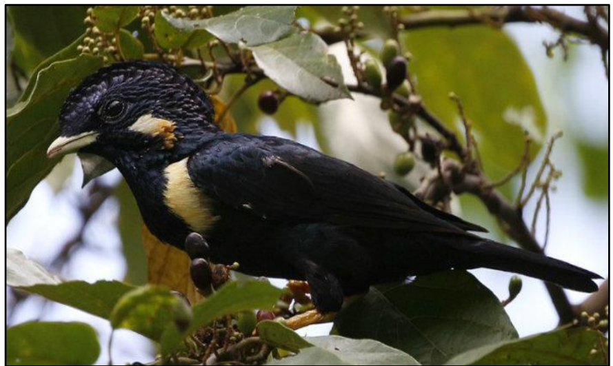
Sulawesi Myna