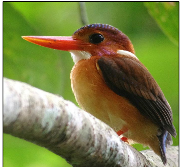
Sulawesi Dwarf Kingfisher

We then had a full transfer-day as we travelled via domestic flight to Manado in the Minahassa region, further north-east, before continuing by driving towards Kotamobagu. Some roadside birding along the way between Manado and Kotamobagu produced a few new birds for the trip, such as Sunda Teal, Buff-banded Rail and White-browed Crake and we had even better views of a male Spotted Harrier that was patrolling low over the rice fields. Our two full days of birding in Dumoga-Bone National Park commenced by visiting a protected section of lowland rainforest, where a conservation programme for the endangered Maleo has been implemented at nesting grounds in the forest - with hatchery projects and improved guard patrolling.