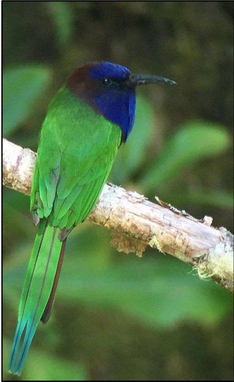
Purple-bearded Bee-eater by David Erterius

Dawn was coming quickly and we soon found ourselves at the front office in the forest proper, ready for some real forest birding. As the forest slowly became more vibrant and alive, we realised how productive the nowadays relatively small patch of good, untouched montane rainforest at the heart of the National Park is, with a plethora of interesting species. Slender-billed Cuckoo-Doves and small parties of Citrine Lorikeet, Black-crowned White-eyes and Fiery-browed Starlings were all busy feeding high up in the canopy and a little lower, single Pygmy Cuckooshrikes. Rusty-bellied Fantail, Citrine Canary-Flycatcher and Turquoise Flycatcher were all at the lower to mid-level of the trees. A Yellow-billed Malkoha showed up and offered the best views of the trip. Venturing along trails into the forest, we had good looks at Sulphur-vented Whistler, Dark-eared Myza, Sulawesi Babbler and Blue-fronted Blue Flycatcher. A more open area between the forest and a small lake yielded Grey-rumped Treeswift, Collared Kingfisher, White-breasted Woodswallow, Black-naped Oriole, Short-tailed and Grosbeak Starling, all perched up nicely in tall dead trees, whereas Little Pied Flycatcher and Mountain White-eye showed well at eye-level. Back at the road that bisects the forest, we found even more Sulawesi-endemics, namely the fine-looking Red-eared Fruit Dove, the velvety blue-greyish Cerulean Cuckooshrike, dainty Sulawesi Myzomela and the tricky Crimson-crowned Flowerpecker and