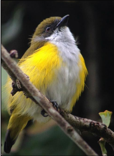
Yellow-sided Flowerpecker by David Erterius

Heron feeding in the ponds and we also found Striated Heron, Purple Heron and Little Egret whereas a couple of Wandering Whistling Duck and a single Yellow Bittern were flushed from the more densely vegetated ponds.