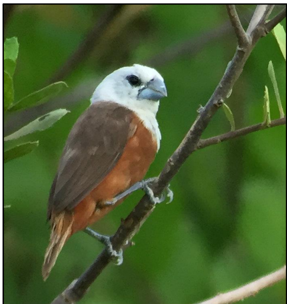
Pale-headed Munia by David Erterius

Part of Indonesia's nearly 17,000 islands, and considered one of the endemic hotspots of the world - the islands between Borneo and New Guinea form a biogeographical connection between the Oriental and Australian avifauna. The region is often called Wallacea, after the English 19 th -century explorer Alfred Russel Wallace, and consists of three distinct subregions: Sulawesi, the Lesser Sundas and the Moluccas. On this trip, we focused on two of these subregions - the island of Sulawesi and the Moluccas, the latter by visiting the island of Halmahera. These two relatively large islands still support some of the most spectacular birds on earth, despite the increasingly devastating effects of rapid population growth and associated habitat destruction for agriculture and urban sprawl. Our tour ventured into several remote regions, including travelling through the best of these island's important natural biomes, which ranged from the scenic mountainous interior to volcanic coastal forests. During our adventurous journey, we amassed an outstanding