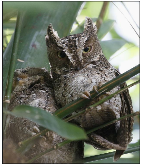
Sulawesi Scops Owl by David Erterius

The next day was dedicated to exploring the mid-elevation forest along the Molibagu Road, which proved to be very productive. Highlights here included six new Sulawesi-endemics in the form of good lengthy scope views of an adult Sulawesi Goshawk perched on a dead tree, a confiding pair of Sulawesi Dwarf Kingfisher, Pygmy Hanging Parrots, Pied Cuckooshrike, Sulawesi Mynas feeding in a fruiting tree by the roadside and several White-necked Mynas. A bonus were the five Gorontalo Macaques that we found across a valley, busy feeding in the foliage of tall trees. Other noteworthy sightings in this area were our first Black-naped Fruit Doves and Crimson Sunbirds of the trip and additional lengthy scope views of calling White-faced Dove and further looks at both Knobbed Hornbill and Sulawesi Hornbill. We also caught up with better views of Grey-headed Imperial Pigeon, Purple Needletail and Ivory-backed Woodswallow. Heading to another forest patch and descending slightly, we had another delicious lunch on our arrival, cooked by our lovely private cook, Anne. A juvenile Rufous-bellied Hawk-Eagle gave perfect open views through the scope and a Common Kingfisher showed briefly, both along a nearby stream before it was time to cross by a raft, allowing us access to the forest proper by mid-afternoon. Having walked along the trail for a while, glimpses of an unidentified ground-dweller by the side of the trail turned out to be a Red-bellied Pitta.