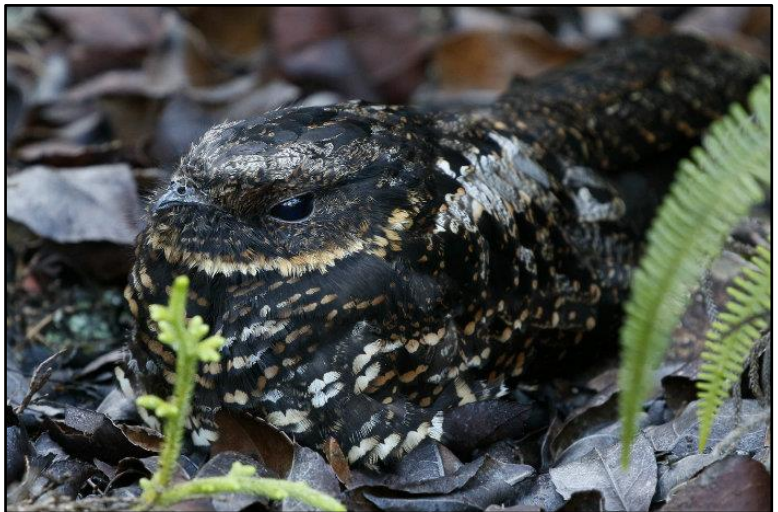
Satanic Nightjar by David Erterius

One of the days in Lore Lindu was entirely dedicated to the higher elevations, namely the magnificent montane forest on upper Mount Rorekatimbu. To get there, we had to hike on an old logging road, departing just before dawn in order to reach the upper forest in good time for birding. Two of our target species here were the spectacular Purple-bearded Bee-eater and the poorly-known Satanic Nightjar, only rediscovered in the late 1990's. We