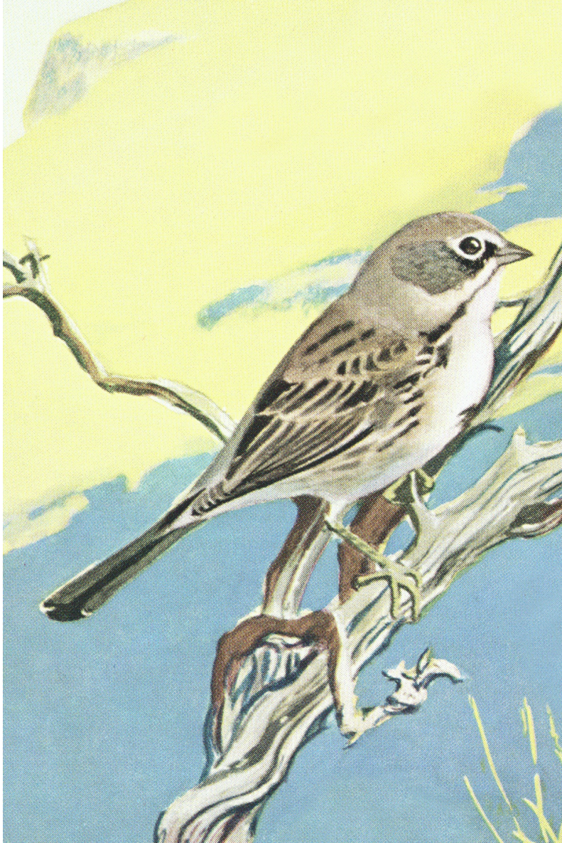
Figure 1. Painting of the Sage Sparrow ( Amphispiza belli ) by R. M. Mengel (Bailey and Niedrach 1965, plate 119). Reprinted here with permission.