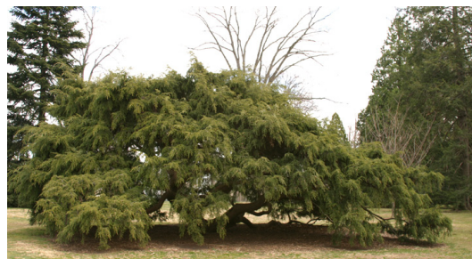
Tsuga canadensis 'Pendula'

Upright, columnar form with shiny dark green foliage. The bark can be gray-green to red-brown and is smooth until later in maturity. Grows 30'-50' in height and 10'-15' wide. Section 1