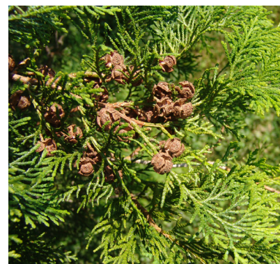
Chamaecyparis obtusa var. formosana cones

Broadly pyramidal with lustrous, pointed, dark green needles. Not prone to dead branches as other C. lanceolata . From afar, looks more like Abies than Cunninghamia . Grows 30'-75' high and 10'-30' wide. Section 3