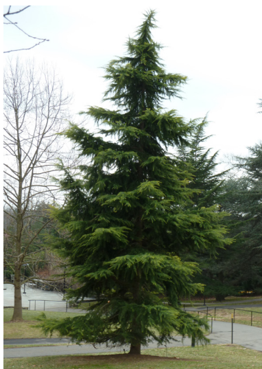
Cedrus deodara 'Roman Gold'

Fast-growing with dense branching that becomes more open and dramatic with age. Needles are longest of the true cedars and, in this cultivar, are a golden color. Grows 40'-70' in height. Section 2