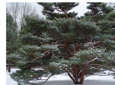
Pinus densiflora 'Umbraculifera'

Rich green needles set off the exfoliating, patchwork-like bark. Usually multistemmed; prune lower branches to showcase bark. Grows 30'-50' tall and 20'-35' wide. Section 3