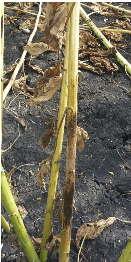
Figure 4. Stem lesion, Argentina.