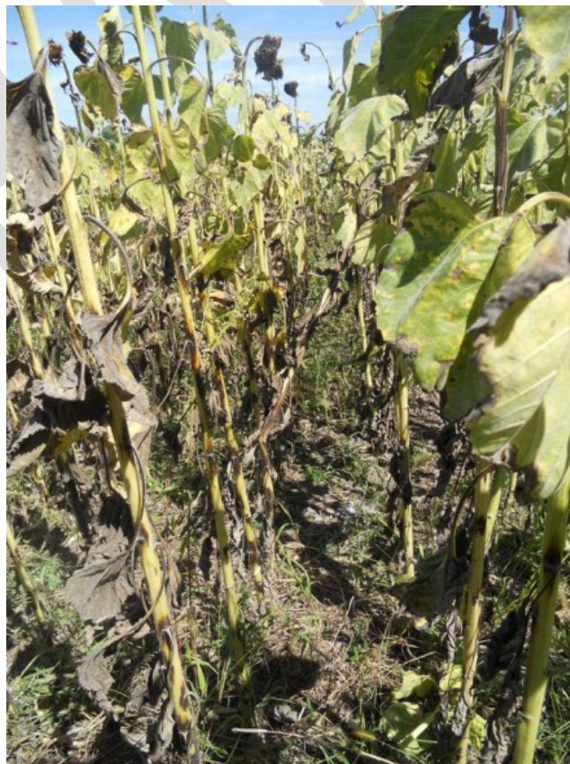
Figure 5. Midstem lodging, Argentina.