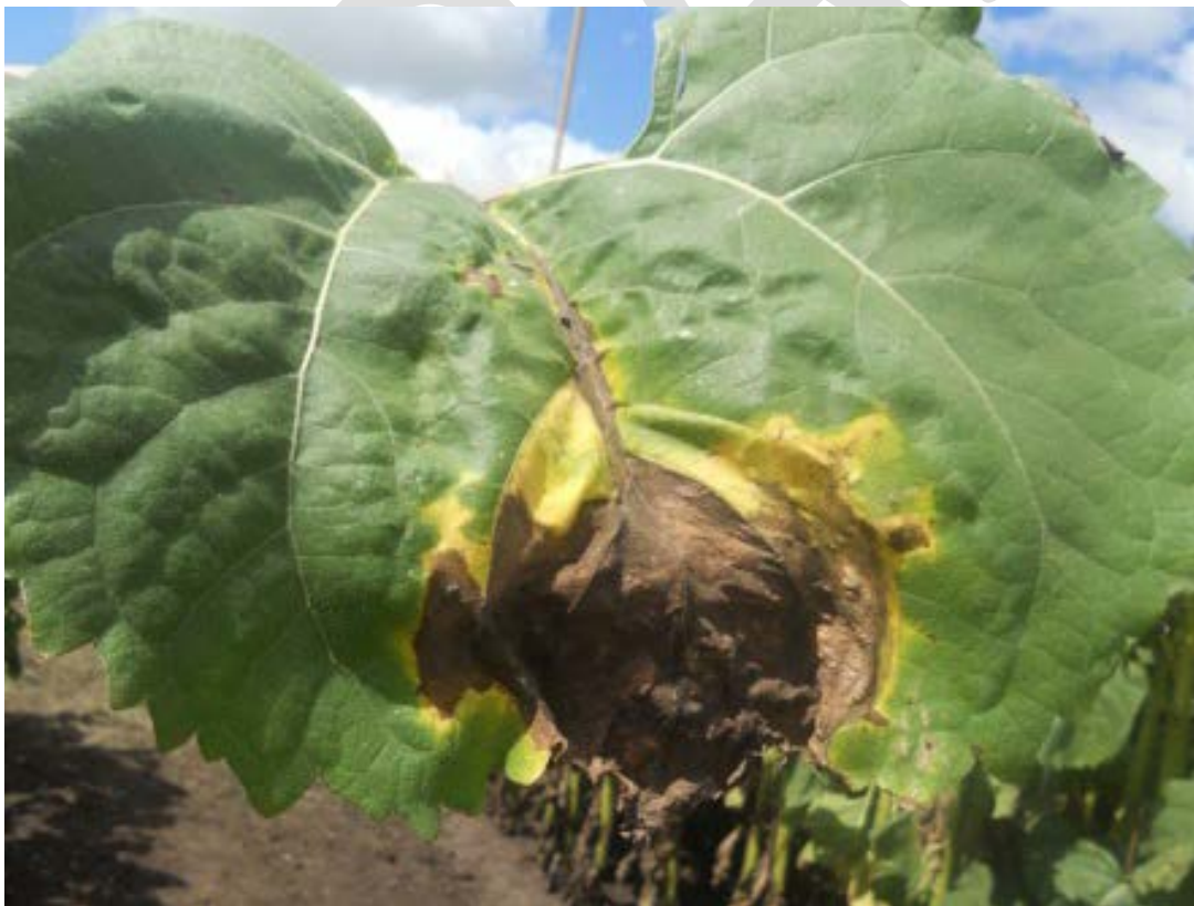
Figure 1. Leaf infection, Argentina.

Masirevic and Gulya (1992) described the symptom progression of D. helianthi . Small necrotic spots surrounded by a chlorotic border develop on the leaf margins and spread down the main veins of a leaf (Fig 1). The infected leaves wilt and die. The fungus spreads from the petiole to the stem, where small, brown, sunken spots develop to large round or ellipsoid lesions that can encircle the stem (Figs 2-4). Destruction of stem pith tissue underneath the lesion leads to wilting and death of the plant (Fig 5) (Masirevic and Gulya, 1992).