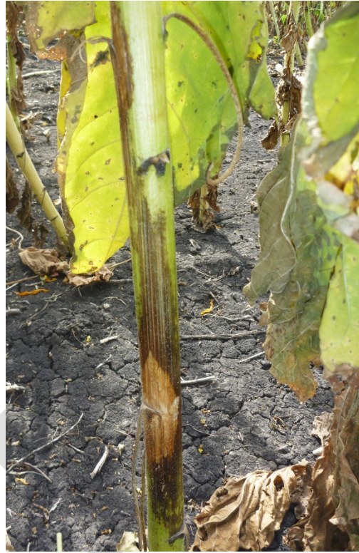
Figures 2 & 3. Stem lesion, Argentina.