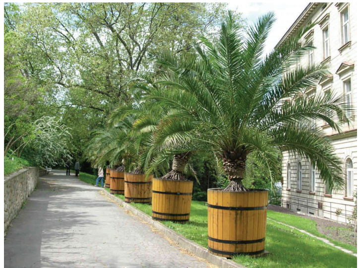
Phoenix canariensis at Charles University Botanical Garden

The current Charles University Botanical Garden was founded in 1898 (some references say 1845) and consists of 3.5 hectares (8.6 acres). There was an older university garden begun in 1775 in Prague, but it was repeatedly damaged by floods over the years and was ultimately relocated to its present site at Na Slupi Street near Charles Square. The botanical garden has the feel of a public park (admission is free) with numerous benches, quiet shady places, and several levels of winding paths, a few of which unexpectedly dead-end. Lilacs, rhododendrons, and azaleas were at their peak of spring bloom when I visited. There are several greenhouses for the protection and display of tender tropical plants, including an extensive collection of cacti, succulents, and aquatic plants, and large old cycads. The bulk of the outdoor collection focuses on trees and flora of central Europe; there is also a small limestone rock garden on a hillside. In addition, there are several mature tree species from North America and large rhododendrons from Asia situated about the garden.