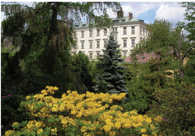
Charles University Botanical Garden

The current Charles University Botanical Garden was founded in 1898 (some references say 1845) and consists of 3.5 hectares (8.6 acres). There was an older university garden begun in 1775 in Prague, but it was repeatedly damaged by floods over the years and was ultimately relocated to its present site at Na Slupi Street near Charles Square. The botanical garden has the feel of a public park (admission is free) with numerous benches, quiet shady places, and several levels of winding paths, a few of which unexpectedly dead-end. Lilacs, rhododendrons, and azaleas were at their peak of spring bloom when I visited. There are several greenhouses for the protection and display of tender tropical plants, including an extensive collection of cacti, succulents, and aquatic plants, and large old cycads. The bulk of the outdoor collection focuses on trees and flora of central Europe; there is also a small limestone rock garden on a hillside. In addition, there are several mature tree species from North America and large rhododendrons from Asia situated about the garden.