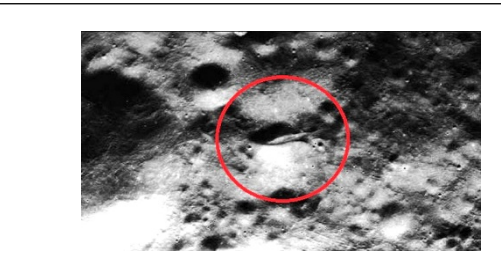
Figure 1: Image from Apollo 20.