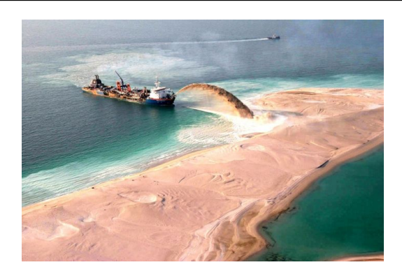
Figure 5: Manmade islands in Dubai.