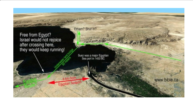
Figure 6: Maps Bible archaeology Exodus Red Sea crossing north Gulf of Suez Egypt [1].