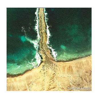
Figure 3: Crossing Red Sea.

Figure 2: Size and scale of the object known as "Alien spaceship" photographed at the Moon Luna 17s 117.5 E.