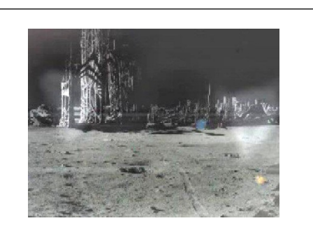
Figure 4: Gothic structures on the moon.