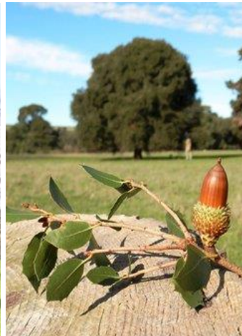
Above) Murndal's Gallipoli oak 'grandfather tree'- source of acorns for The Gallipoli oak project Above) Leaves and acorn of Gallipoli oak, Murndal