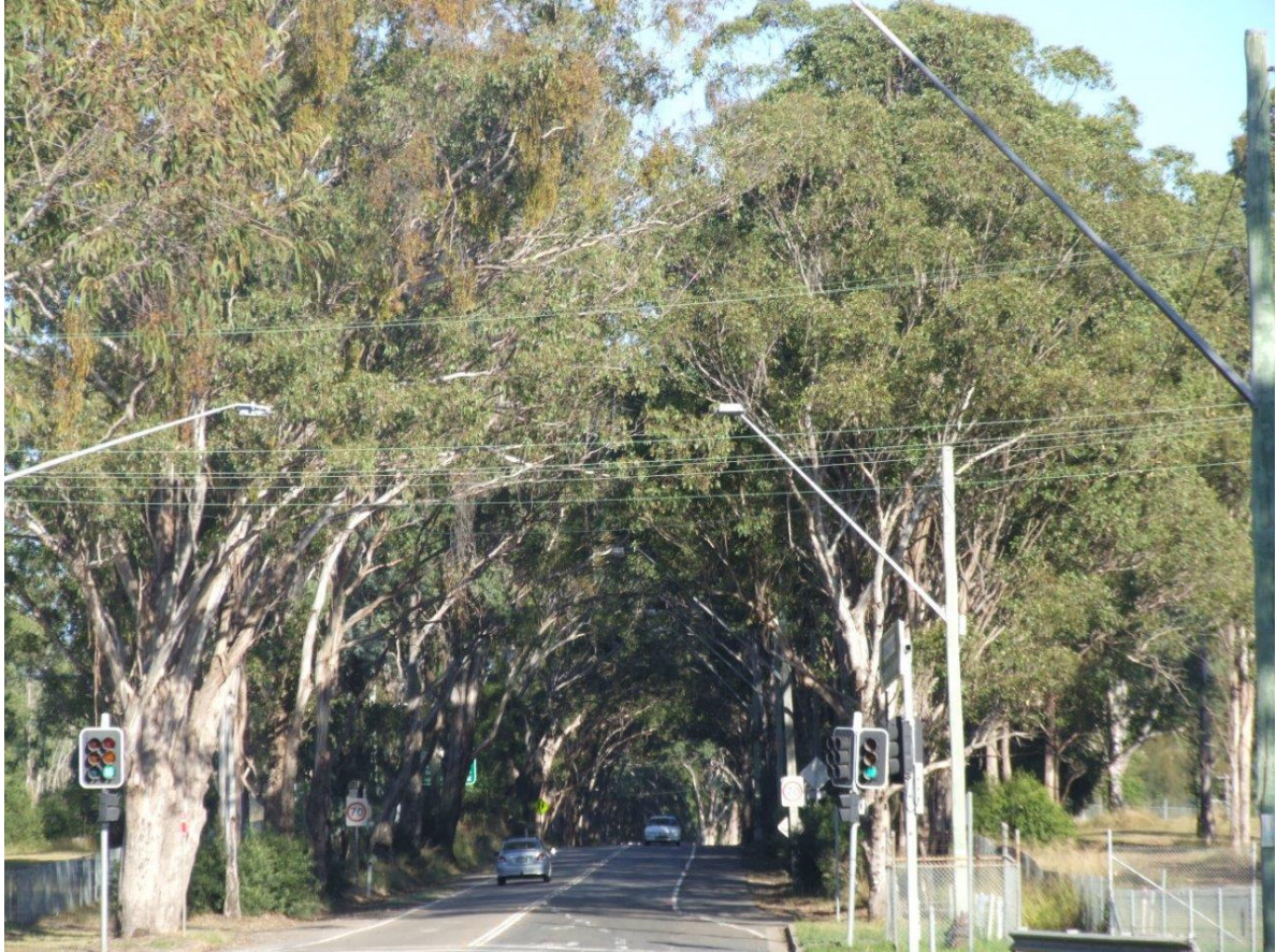
Above) Soldiers' Parade, forest red gums, along Campbelltown Road, Ingleburn, SW Sydney (Stuart Read)