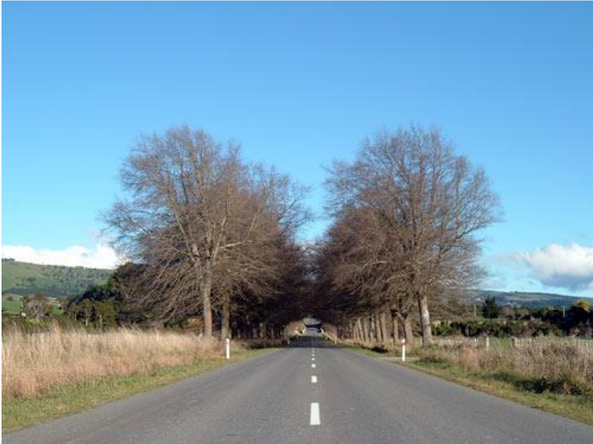
Gladstone, Wairarapa oaks