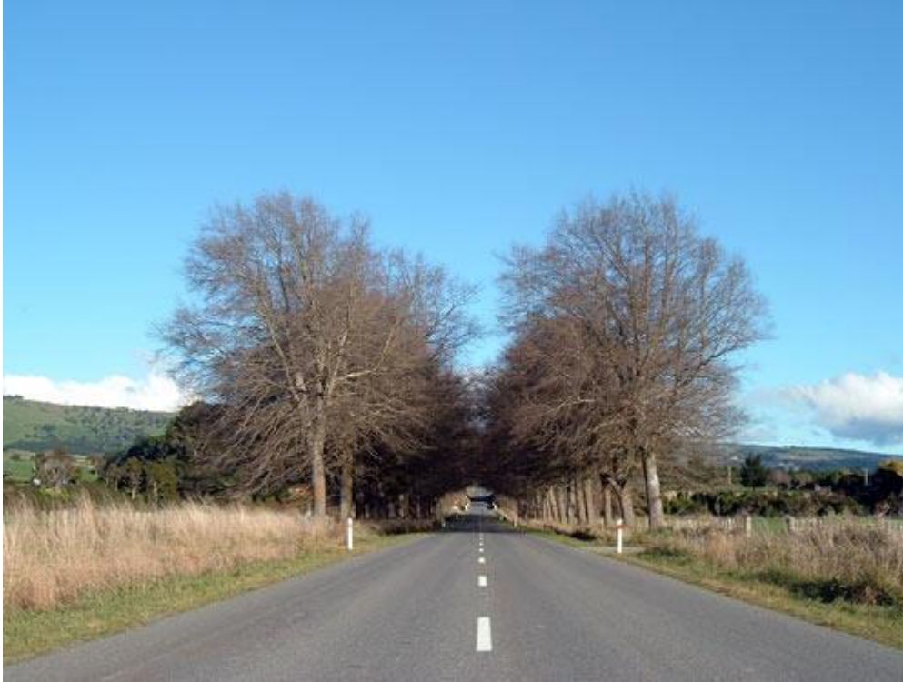
Gladstone, Wairarapa oaks