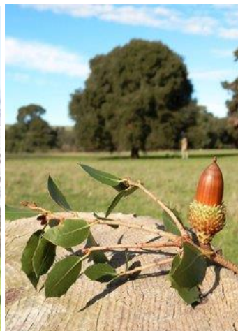
Above) Murndal's Gallipoli oak 'grandfather tree' - source of acorns for The Gallipoli oak project Above) Leaves and acorn of Gallipoli oak, Murndal