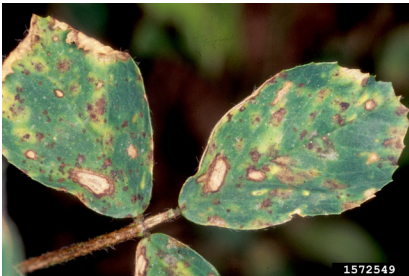
Figure 23. Stemphylium Leaf or Zonate Leaf Spot.