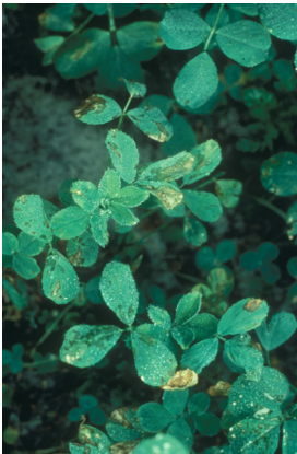
Figure 13. Early lesion development caused by Bacterial Leaf Spot.