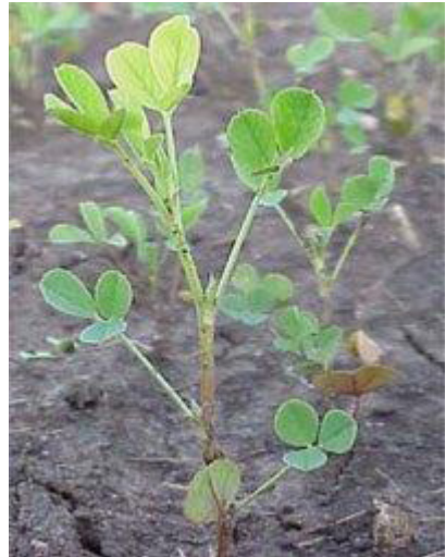
Figure 1. Stunting and yellowing caused by Aphanomyces Root Rot.

Picture courtesy of Dr. Craig Grau, University of Wisconsin-Madison. Permission to use granted by Dr. Damon Smith, University of Wisconsin-Madison.