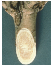
Figure 8. Root symptoms of Bacterial Wilt.