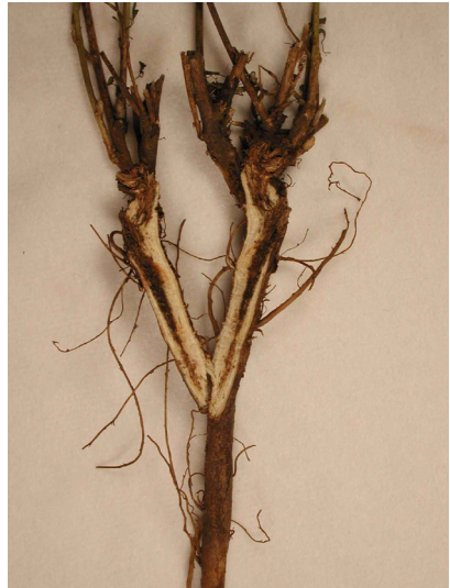
Figure 2. Decayed root tissue caused by Mycoleptodiscus Crown and Root Rot.