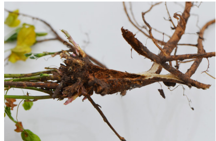
Figure 11. Rotted crown caused by Anthracnose.