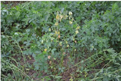
Figure 10. Characteristic straw-colored to pearly white dead shoots with drooping stem (shepherd’s crook) and leaf death caused by Anthracnose. Leaves die after stem is girdled.