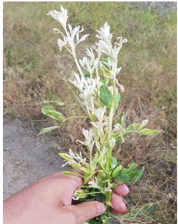
Figure 9. Alfalfa plant showing symptoms of Fusarium Wilt.