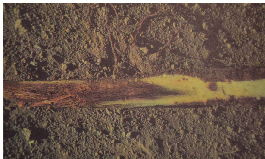
Figure 3. Interior taproot rot caused by Phytophthora Root Rot.