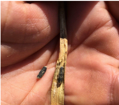
Figure 12. Sclerotia removed from alfalfa stem infected with Sclerotinia Crown and Stem Rot.