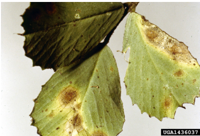
Figure 24. Yellow Leaf Blotch lesions on upper leaf surface.