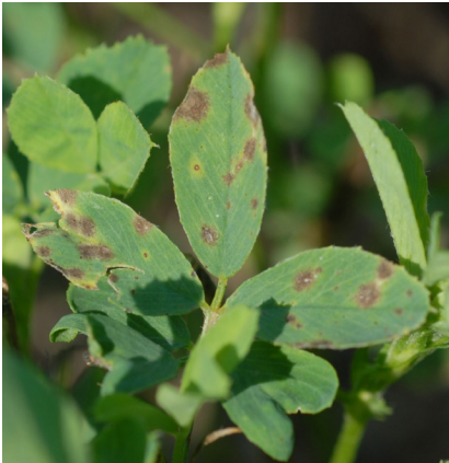
Figure 16. Ash-gray lesions caused by Summer Black Stem and Leaf Spot.