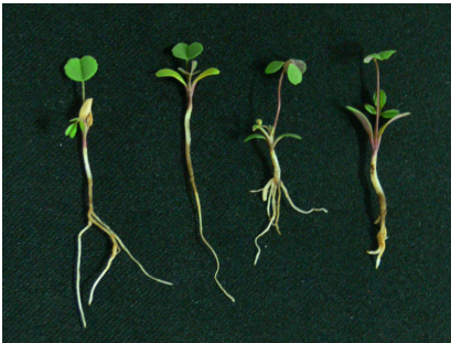
Figure 4. Seedling alfalfa plants showing decay resulting from Pythium.