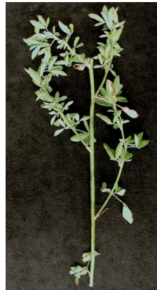
Figure 14. Water soaked stem lesions caused by Bacterial Leaf Spot.