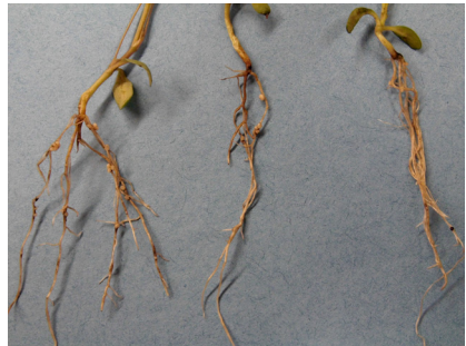
Figure 5. Comparison of healthy (left) and Pythium infected alfalfa roots center and right.