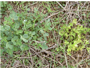
Figure 7. Bacterial Wilt infected plant (right).