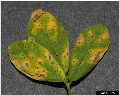
Figure 20. Leptosphaerulina Leaf Spot.