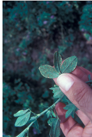
Figure 22. Rust pustules on upper and lower alfalfa leaf surfaces.