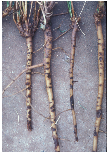
Figure 6. Alfalfa roots showing cankers caused by Rhizoctonia Root Rot.