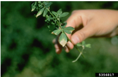
Figure 17. Verticillium Wilt.