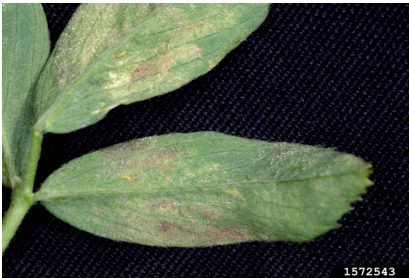
Figure 19. Downy mildew on lower leaf surface.