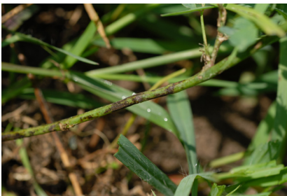
Figure 15. Stem discoloration caused by Spring Black Stem and Leaf Spot.