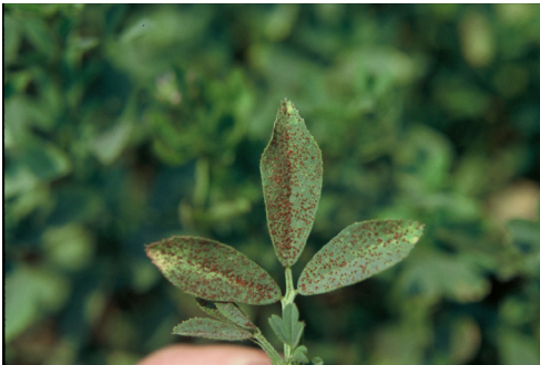
Figure 21. Reddish-brown rust pustules.