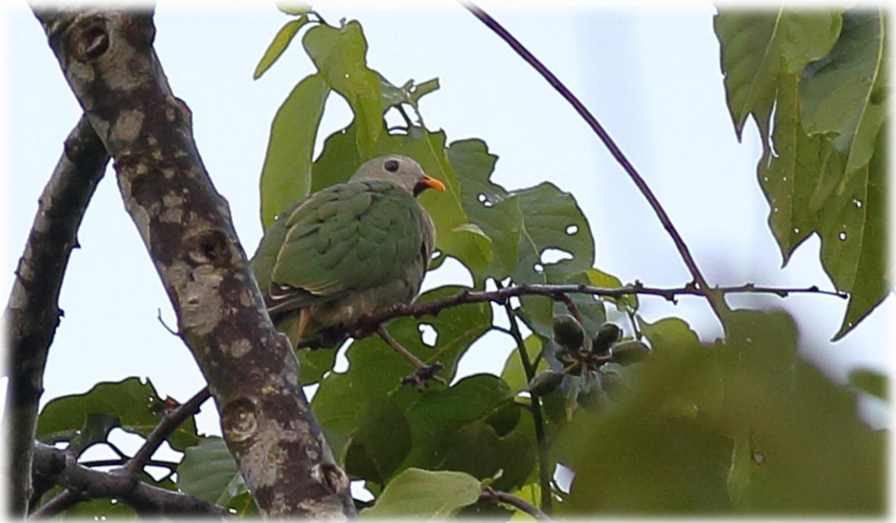
17. Black-chinned Fruit-dove Ramphiculus leclancheri . 1, Jan 18 th PICOP.