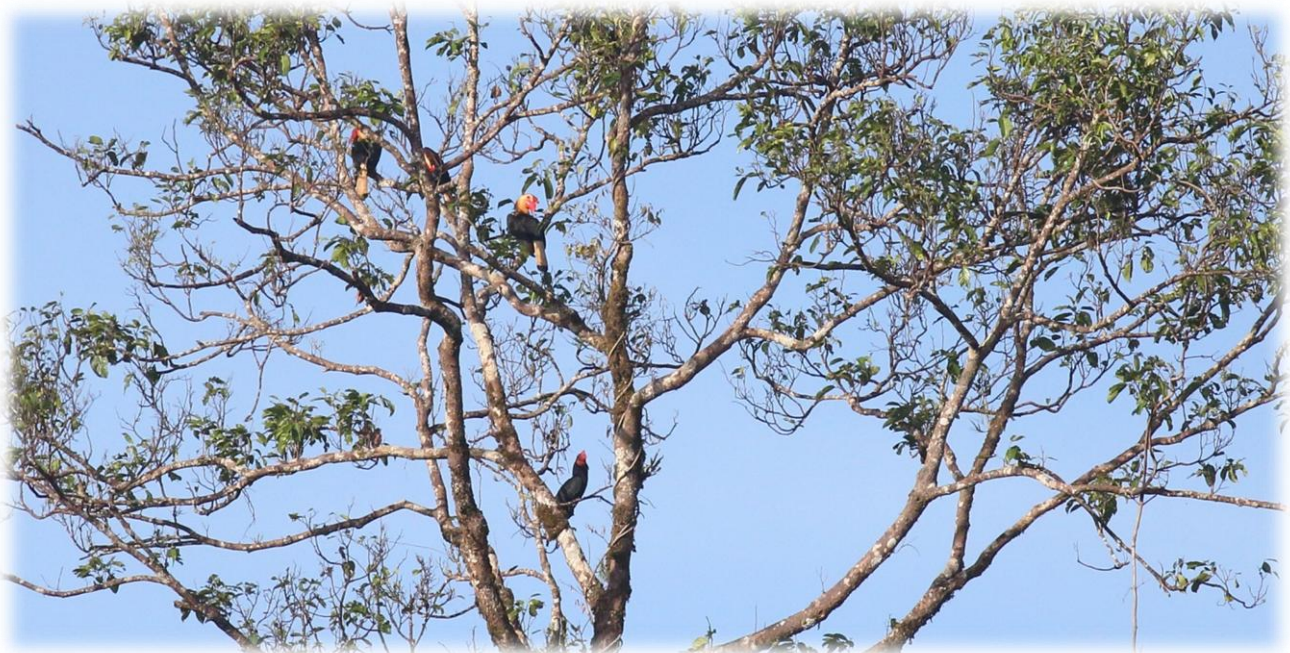
93. Writhed Hornbill Rhabdotorrhinus leucocephalus . 10 birds together one morning at PICOP.