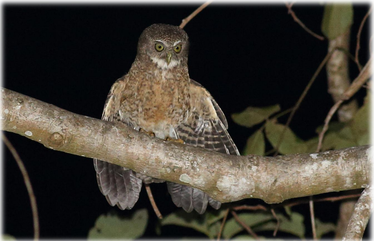
76. CEBU BOOBOOK Ninox rumseyi . 3 birds seen and maybe 2 more heard only, Jan 6 th Tabunan Forest, Cebu out with Oking. The birds were very aggressive calling from dusk at least for 2.5 hours appearing