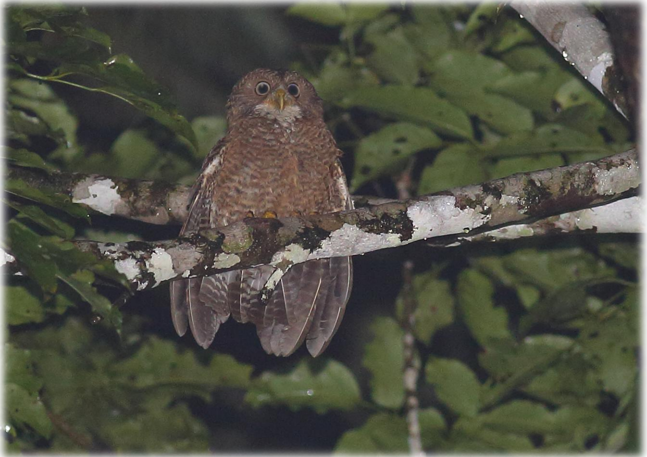
75. CAMIGUIN BOOBOOK Ninox leventisi . A pair, Jan 20 th and 21 st Camiguin Sur. The birds were seen very well by the roadside but remained a little distant for the camera. The windy and rainy weather on the first evening didn't seem to affect them and they called quite frequently at early dusk and late dawn.