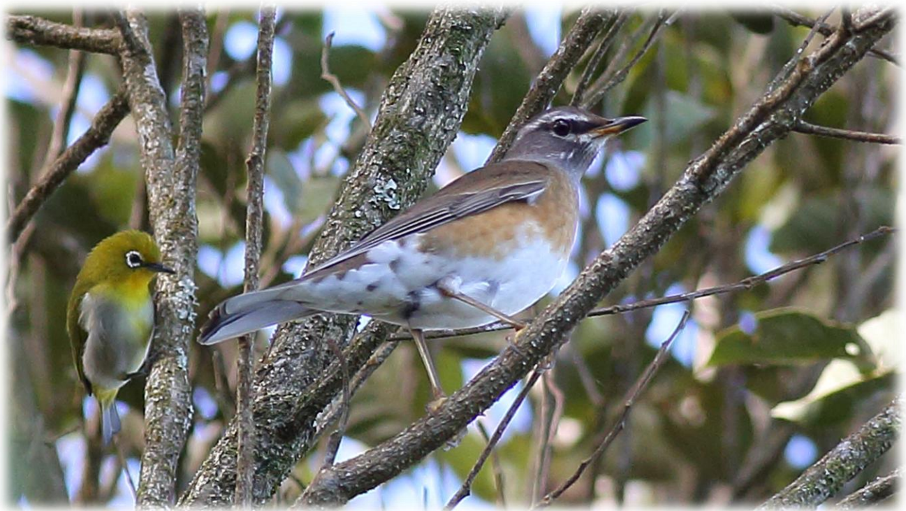
180. Eyebrowed Thrush Turdus obscurus . 90-100 in total at Mt Kitanglad (above). Also 3 at Comval.