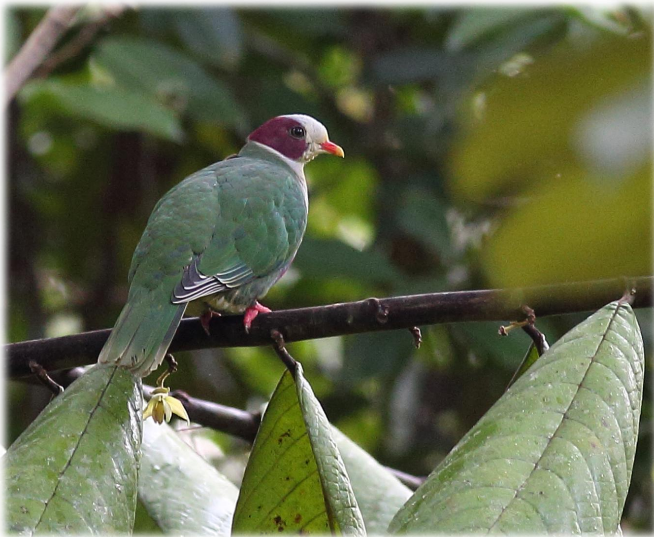
18. Yellow-breasted Fruit-dove Ramphiculus occipitalis . 4 birds, Jan 18 th PICOP Smart birds feeding on the roadside fruit trees in the early morning.