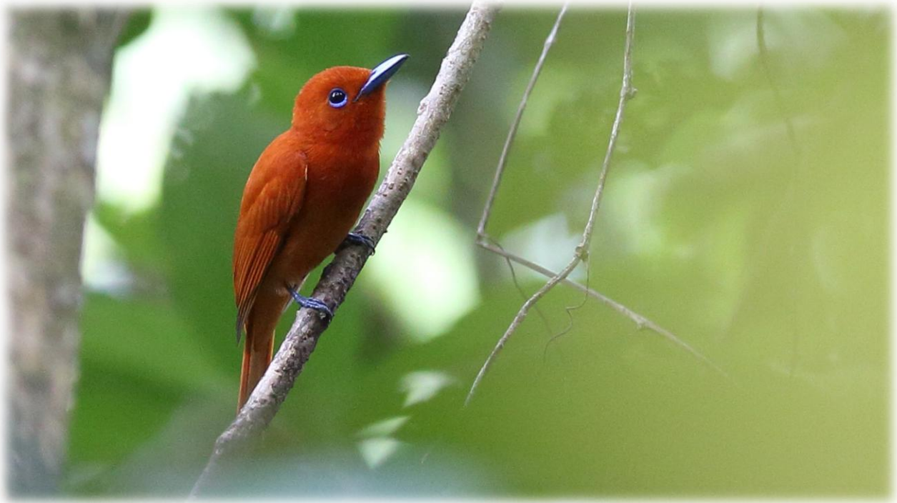
137. Southern Rufous Paradise-flycatcher Terpsiphone cinnamomea . Several birds seen and heard at PICOP most days usually appearing to lead the mixed species flocks.