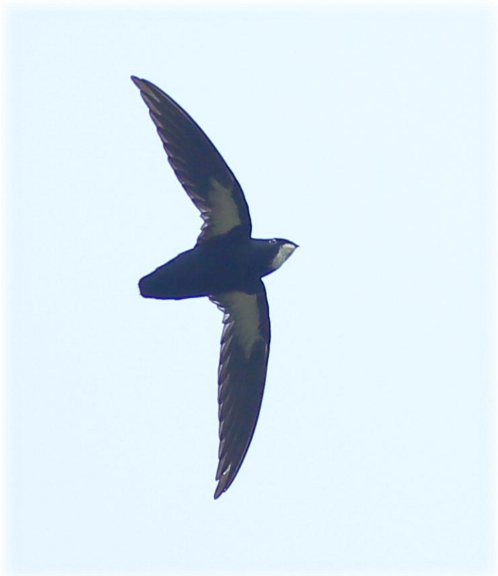
22. Philippine Spinetail Mearnsia picina . 10 birds at Baluno, Zamboanga and 18+ at PICOP in total where photod above. Fantastic birds to watch.