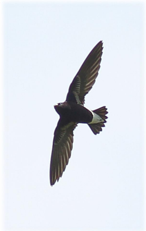
23. Purple Needletail Hirundapus celebensis . 50+ birds watched and photod above on the walk up to Del Monte Lodge, Mt Kitanglad. The speed of these birds was incredible with a loud whoosh as they shot overhead.