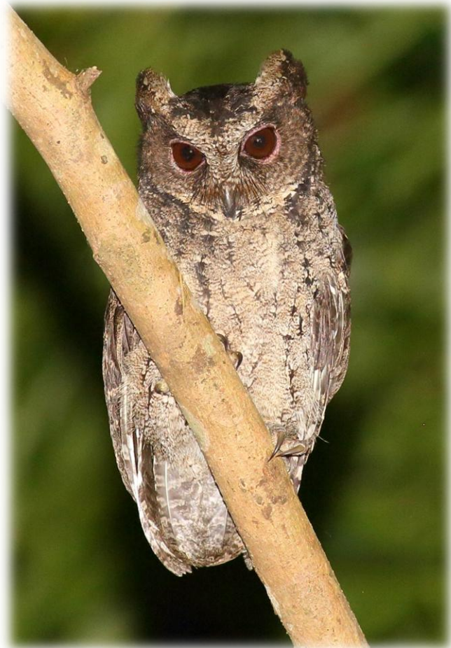
78. MINDANAO LOWLAND SCOPS-OWL Otus everetti . 1, Jan 4 th (left) and 5 th (right) Zamboanga at each Forest station there. Also 1 seen at PICOP was a little tricky to see. AKA Everett's Scops Owl .