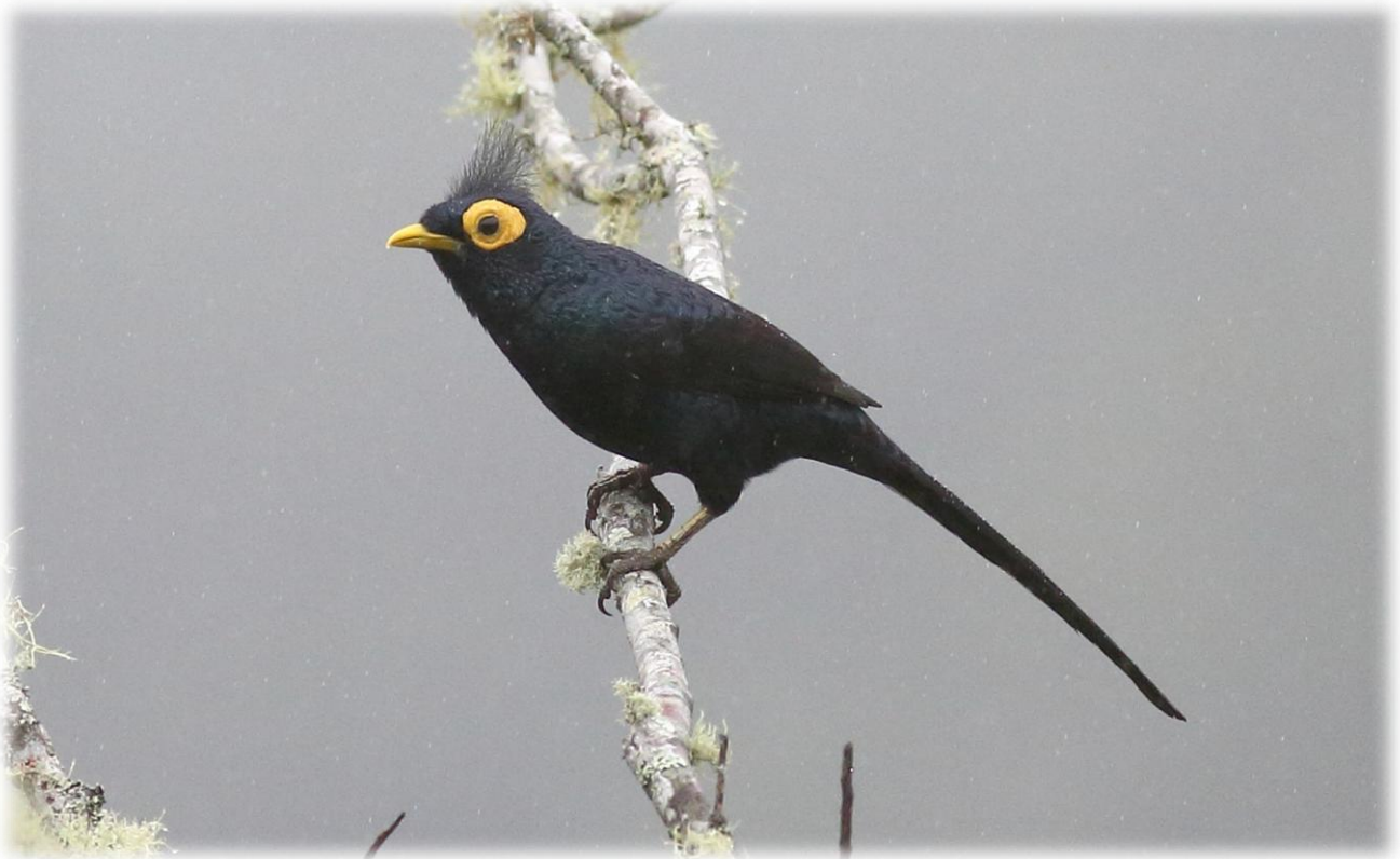
176. Apo Myna Goodfellowia miranda . C30, Jan 9 th and 1 the next day Mt Kitanglad.