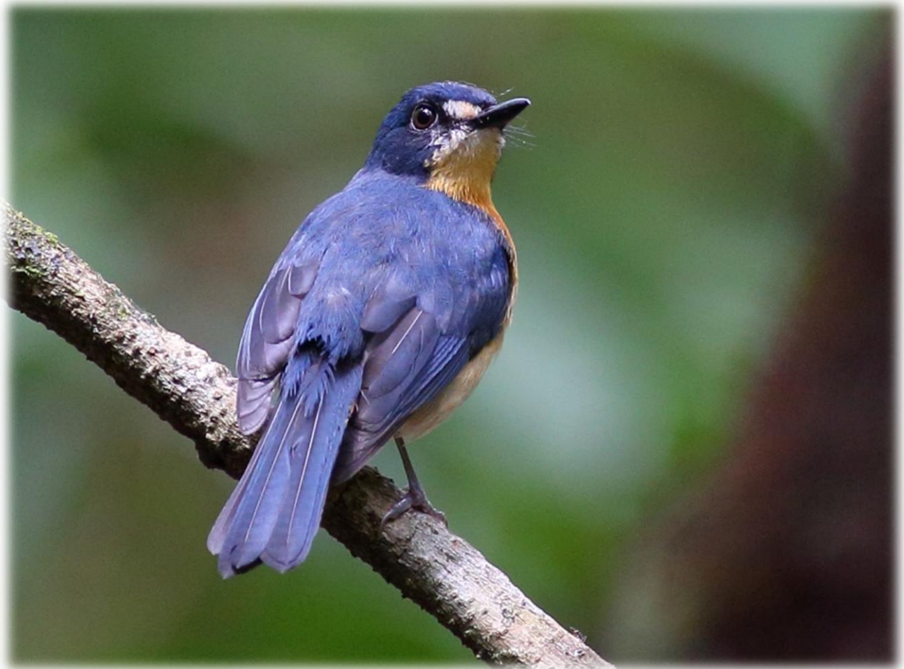
187. Mangrove Blue-flycatcher Cyornis rufigastra . 3+, Tabunan, Cebu (female top with male inset) and common on Camiguin in the dry river bed where we did most of the birding (female lower photo).