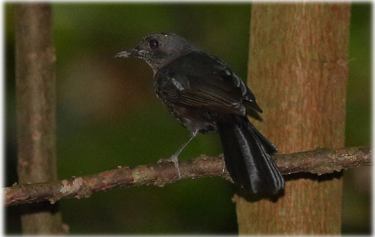
183. Black Shama Kittacincla cebuensis . 2 birds seen at Tabunan Forest, Cebu.