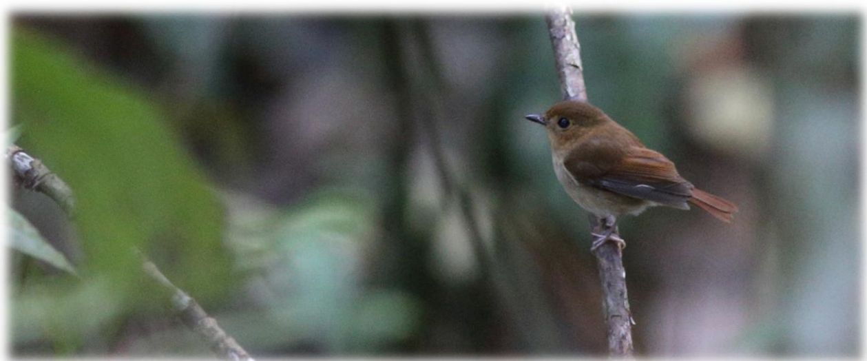
192. Cryptic Flycatcher Ficedula crypta . 1, Jan 11 th Eden along the stream and road.