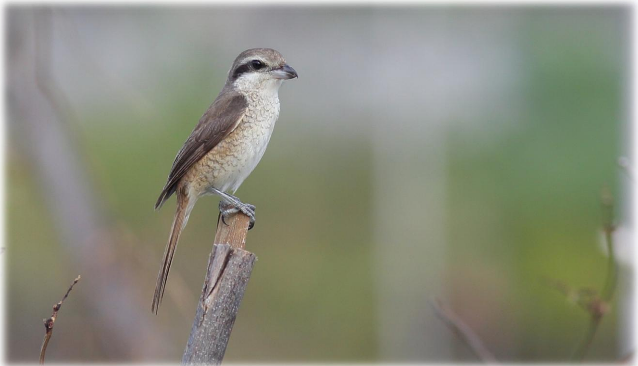
138. Brown Shrike Lanius cristatus . C 20 noted in all, all appearing to be of the ssp lucionensis .