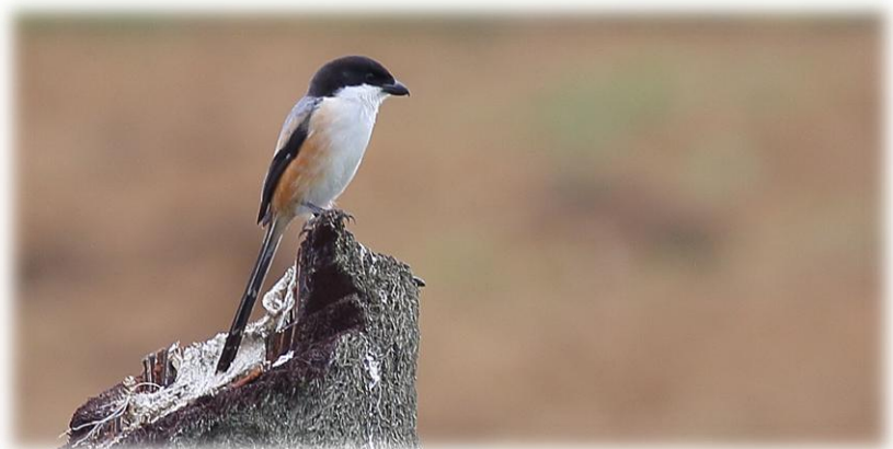
139. Long-tailed Shrike Lanius schach . 5-6 Mt Kitanglad above Del Monte Lodge of the ssp nasutus with a solid black cap and pale grey mantle.