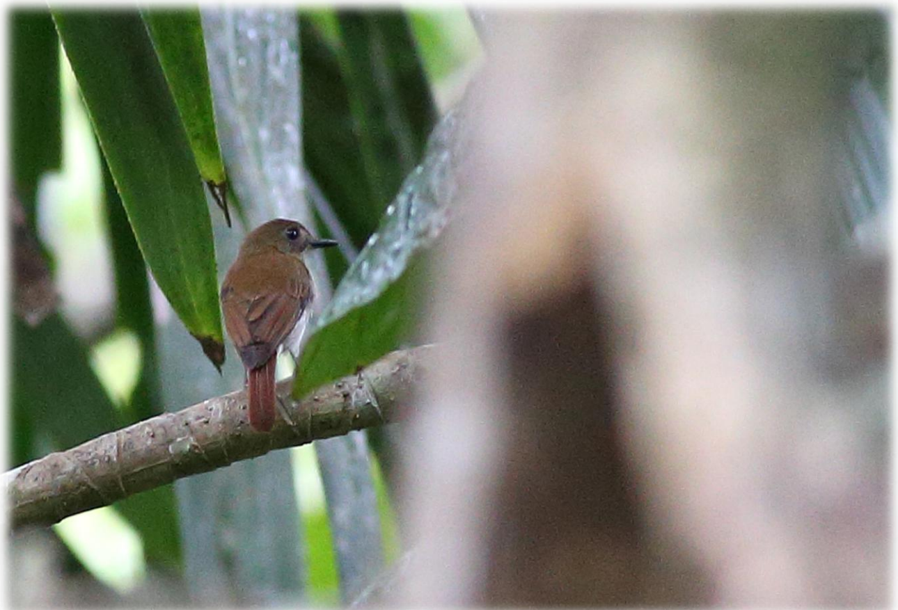
186. Rufous-tailed Jungle-flycatcher Cyornis ruficauda . 3 birds seen at PICOP Jan 16 th -17 th .