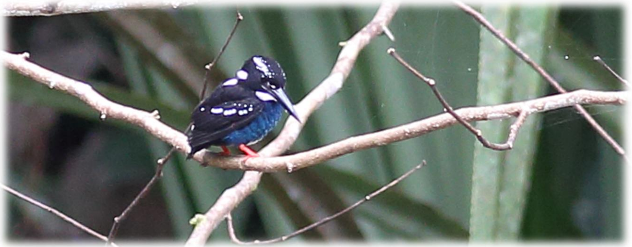
99. SOUTHERN SILVERY KINGFISHER Ceyx argentatus . 1+, Jan 16 th PICOP at a small garden flooded pool. 1, Jan 18 th PICOP along the river at the waterfall site.