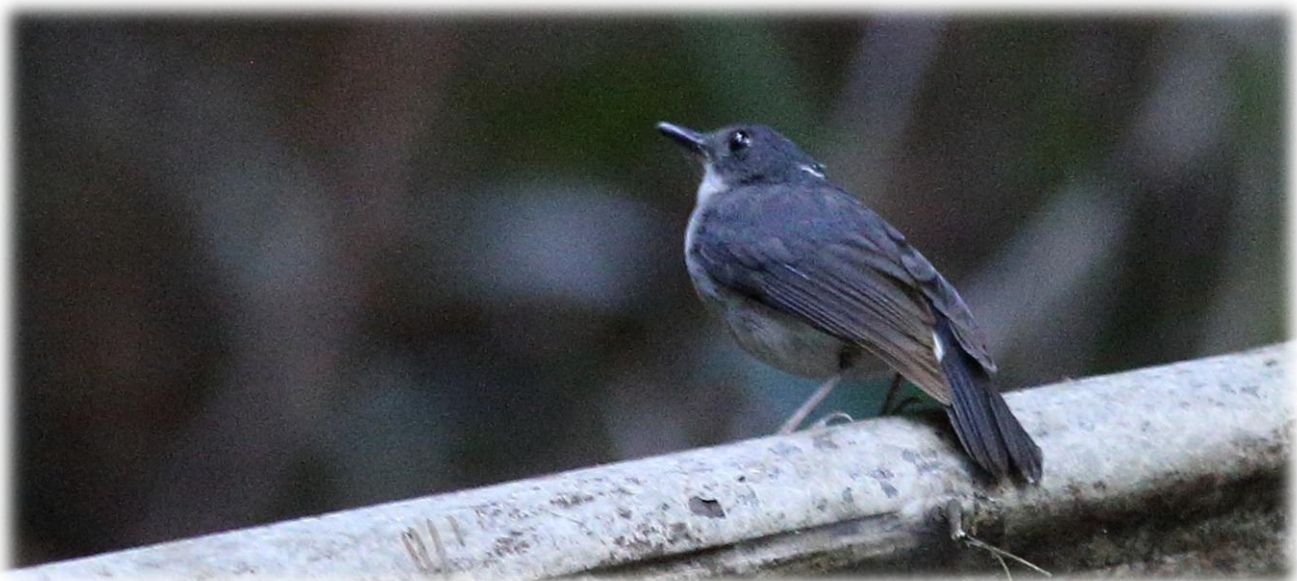
190. Little Slaty Flycatcher Ficedula basilanica . A pair Jan 4 th Zamboanga Watershed in the last light of the evening. The male was quite showy in the darkness but the browner female remained harder to photograph staying back in the dense undergrowth.