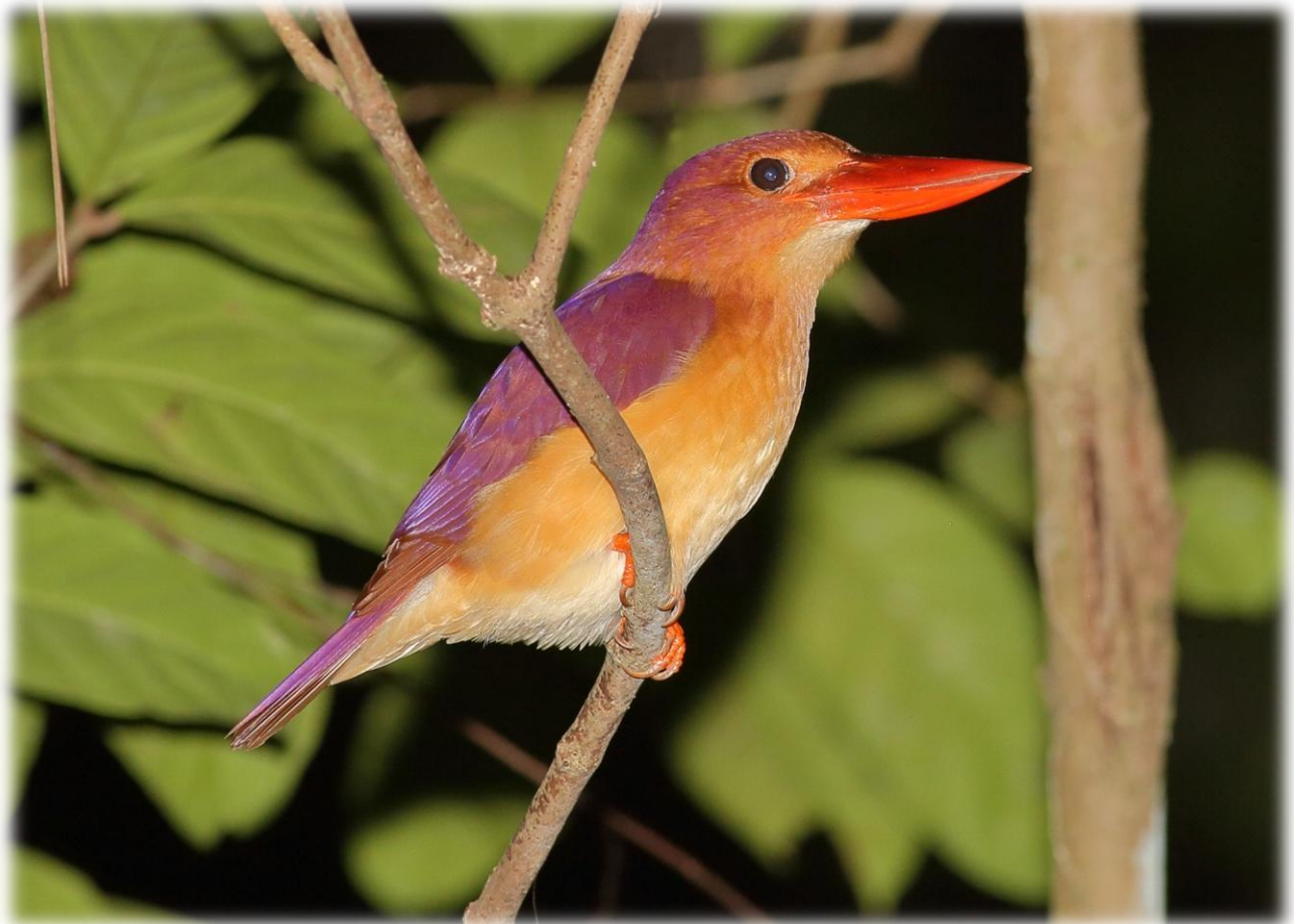
101. Ruddy Kingfisher Halcyon coromanda . 1-2 birds at Eden along the river. The photo above was of a roosting bird taken just after dusk.