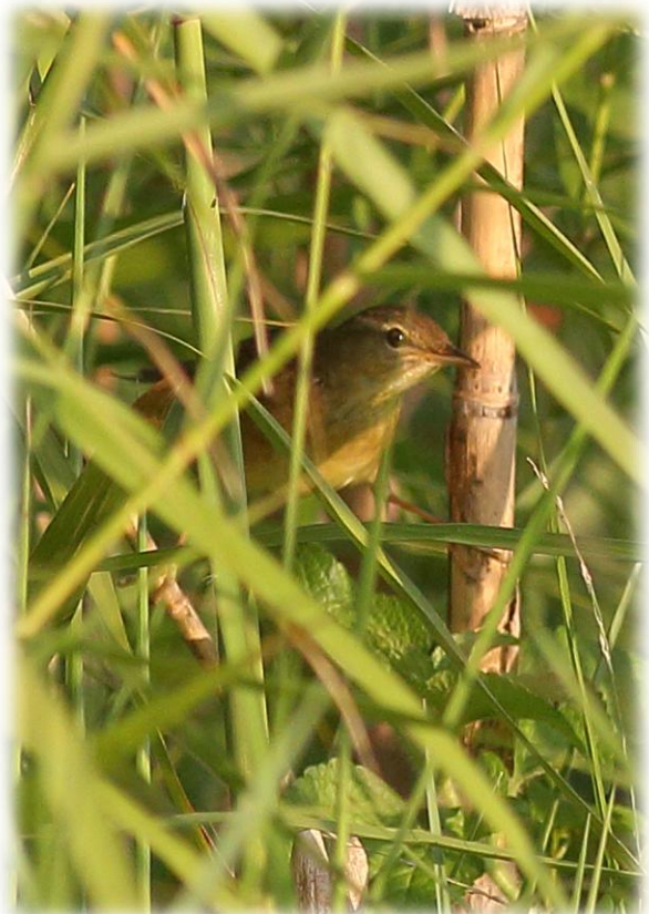
150. Middendorff's Grasshopper-warbler Locustella ochotensis . I, Jan 19 th Bislig Airfield responded to the taped song by singing back. It showed initially well to Dan, but by the time we got there it responded but remained mostly in cover. Like a pale, washed out Pallas's Gropper.