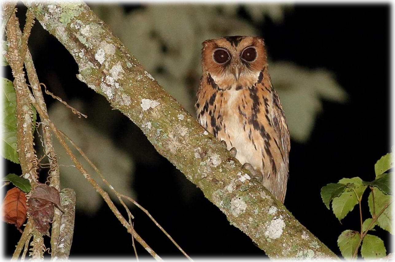
77. Giant Scops-owl Otus gurneyi . 1, Jan 8 th Del Monte Lodge, Mt Kitanglad performed well but briefly but was only heard the next night. Another bird was also heard (by me.. the others actually saw it) at the Woodcock clearing. Also known as Mindanao Eagle owl.