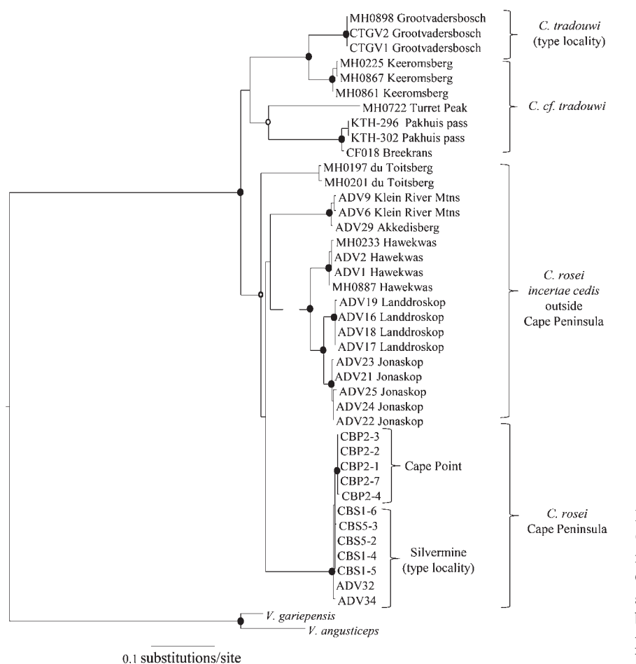
FIG. 2 The best likelihood tree for Capensibufo spp., based on amplified fragments of 16S and ND2 markers. Circles at each node indicate the level of support: filled circles, \geq 70% likelihood bootstrap and \geq 0.95 Bayesian posterior probabilities; unfilled circles, \geq 70% likelihood bootstrap.

a previously unknown breeding site at Cape Point (although this was close to historical observations of single individuals), both of which had adult toads, spawn and tadpoles. At the Silvermine site there were hundreds of adult toads, whereas there were < 100 at Cape Point (GJM & KAT, pers. obs : additional work is being carried out to estimate the