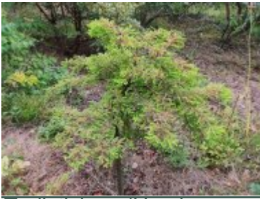
T. distichum 'Hursley Park'

Burncoose Nurseries: Gwennap, Redruth, Cornwall TR16 6BJ