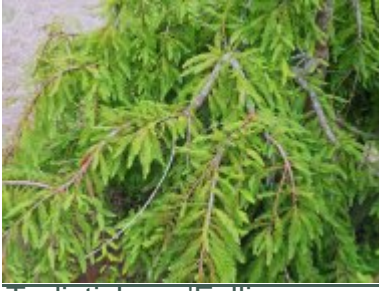
T. distichum 'Falling Waters'