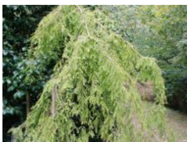
T. distichum var. imbricatum 'Nutans'