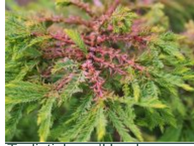
T. distichum 'Hursley Park'