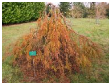
T. distichum 'Falling Waters'