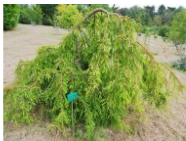
T. distichum 'Falling Waters'