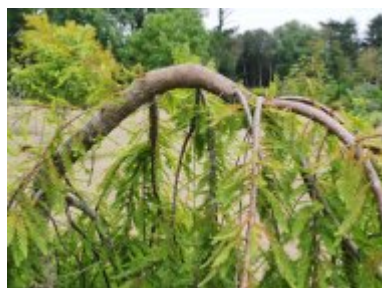
T. distichum 'Falling Waters'