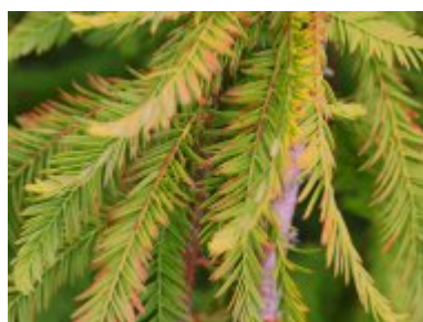
T. distichum 'Falling Waters'