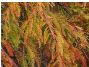
T. distichum 'Falling Waters'