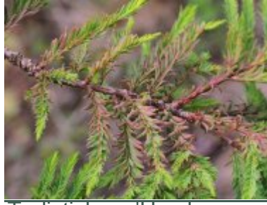
T. distichum 'Hursley Park'