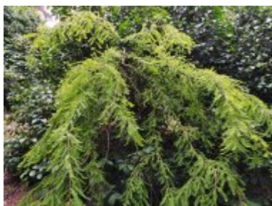
T. distichum 'Falling Waters'