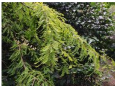
T. distichum 'Falling Waters'