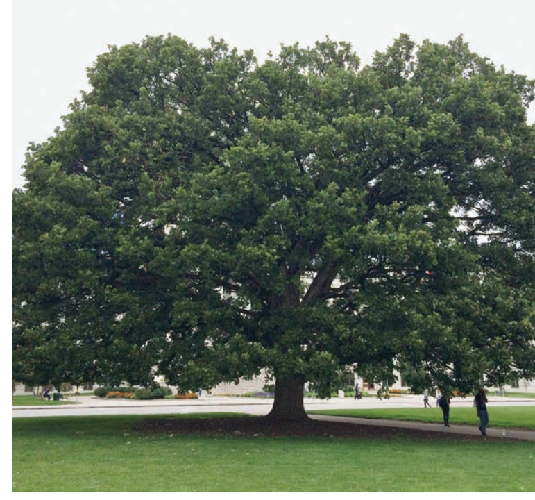
Quercus macrocarpa (bur oak), Denver Civic Center

The original survey focused on the more rare and unusual species of that period, such as the various oak species, sugar maples, Japanese pagoda tree, horse chestnuts, buckeyes, Kentucky coffee tree and others. Many of these trees have proven to be tough, standing the test of time, and planted in parks and parkways by the City of Denver with success. The City is confident in recommending many of these trees to developers and homeowners in the metro area. With the results of this study, we can show people what these trees will look like as they mature in 50+ years.