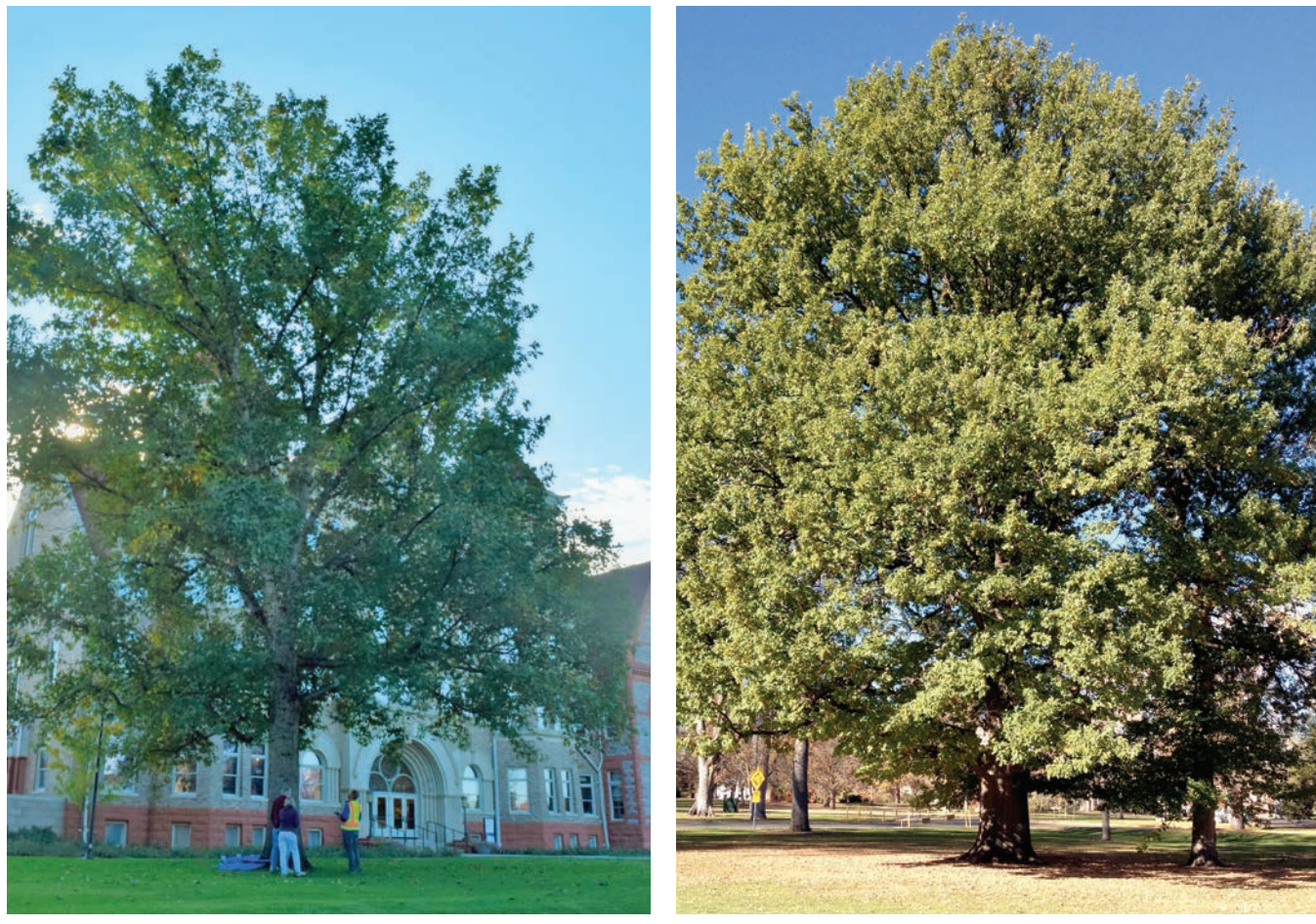
Quercus muhlenbergii (chinkapin oak), Johnson and Wales University

Growth in height is not as instructive for a couple reasons: The original survey only showed heights within a 10-foot range, and many species seem to "top out" in a certain height range once mature, although they continue to grow in diameter. For example, a set of bur oaks planted around 1870 and measured in 1933 show that the heights now are still about the same as in 1933, but the diameters have increased about 20-30 inches. (See final section for further discussion of these trees.)