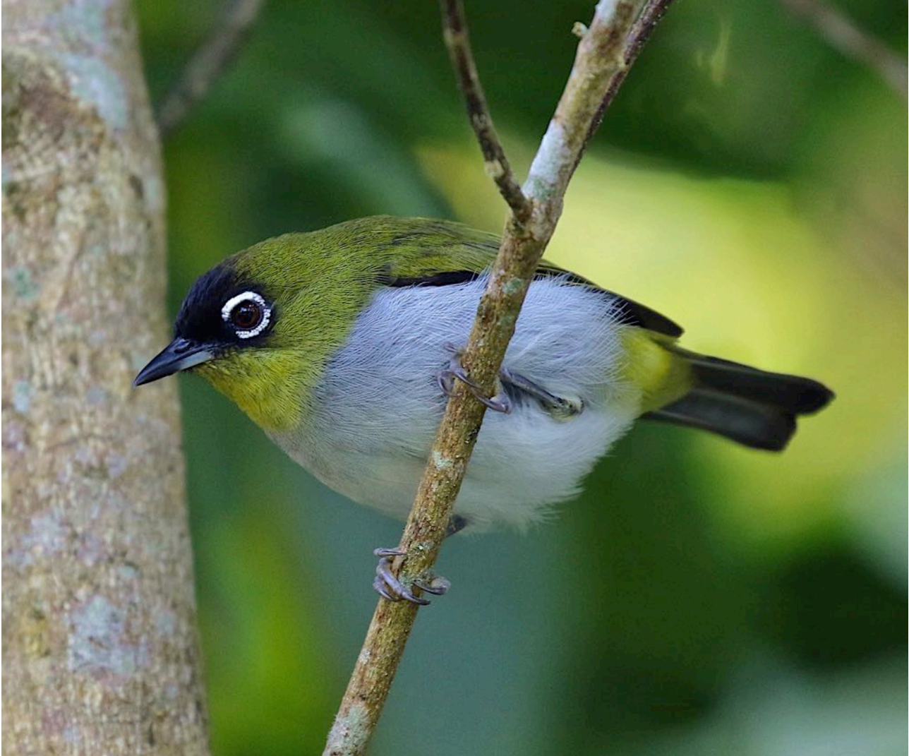
Black-crowned White-eye (Craig Robson)

Sulawesi Leaf Warbler Phylloscopus [sarasinorum] nesophilus As for the last species ( nesophilus ). Island Leaf Warbler (Halmahera L W, North Moluccan L W) P. [maforensis] henrietta 1 seen well Buli Road. Chestnut-backed Bush Warbler (Sulawesi Grasshopper W) Locustella castanea Some good views Lore Lindu. Gray's Grasshopper Warbler Locustella fasciolata 1 perched up nicely along the Buli Road; 1 heard. Golden-headed Cisticola Cisticola exilis Scattered on Sulawesi and Halmahera ( rusticus ). Sulawesi Babbler Trichastoma celebense Widespread. Race finschi in SW, rufoscum in NC, and nominate in NE.