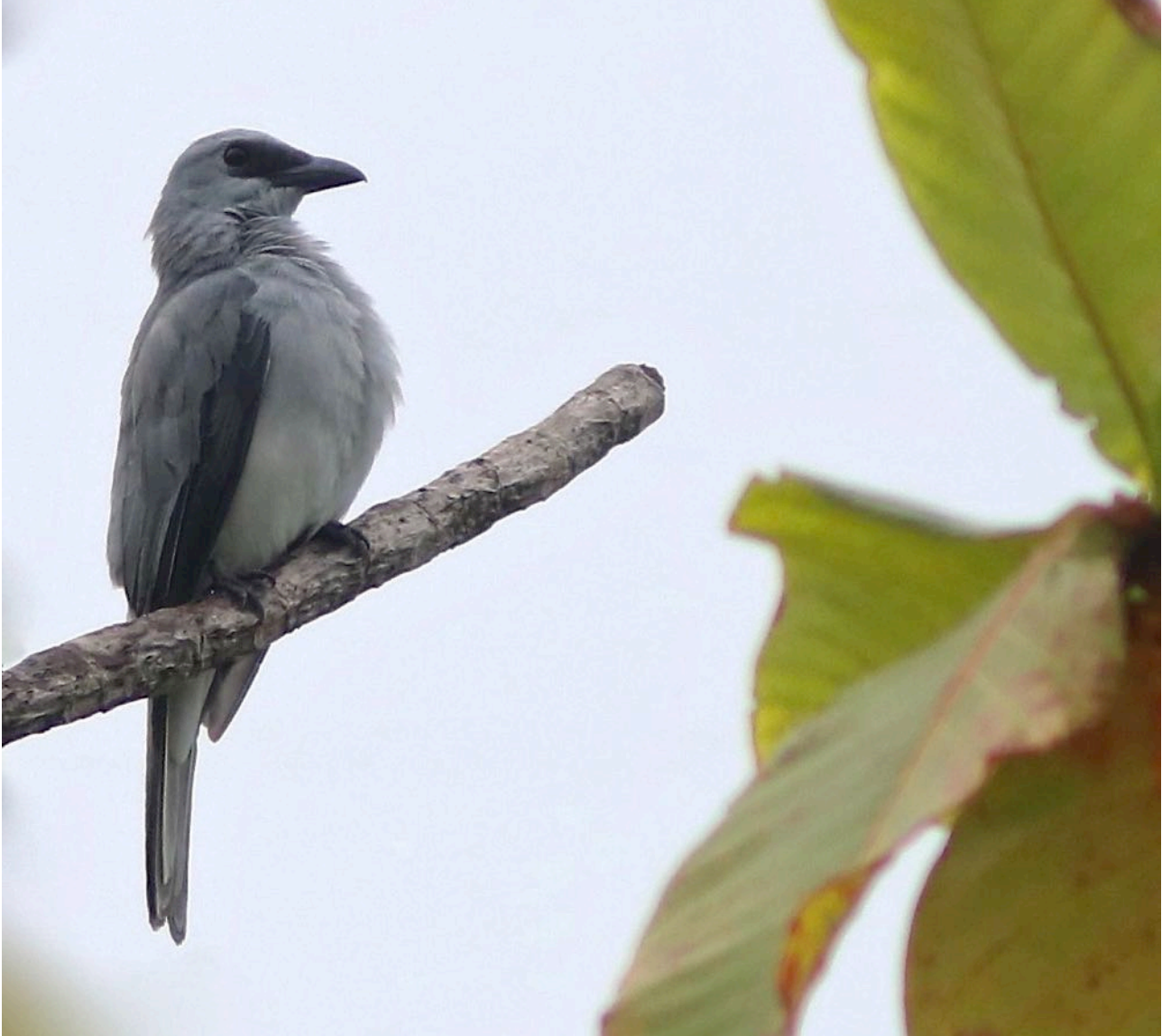
White-bellied Cuckooshrike (John Drummond)

White-breasted Woodswallow Artamus leucorhynchus Widespread: albiventer Sulawesi, leucopygialis Halmahera. Ivory-backed Woodswallow Artamus monachus Many sightings in the Lore Lindu area. Monotypic endemic. Moluccan Cuckooshrike Coracina atriceps Just one on Halmahera ( magnirostris ). Cerulean Cuckooshrike Coracina temminckii Several good looks at these at in the Lore Lindu region. Pied Cuckooshrike Coracina bicolor A group of four vocalising in the tree-tops at Tangkoko. A monotypic endemic. White-rumped Cuckooshrike Coracina leucopygia Easily seen at Tangkoko. Another monotypic endemic.