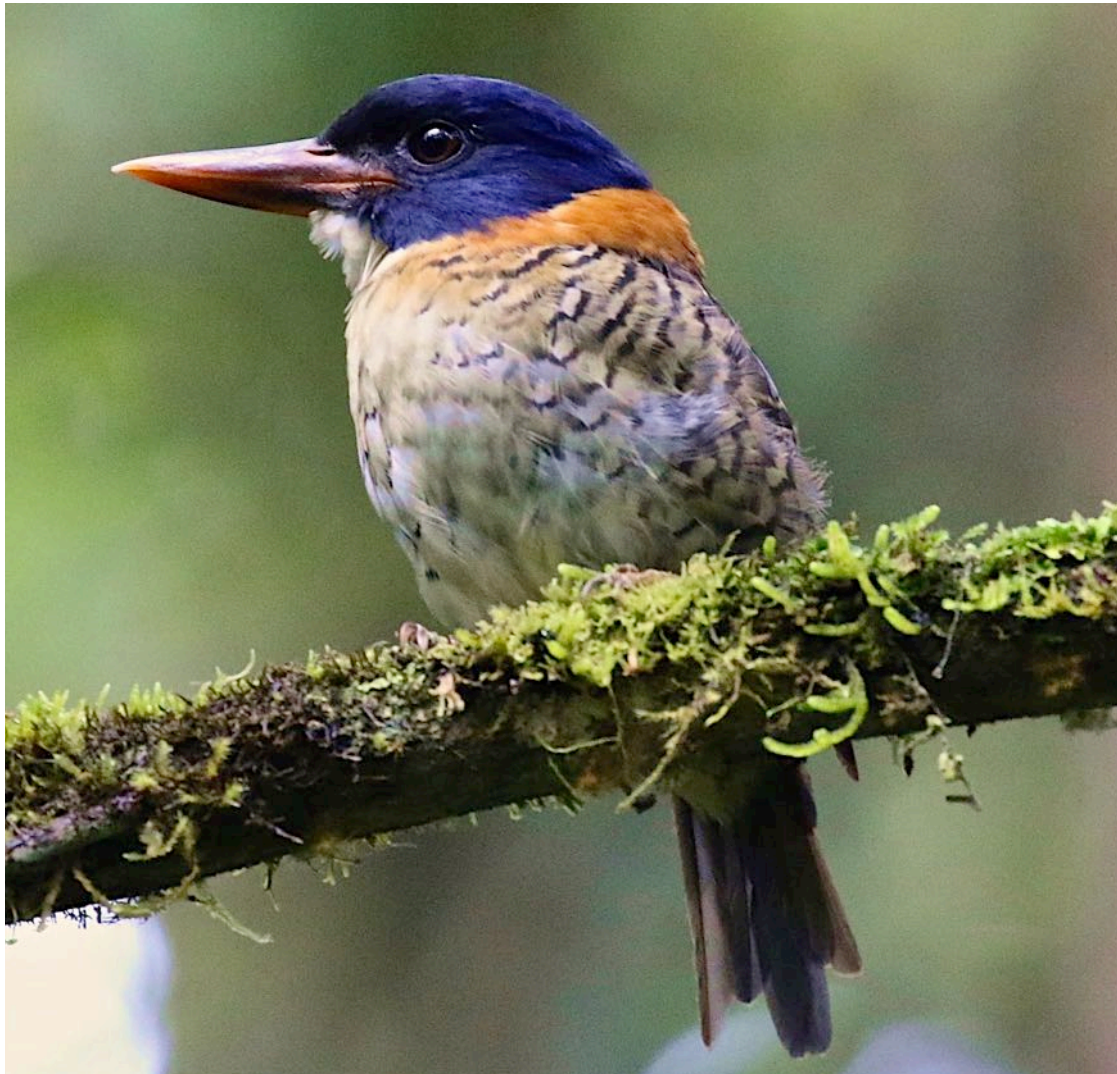
Scaly-breasted (or Lore Lindu) Kingfisher at Lore Lindu NP

We began the tour in Makassar in south-west Sulawesi. Early on our first morning we drove out of town to the nearby limestone hills of Karaenta Forest. Here the endemic Black-ringed White-eye performed for us soon after we had eaten our breakfast at the roadside and, as the forest awoke, we added some of the commoner endemics, as well as a perched Grey-headed Imperial Pigeon, White-rumped Triller and some fly-over Sulawesi Mynas. Horsfield's Bronze Cuckoo was unexpected, but our lengthy searches for the other local specialities proved fruitless, though a number of endemic Moor Macaques turned up at the roadside.