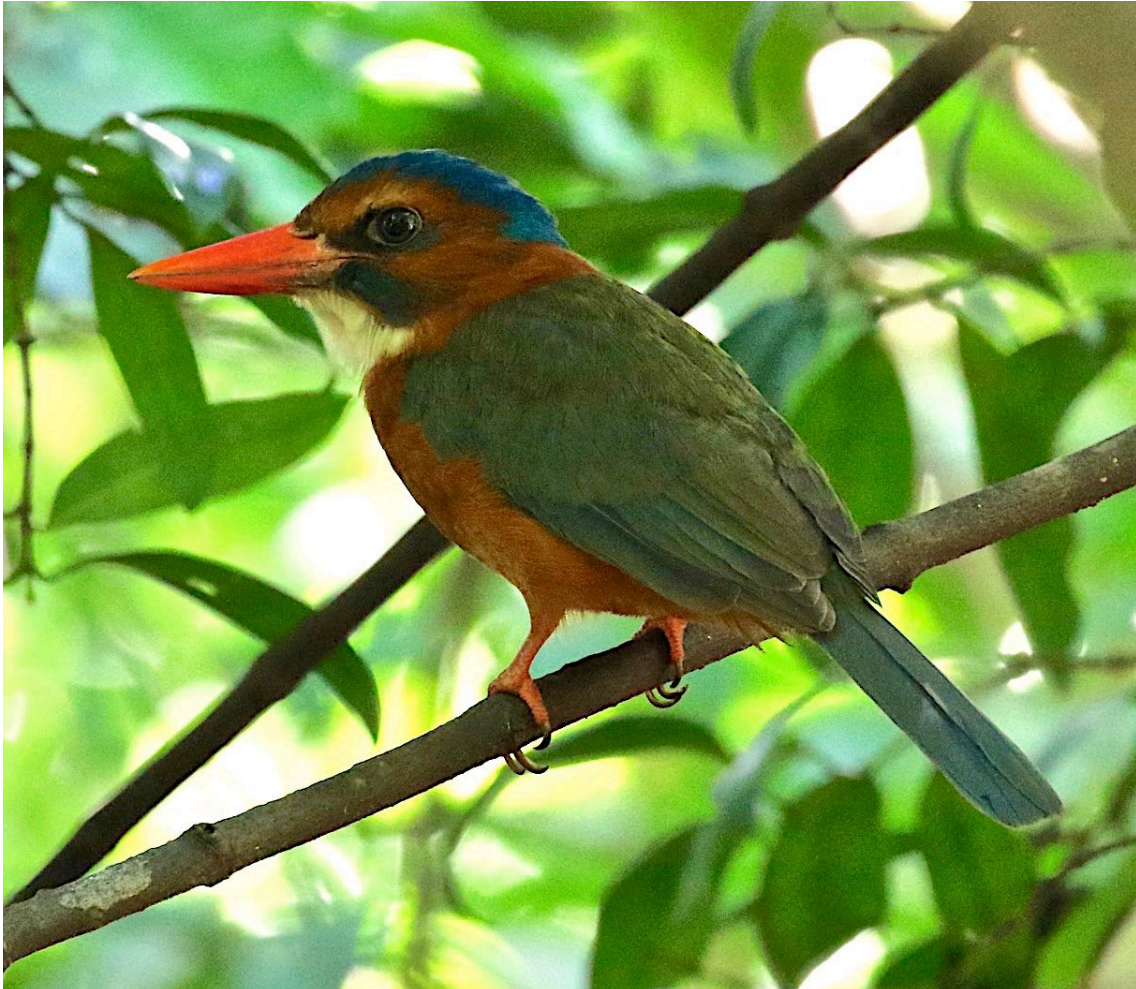
Green-backed Kingfisher at Tangkoko

Over the next couple of days, led along a network of forest trails by our experienced guides, we had a large number of really important target birds to track down. Things could hardly have gone much better, as we systematically bagged Philippine Megapode, several Sulawesi Goshawks, Isabelline Bush-hen, White-faced Cuckoo-Dove, Stephan's Emerald Dove, Bay Coucal, roosting Sulawesi Scops Owls and Ochre-bellied Boobooks, Purple-winged Roller, Green-backed, Lilac, Great-billed and Sulawesi Dwarf Kingfishers, Sulawesi Hornbill, Sulawesi Pygmy and Ashy Woodpeckers, Blue-backed Parrot, Ornate Lorikeet, a very nice Sulawesi Pitta, Pied Cuckooshrike, White-necked Myna, Grosbeak Starling, and a stonking Red-backed Thrush.