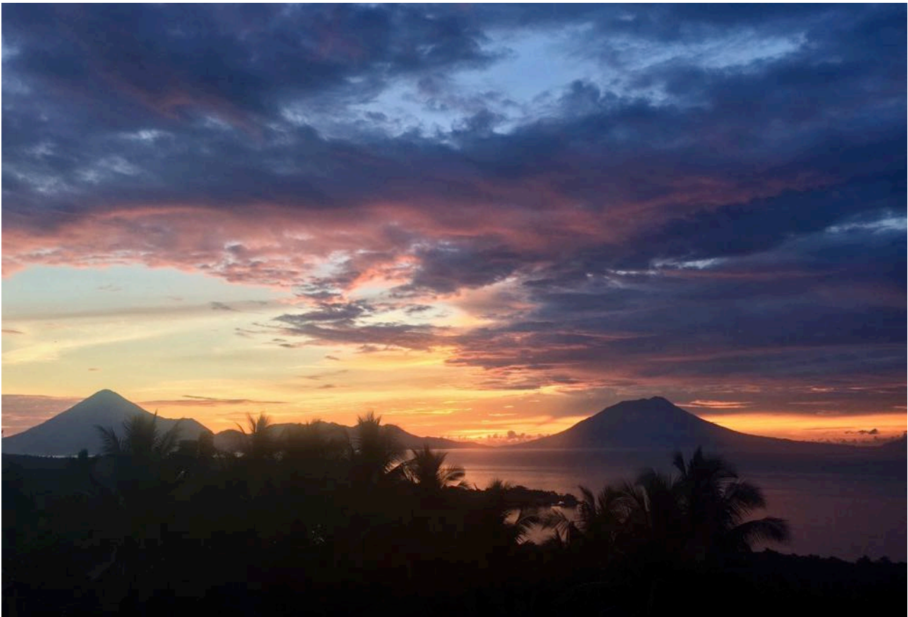
Sofifi Sunset, Halmahera