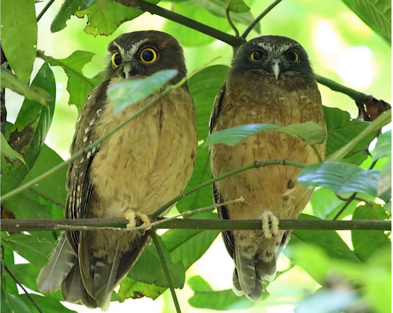
Clockwise from top left: Moluccan Scops Owl, Sulawesi Scops Owl, and Ochre-bellied Boobook (Craig Robson)