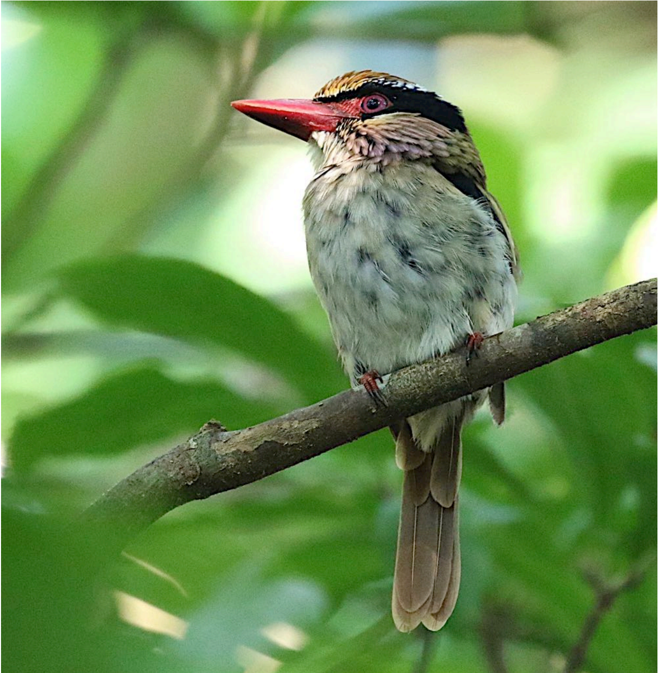
Lilac Kingfisher (Craig Robson)

Minahassa Masked Owl Tyto inexpectata (H) Frustratingly only heard once at Tangkoko National Park. Moluccan Scops Owl Otus magicus Great views near Sidangoli ( leucospilus ). Many heard. Sulawesi Scops Owl Otus manadensis Three seen very well at Tangkoko; night and day. Ochre-bellied Boobook Ninox ochracea Night and day at Tangkoko; four seen. Monotypic endemic. Cinnabar Boobook Ninox ios Excellent views of one along the Anaso Track. Endemic. Halmahera Boobook Ninox hypogramma One performed nicely at Foli; others heard. Monotypic endemic. Speckled Boobook N. punctulata Lovely views near our accommodation at Lore Lindu. Monotypic endemic. Satanic Nightjar Eurostopodus diabolicus One roosting along the Anaso Track. Monotypic endemic.