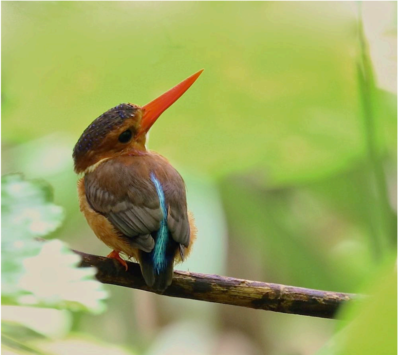
Sulawesi Dwarf Kingfisher (Craig Robson)

From Subaim, we drove to some much-improved accommodation at Sofifi, to the south-west of Sidangoli and, early the next morning birded the track at Tanah Putih. A calling Moluccan Scops Owl showed beautifully as it was getting light and, during a brief birding sortie, we tallied Black-chinned Whistler and some very showy Shining Monarchs.