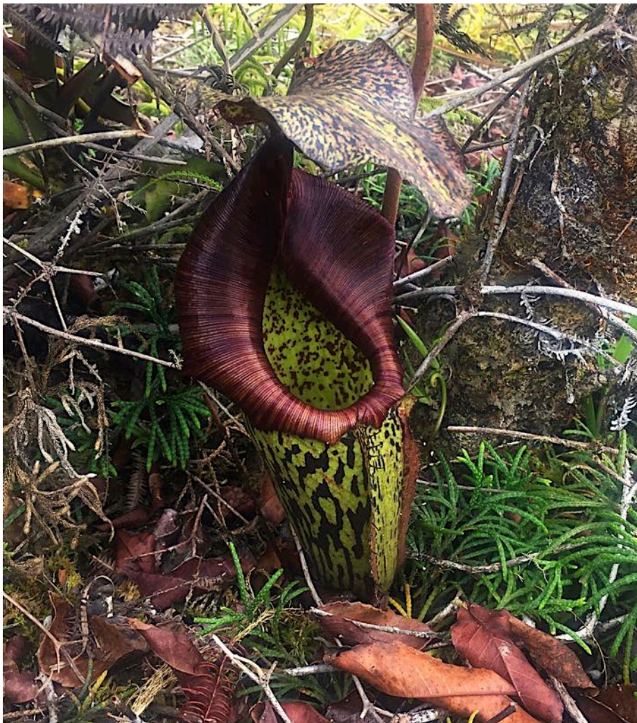
Fringed Pitcher Plant Nepenthes tentaculata (Craig Robson)

Tree Nymph Idea blanchardii Tangkoko NP at least.