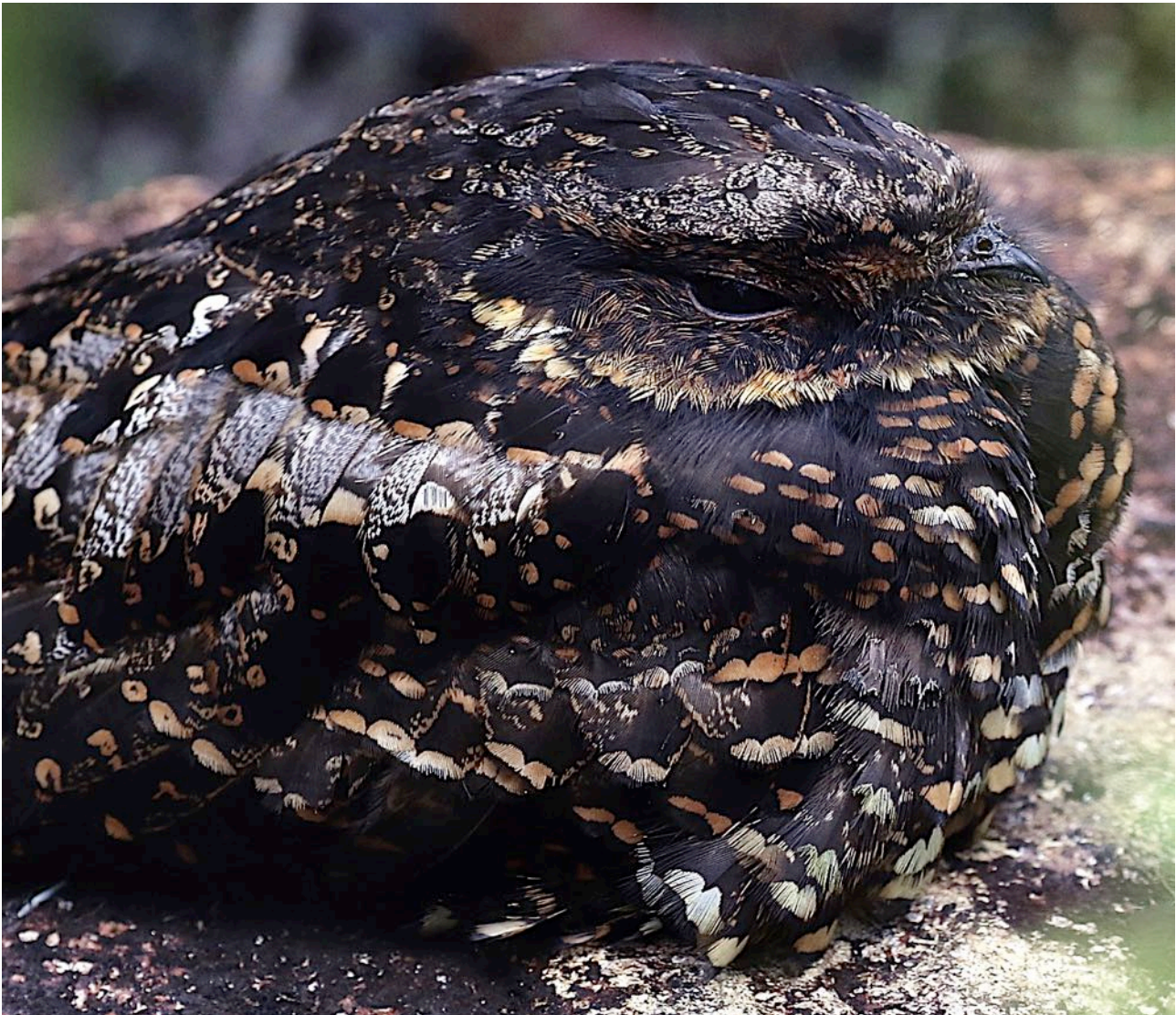
Roosting Satanic Nightjar

roosting Satanic Nightjar, gorgeous Purple-bearded Bee-eaters, noisy flocks of Golden-mantled Racket-tails, Dark-eared and White-eared Myzas, Pygmy Cuckooshrike, the sultry but attractive Maroon-backed Whistler, Rusty-bellied Fantail, a berry-gobbling Hylocitrea (now placed in a mono-generic family related to the waxwings), Sulawesi Leaf Warbler, Streak-headed White-eye, Sulawesi Thrush, and some fly-over Mountain Serins.