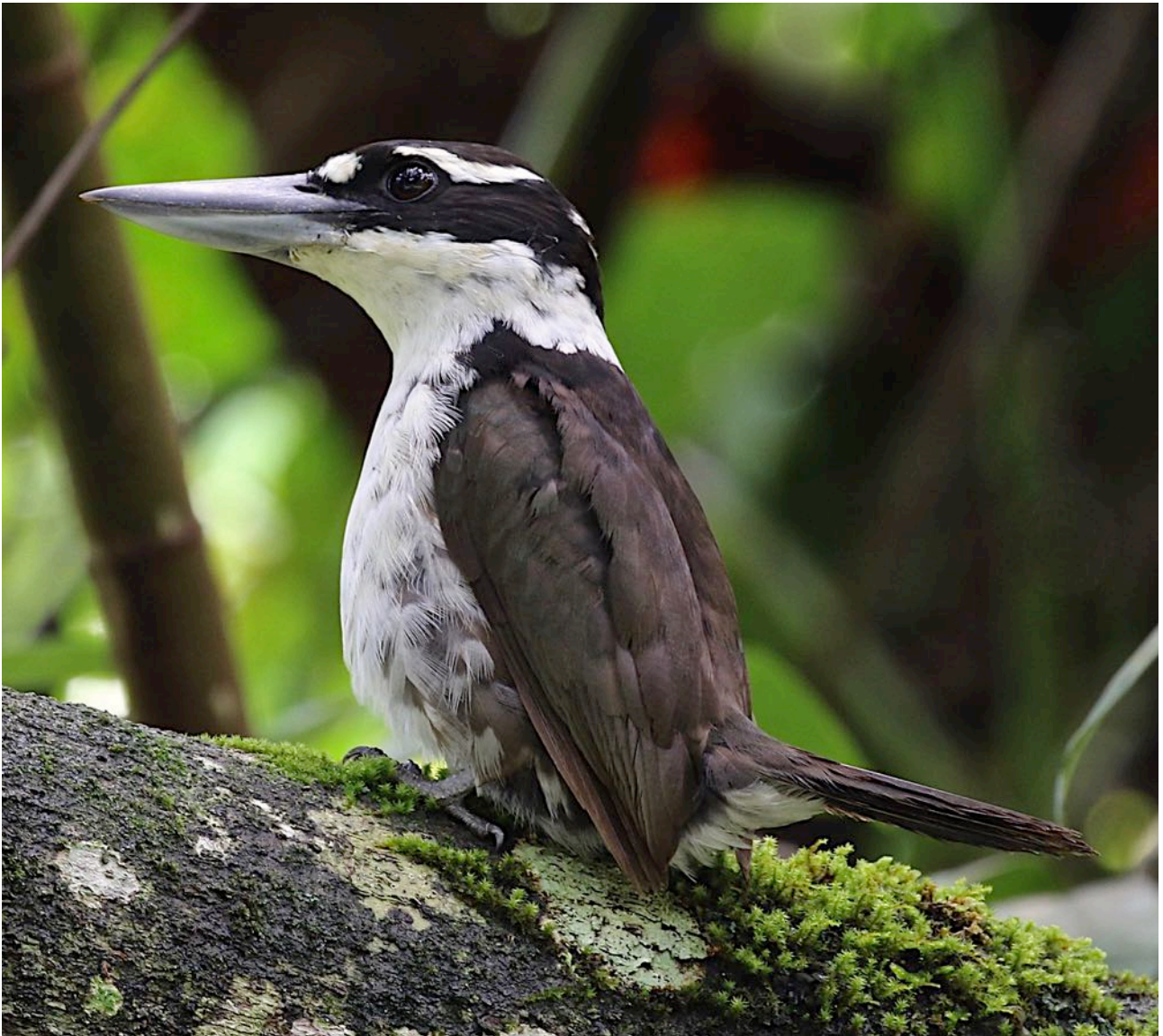
Sombre Kingfisher (Craig Robson)

Glossy Swiftlet Collocalia esculenta Nominate C,S Sulawesi, manadensis N Sulawesi, spilura Halmahera. Halmahera Swiftlet Aerodramus infuscatus (NL) Sulawesi Swiftlet Aerodramus sororum Locally common. Uniform Swiftlet A. vanikorensis Common: heinrichi S Sulawesi, aenigma C Sulawesi, waigeuensis Halmahera. White-throated Needletail Hirundapus caudacutus A single bird at Tangkoko was unexpected. Purple Needletail Hirundapus celebensis Just three birds in the Lore Lindu area. Asian Palm Swift Cypsiurus balasiensis House Swift Apus nipalensis Only seen around Makassar Airport. Purple-winged Roller Coracias temminckii Eventually seen very well at Tangkoko; two or three birds. Azure Dollarbird (Purple D) Eurystomus azureus (H) Heard once at Foli.