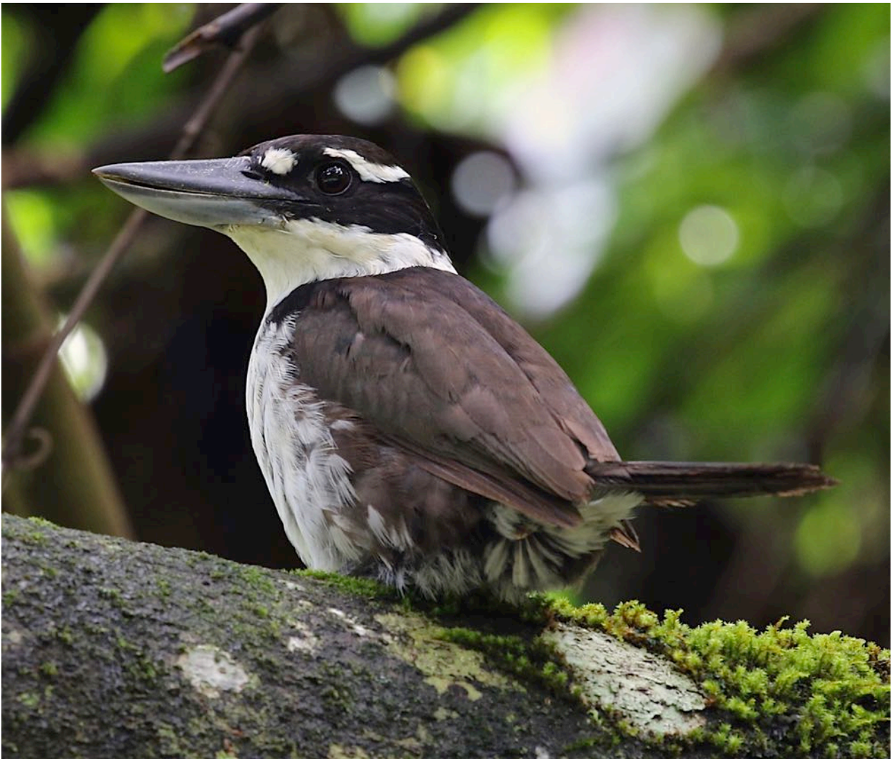
Sombre Kingfisher (Craig Robson)