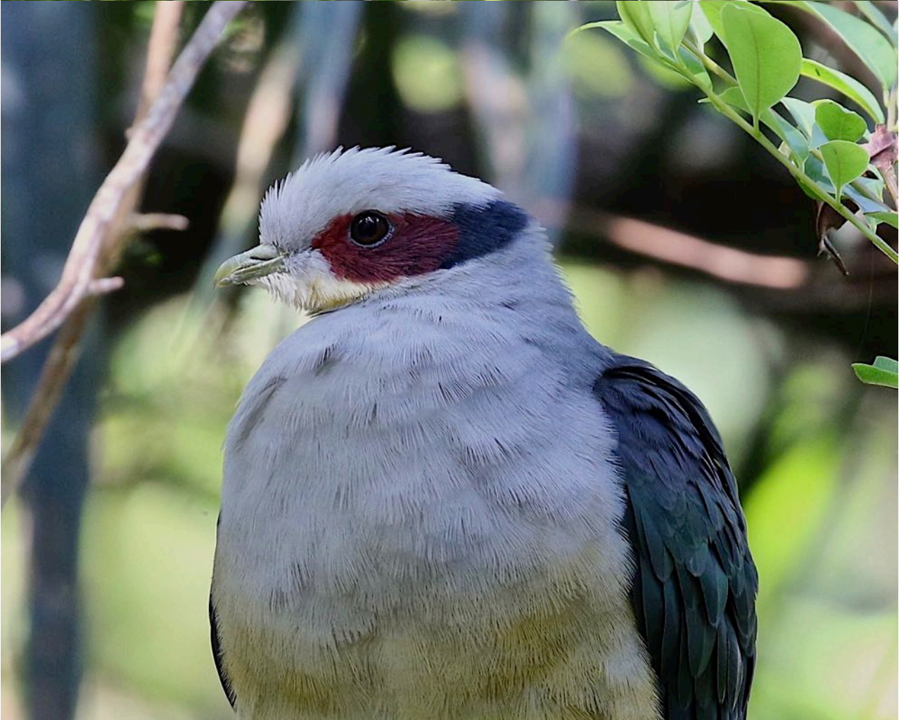
Clockwise from top left: Great Cuckoo-Dove, Scarlet-breasted Fruit Dove, and Red-eared Fruit Dove (Craig Robson)