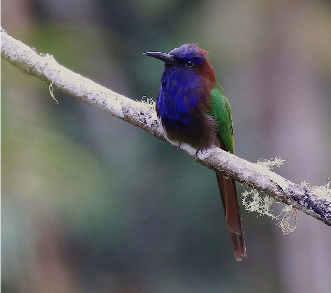
Purple-bearded Bee-eater

Purple-bearded Bee-eater Meropogon forsteni Several beauties Lore Lindu; Anaso Track and also along main road.