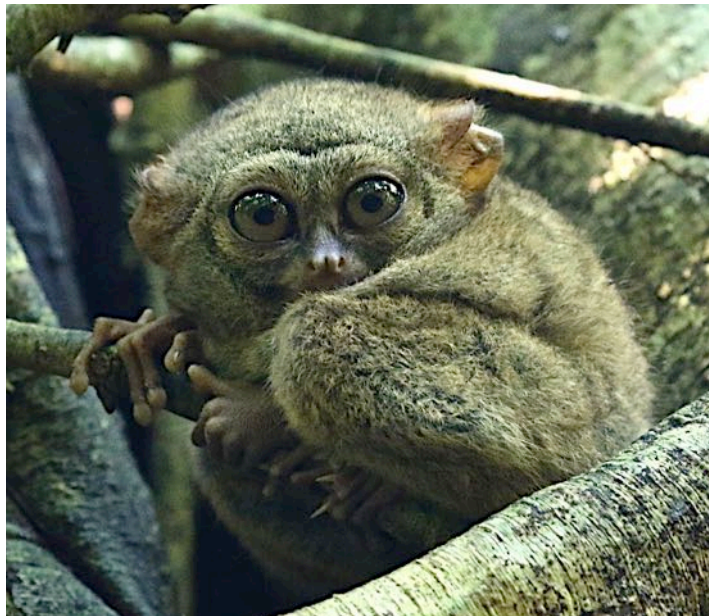
Spectral Tarsier (Craig Robson)

Spectral Tarsier Tarsius spectrum At least five seen at Tangkoko.