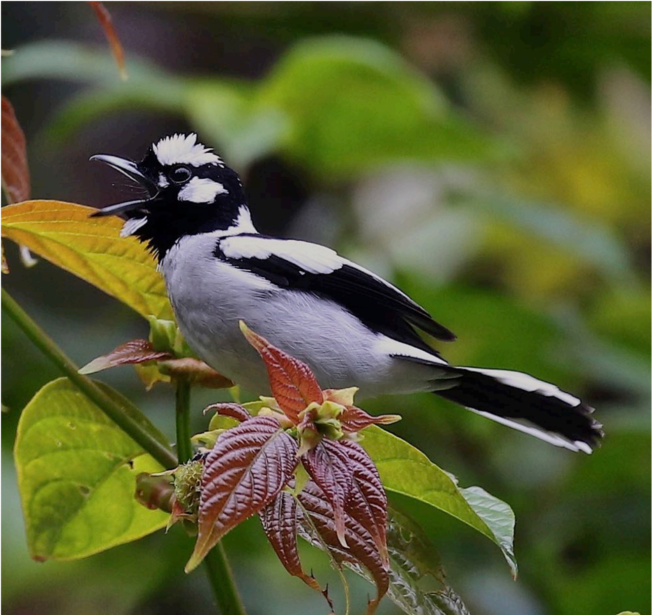
White-naped (or Halmahera Pied) Monarch (Craig Robson)

The next morning began pre-dawn, with much finer weather conditions. We had endemic nightbirds to look for. Fortunately, a Halmahera Boobook loafed in full view and then we had multiple close views of some amazing Moluccan Owlet Nightjars. There were further good additions during the early morning, with our first Dusky Megapodes, a pair of Chattering Lories, and Dusky-brown Oriole.