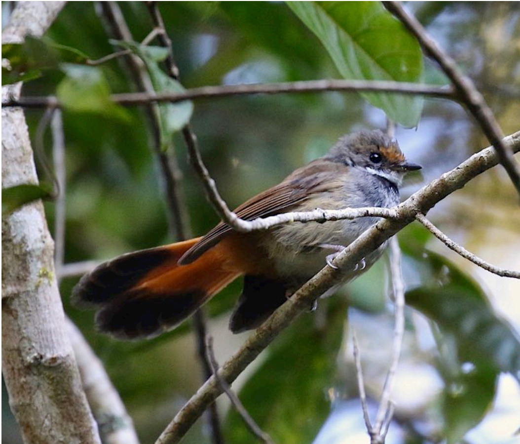
Rusty-bellied Fantail (Craig Robson)

Dusky-brown Oriole (Halmahera O) Oriolus phaeochromus A pair seen and a number heard on Halmahera. Black-naped Oriole (Sulawesi Golden O) Oriolus [chinensis] frontalis Common on Sulawesi ( celebensis ). Hair-crested Drongo (White-eyed Spangled D) Dicrurus [hottentottus] leucops Fairly common on Sulawesi. Sulawesi Drongo (S Spangled D) Dicrurus montanus Several encountered in the higher forests at Lore Lindu. Spangled Drongo (Halmahera S D) Dicrurus [bracteatus] atrocaeruleus Frequent on Halmahera ( atrocaeruleus ). Willie Wagtail (W Fantail) Rhipidura leucophrys Common away from forest Halmahera ( melaleuca ). Rusty-bellied Fantail (Sulawesi F) Rhipidura teysmanni Quite common at Lore Lindu ( toradja ).