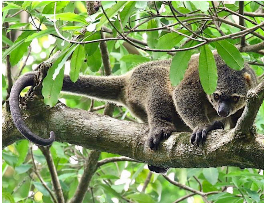
Bear Cuscus (Craig Robson)

Bear Cuscus Ailurops ursinus Two at Gunung Ambang, and another at Tangkoko NP.