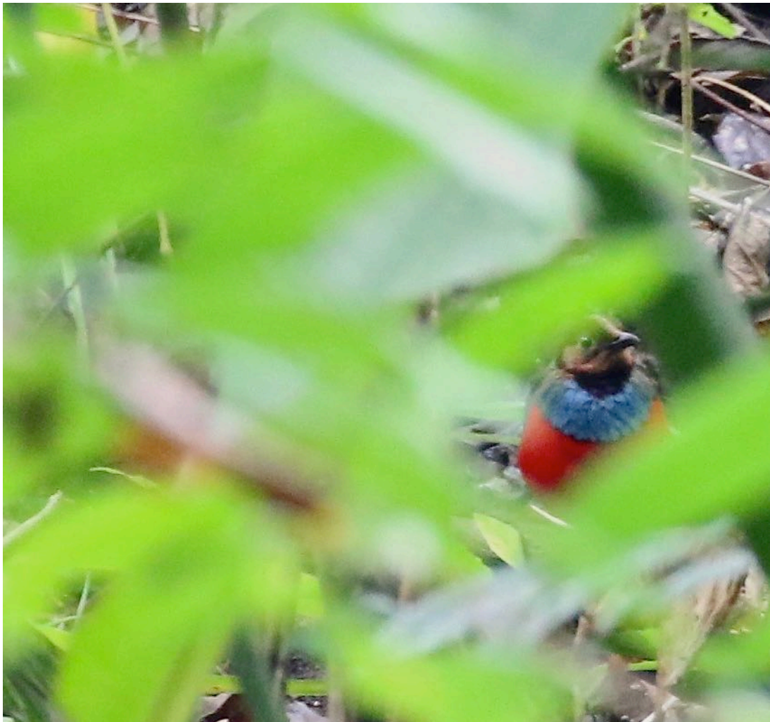
Sneaking-up on Sulawesi Pitta

Eclectus Parrot Eclectus roratus Quite common Halmahera ( vosmaeri ); ten seen. Red-cheeked Parrot Geoffroyus geoffroyi Quite common Halmahera ( cyanicollis ). Great-billed Parrot Tanygnathus megalorhynchos Frequent Halmahera (nominate). Blue-backed Parrot Tanygnathus sumatranus Four seen at Tangkoko (nominate). Red-flanked Lorikeet Charmosyna placensis Common on Halmahera ( intensior ), with over 100 logged. Chattering Lory Lorius garrulus Small numbers at Foli and Buli Road (nominate). Good perched views Violet-necked Lory Eos squamata Ten at Foli ( riciniata ). Ornate Lorikeet Trichoglossus ornatus Best seen at Tangkoko. Monotypic endemic Citrine Lorikeet (Meyer's L, Yellow-and-green L) T. flavoviridis Common Lake Tambing, Lore Lindu ( meyeri ). Great Hanging Parrot (Sulawesi H P, Large S H P) Loriculus stigmatus Common on Sulawesi (nominate). Moluccan Hanging Parrot Loriculus amabilis Occasional in Halmahera forests. Pygmy Hanging Parrot (Small Sulawesi H P) L. exilis Four seen at the viewpoint at Tangkoko. Monotypic endemic. Sulawesi Pitta (Sahul P, Sulawesi Sahul P) Erythropitta celebensis Just one; seen well at Tangkoko. See notes.