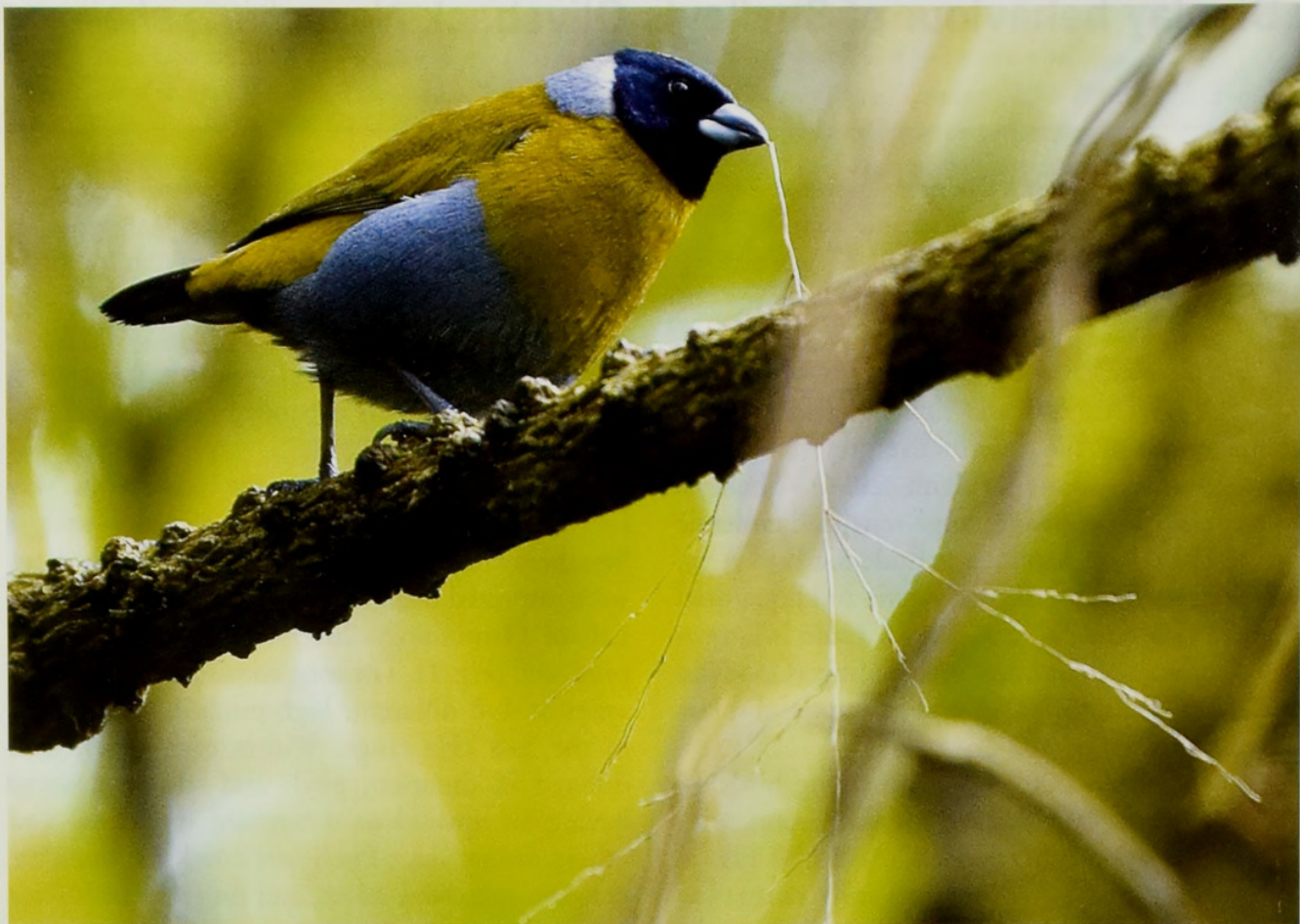
Figure 2. Displaying male Shelley's Oliveback Nesocharis shelleyi , holding a c.15 cm grass stalk in its bill, Mt Cameroon, Cameroon, March 2009 (Ian Merrill)

Dos-vert à tête noire Nesocharis shelleyi mâle en parade, tenant une tige d'environ 15 cm dans son bec, Mont Cameroun, Cameroun, mars 2009 (Ian Merrill)