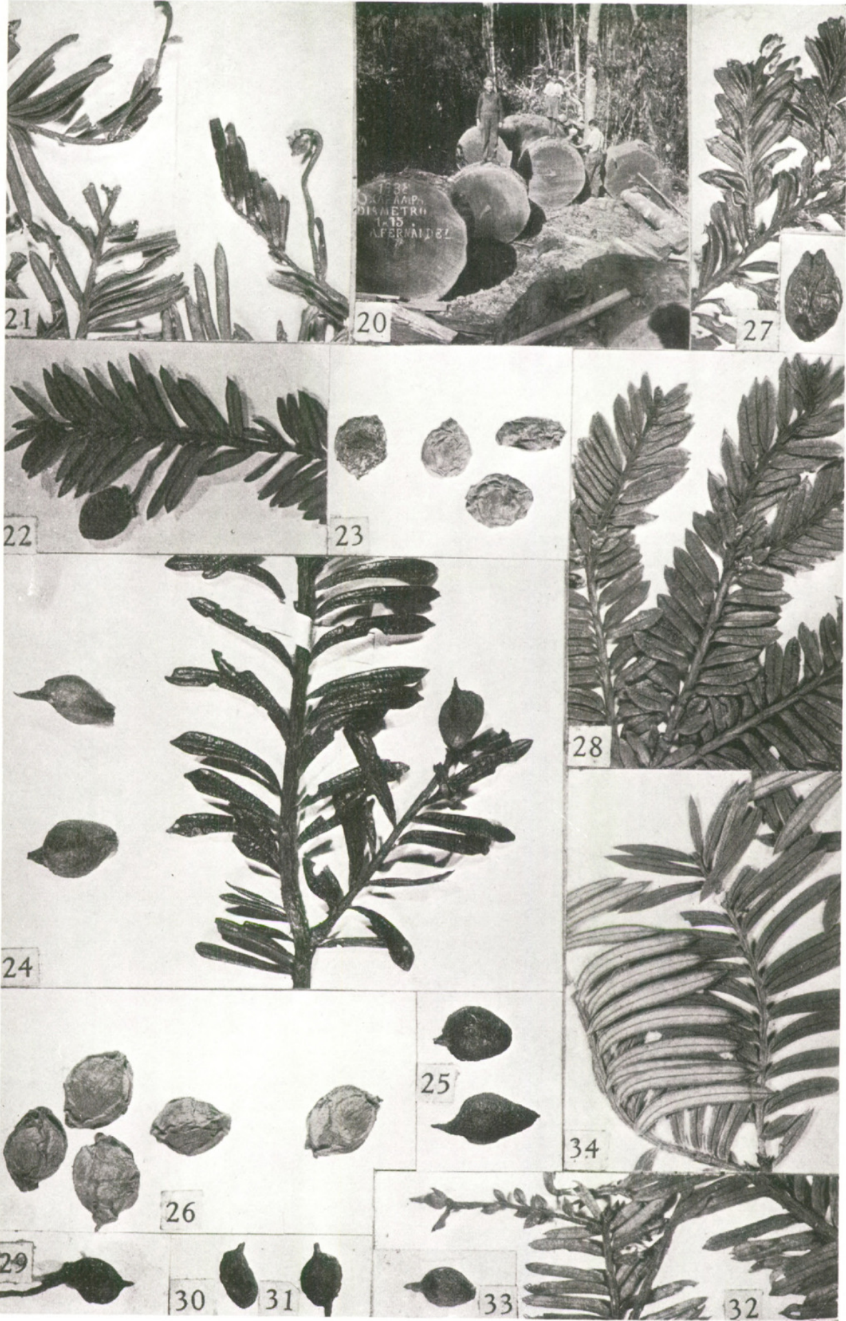
REVISION OF PODOCARPUS