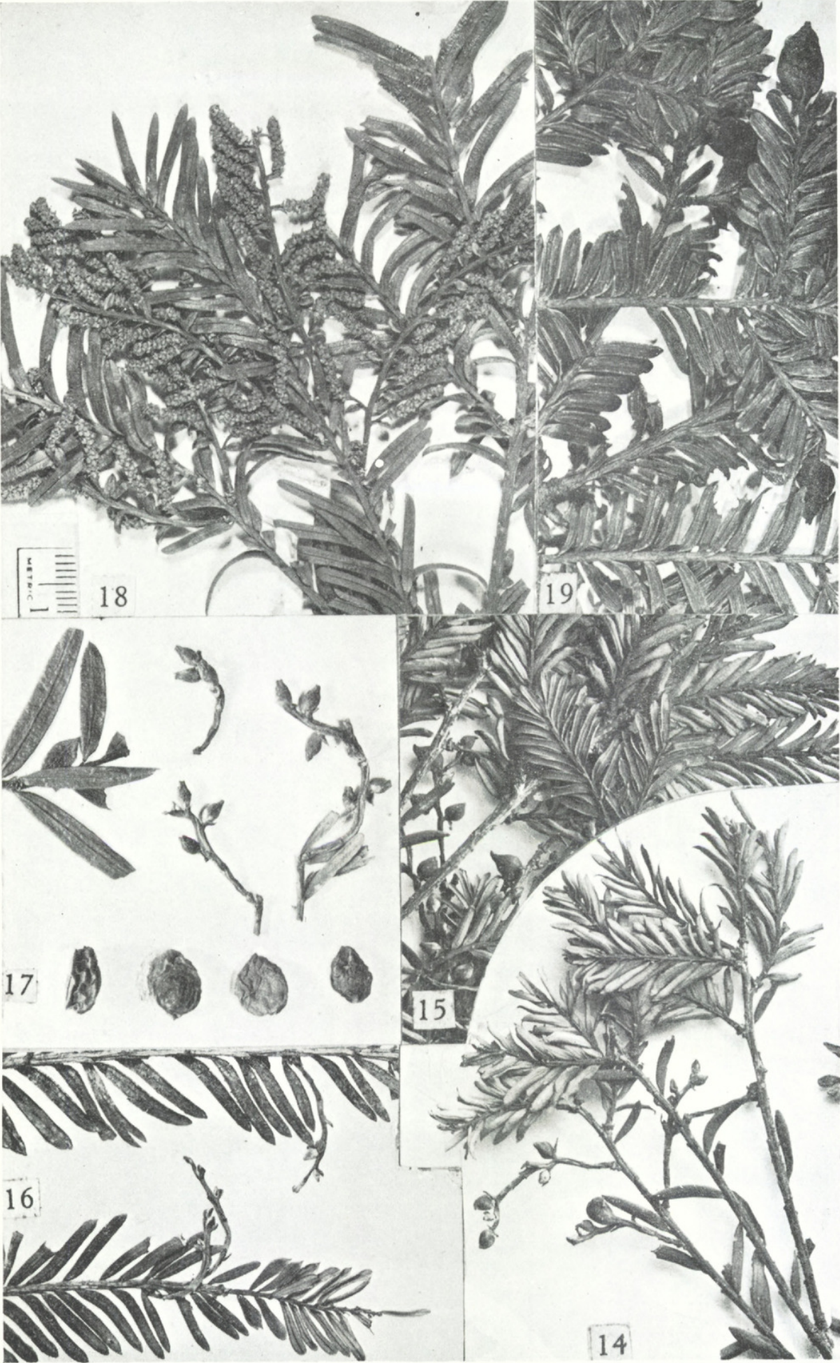
REVISION OF PODOCARPUS