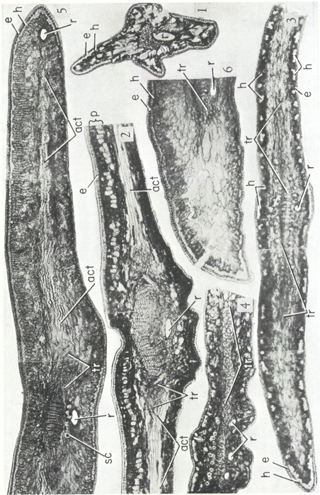
REVISION OF PODOCARPUS