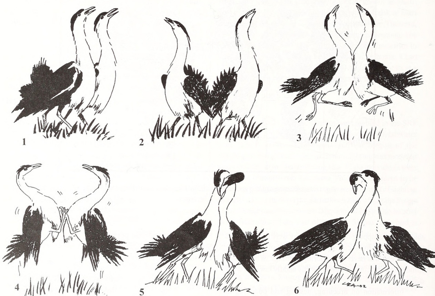
Figs 1-6: Sequence of territorial fighting behaviour of the Great Indian Bustard

on all the occasions except for the erecting of crown feathers. Rahmani (1989) also reported that the fighting posture is similar to the display posture. As soon as the intruder was seen, the owner approached it, either with a short flight (if the intruder was slightly away), or with a rapid walk. After this approach, both the males started marching parallel to each other with their tails half or fully cocked for about 5 to 25 m (Fig. 1), then