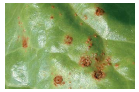
Photo 1. Beet rust ( Uromyces betae ).