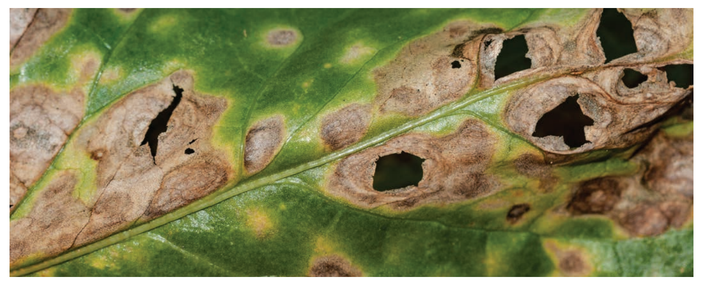
Photo 3. Ramularia (Lighter conidia showing in a ramularia infection).

Ramularia can sometimes be confused with cercospora leaf spot symptoms. However the key differences here are climatic in that temperatures of 17 and 20°C with lower humidity around 70% favouring the development of this beet leaf disease. Another significant key difference is that the conidia in cercospora are darker and in ramularia they are lighter in colour.