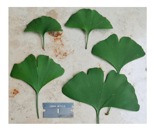
Fig. 3. Dark-green normal size ginkgo leaves in August 2022 from an old female tree at the KIT campus (tree 2). The largest leaf ( down right ) had only a leaf area of 46 cm<sup>2</sup>. (The razor blade shown serves as scale, it has a length of 2 cm.)