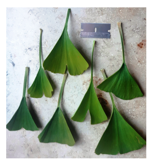
Fig. 4. Green normal-size sun leaves in August 2022 from a younger male ginkgo tree (tree 3). (The razor blade shown serves as scale, it has a length of 2 cm.)

for the few very large and some medium size leaves being formed in springtime at stem-buds, the dark-green, green, and light-green leaves of the pruned ginkgo tree 1 exhibited full expression of the bilobate leaf character with clear primary and also secondary lobes. Most leaves exhibited this multi-lobed leaf structure (Figs. 1, 2), which had been seen also in the years before pruning, yet then with smaller leaves. Ginkgo tree 2: The bilobate leaf structure was not seen for the majority of dark-green or green leaves (Fig. 3), whereas in the small light-green leaves, formed towards the outer end of twigs and longer shoots, the bilobate character was clearly manifested. Ginkgo tree 3: The bilobate character was seen in about one-third of the leaves, however only as a small indentation (Fig. 4). Thus, the expression of the bilobate morphology of leaves seems to vary widely among the investigated trees planted in parks and urban street alleys. After checking also other ginkgo trees in the Karlsruhe area, we can state that the strongly bilobate and even multi-lobed character seen in the pruned ginkgo tree 1, before and after pruning, appears to be a less common trait.