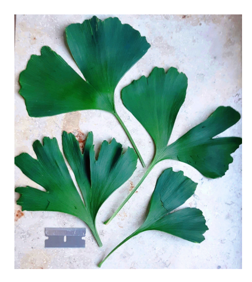
Fig. 2. Dark-green relatively large ginkgo leaves in summer 2022 being formed in the spring on the buds of one of the few left-over branches of the strongly pruned male ginkgo tree (tree 1). (The razor blade shown serves as scale, it has a length of 2 cm.)

Expression of the bilobate leaf structure : The three ginkgo trees showed distinct differences in the degree of their bilobate leaf structure. Pruned ginkgo tree 1: Except