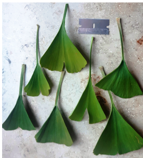
Fig. 4. Green normal-size sun leaves in August 2022 from a younger male ginkgo tree (tree 3). (The razor blade shown serves as scale, it has a length of 2 cm.)

for the few very large and some medium size leaves being formed in springtime at stem-buds, the dark-green, green, and light-green leaves of the pruned ginkgo tree 1 exhibited full expression of the bilobate leaf character with clear primary and also secondary lobes. Most leaves exhibited this multi-lobed leaf structure (Figs. 1, 2), which had been seen also in the years before pruning, yet then with smaller leaves. Ginkgo tree 2: The bilobate leaf structure was not seen for the majority of dark-green or green leaves (Fig. 3), whereas in the small light-green leaves, formed towards the outer end of twigs and longer shoots, the bilobate character was clearly manifested. Ginkgo tree 3: The bilobate character was seen in about one-third of the leaves, however only as a small indentation (Fig. 4). Thus, the expression of the bilobate morphology of leaves seems to vary widely among the investigated trees planted in parks and urban street alleys. After checking also other ginkgo trees in the Karlsruhe area, we can state that the strongly bilobate and even multi-lobed character seen in the pruned ginkgo tree 1, before and after pruning, appears to be a less common trait.