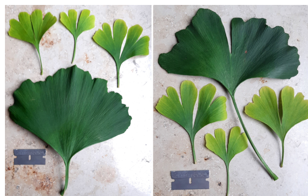
Fig. 1. Dark-green leaves of a male ginkgo tree (tree 1) in summer 2022 which had very strongly been recut and pruned in the fall of 2021. One very large dark-green leaf was formed as first in spring 2022 at each of the few buds on thin stems. These leaves had an unusual large leaf size of 128 \text{ cm}^2 (left) and 91 \text{ cm}^2 (right). The three smaller light-green leaves shown were formed in June at the end of newly formed branches (shoots) of the same tree. (The razor blade shown serves as a measure, it has a length of 2 cm.)

Leaf size: The dark-green, green, and light leaves of the pruned ginkgo tree 1 that had newly been formed in spring 2022 were on average 2.3 times larger (mean leaf size of 54.1 \text{ cm}^2 ) as compared to the years before pruning (mean leaf size of 23.5 \text{ cm}^2 ). These leaves of the pruned ginkgo were also 2.7 times larger than those of the two other ginkgo trees 2 and 3 analyzed here. This is also clearly seen by comparing the leaf images of pruned ginkgo tree 1 (Figs. 1, 2) with the normal-sized leaves of two other ginkgo trees (Figs. 3, 4). The mean leaf size of ginkgo trees 2 and 3 amounted to only 20.8 and 21.2 \text{ cm}^2 (Table 1). These differences were highly significant.