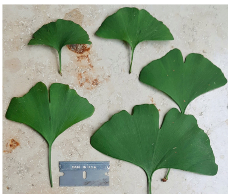
Fig. 3. Dark-green normal size ginkgo leaves in August 2022 from an old female tree at the KIT campus (tree 2). The largest leaf (down right) had only a leaf area of 46 cm 2 . (The razor blade shown serves as scale, it has a length of 2 cm.)