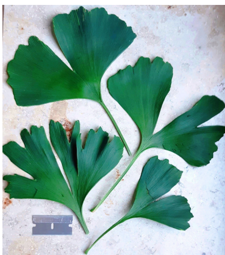
Fig. 2. Dark-green relatively large ginkgo leaves in summer 2022 being formed in the spring on the buds of one of the few left-over branches of the strongly pruned male ginkgo tree (tree 1). (The razor blade shown serves as scale, it has a length of 2 cm.)

Expression of the bilobate leaf structure: The three ginkgo trees showed distinct differences in the degree of their bilobate leaf structure. Pruned ginkgo tree 1: Except