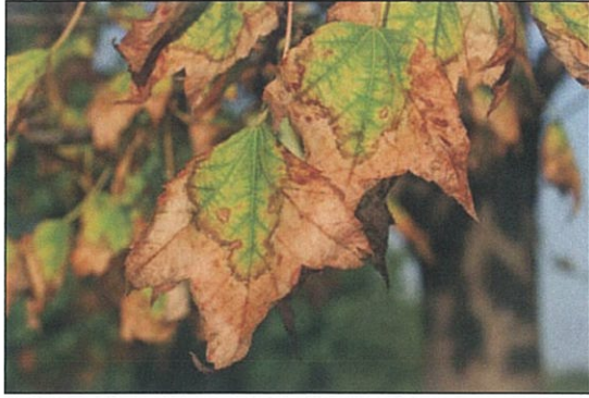
Figure 10. Physiological leaf scorch on maple is characterized by leaf-browning that starts along the edges of leaves, and moves inward.