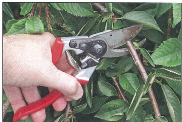
Figure 22. Hand pruners are useful for collecting samples.

It is important to take good notes of what you observe to later refresh your own memory and to accurately relay relevant information to others. Have a good field notebook, as well as weatherproof pens and markers. A hand-held recorder can also