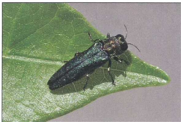
Figure 23. An emerald ash borer adult beetle.