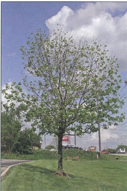
Figure 8. The thinning canopy of this ash tree indicates an overall decline in the health of the tree.