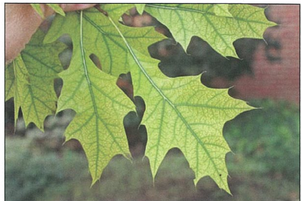
Figure 15. Iron chlorosis on pin oak may signal a high soil pH.