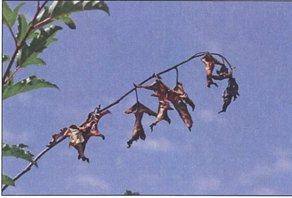
Figure 4. A characteristic “shepherd’s crook” on crapapple caused by bacterial fire blight.

Be aware that some plant pathogens and plant pests have alternate hosts, so two very different plant groups may be affected by the same problem in different ways. The fungus Gymnosporangium juniperi-virginianae produces large, reddish-brown plant galls that sprout fungal horns on the stems of junipers. On apple leaves, the fungus produces round, lipstick-red leaf spots. The common name for this disease reflects the two hosts: cedar-apple rust. The “cedar” refers to eastern redcedar ( Juniperus virginiana ) which is a juniper, not a true cedar as indicated with the contraction used in the common name. Once again, beware of common names!