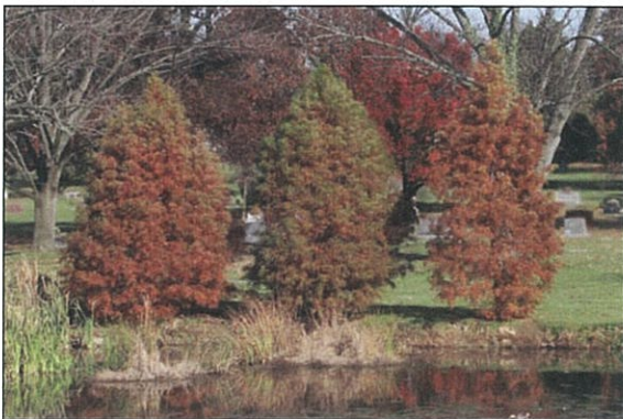
Figure 2. Baldcypress with fall color; it is a deciduous conifer.

Similarly, knowing that some yews, such as Taxus ‘Helen Corbit’, naturally have needles trimmed in bright yellow should give a horticulturist pause if someone wonders if the yellowing is due to photosynthetic-inhibitor herbicide injury. Knowing that leaves of Naruto Kaede trident maple ( Acer buergerianum ‘Naruto Kaede’) naturally curl-up along the edges will reduce the chances that the leaf curl will be diagnosed as being caused by moisture stress, herbicide injury, or aphids. Knowing that the needles of dragons-eye pine ( Pinus densiflora ‘Oculus Draconis’) naturally have yellow banding will help prevent a recommendation to treat for a needle-caste disease. Knowing that the greenish, strap-like bracts on lindens naturally turn brown after flowering is key to responding to a concern that the browning is associated with some type of fungal disease.