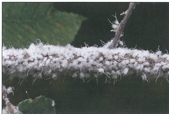
Figure 25. Beech blight aphids.

However, here you need to be a good communicator, to understand your clients and listen to their concerns. Just because a problem will not affect plant health, or in your opinion, affect aesthetics significantly, does not mean your client agrees. In some sense, plant problems are in the eye of the beholder. While powdery mildew of lilac may be irrelevant to plant health in one landscape, it may matter a great deal to a client who will simply take his or her business elsewhere if you do not do something