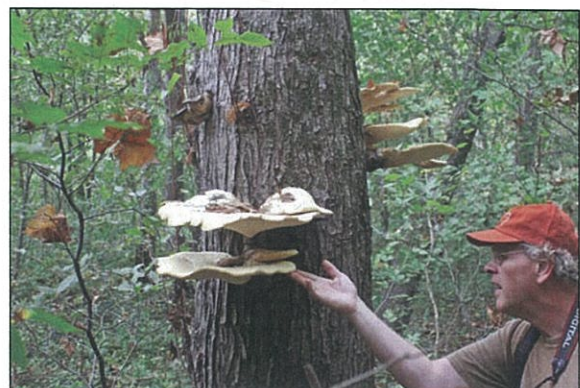
Figure 6. These bracket-like fruiting structure of the wood-decay fungus Polyporus squamosus is a disease “sign.”

It is important to clearly consider and list what signs and symptoms are present that make you believe there is a problem in the first place. For example, are there signs of insect or mite feeding? If so, is injury from pests with chewing or sucking