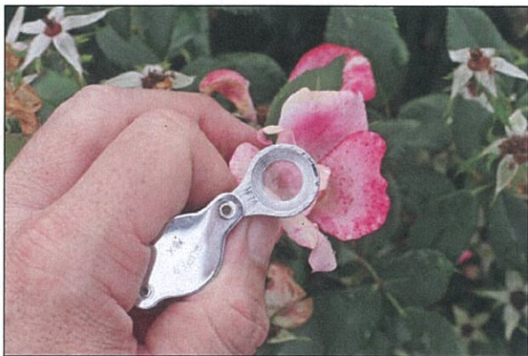
Figure 21. A hand lens provides useful magnification for field diagnostics.

Useful tools for diagnosis can obviously be high-tech, ranging from ever more elaborate microscopes and enzyme-linked immunosorbent assay tests for viruses and fungi in diagnostic labs to equipment from the gas company to check for gas leaks on properties where trees and turfgrass along a gas line are dying. However, for horticulturists making a field diagnosis, basic