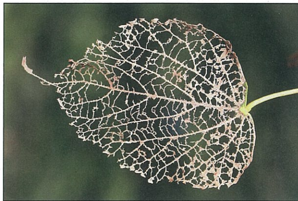
Figure 1. Characteristic "leaf skeletonizing" damage caused by Japanese beetles.

Plant problem diagnostics should follow a systematic approach to finding proper treatment, and the place to begin is to consider the questions that must be answered. You do not necessarily need to know the answers to all of the questions, nor do you have to ask them in order. Often, however, failure to accurately answer some of the early basic inquiries at the start is the reason for the faulty diagnosis.