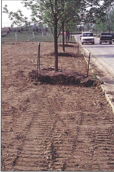
Figure 16. Soil compaction from construction equipment.

is planted. In cases where it's "wrong plant, wrong site," your recommendation may be to replace the plant. Good plant health management means starting with the right plant in the right place.