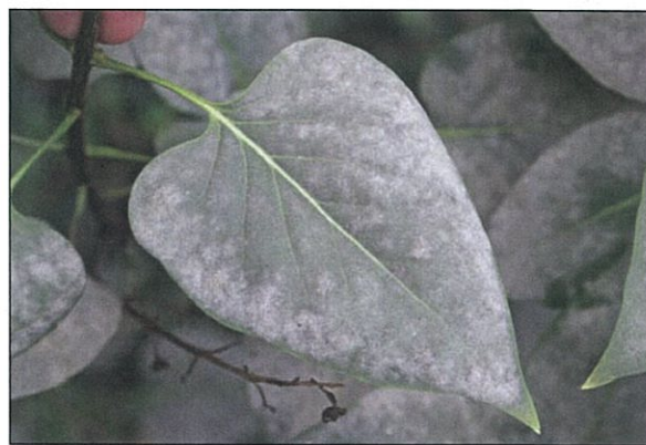
Figure 26. Powdery mildew of lilac.