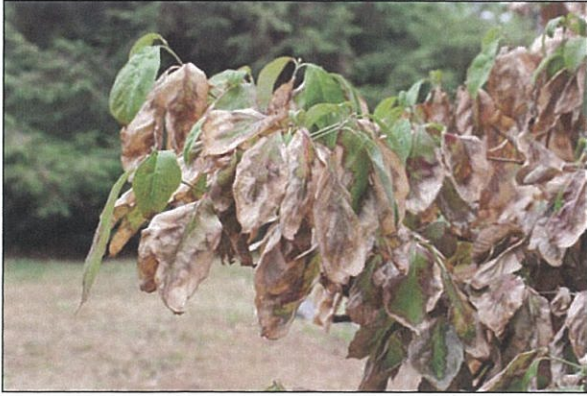
Figure 20. Leaf scorch on dogwood caused by a summer drought.

questions are not likely to yield useful information; they are more likely to yield an angry client.