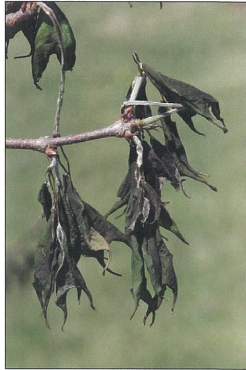
Figure 19. Late-spring freeze damage to trident maple.

Often clients think if a plant flowers normally or leafs-out normally, then all is well with regard to surviving winter dam-