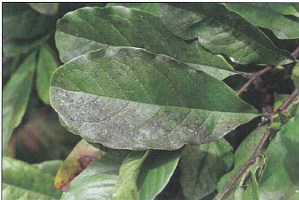
Figure 14. Black sooty mold on the surface of a magnolia leaf.

Always keep an eye on plant selection when assessing site conditions. It is very difficult to modify the site once a plant