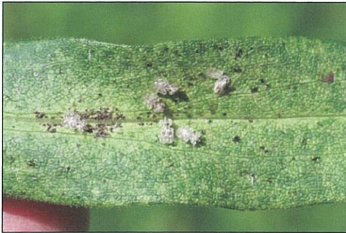
Figure 7. The “symptom complex” for lace bugs is illustrated by these chrysanthemum lace bugs.

Finally, when considering symptoms, keep in mind that there are often a series of symptoms, known as the “symptom complex,” which together helps fingerprint a particular problem. When questioning if lace bugs are a problem, check not only for flecking and yellowing of leaf tissue, but also for tarlike excrement deposits. When checking for Verticillium wilt on maple, check not only for leaf scorching and stem dieback but also for discolored streaking of the vascular tissue.