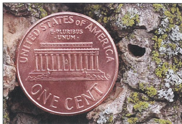
Figure 24. Emerald ash borer “D”-shaped adult emergence holes.

an open-and-shut case. With emerald ash borer, diagnosticians in 2001 simply did not know that the borer should be added to the list of possible problems that could occur on ash trees.