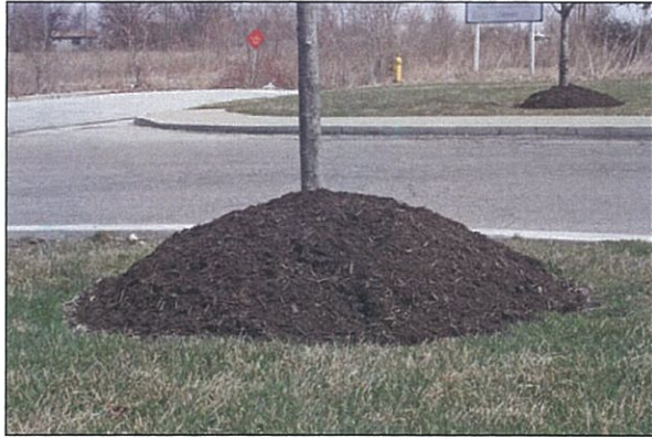
Figure 18. “Mulch mounds,” or “volcano mulching.”

ground and is planted 6 inches deeper than the root ball grade tells a great deal about the causes of decline. Apply the axiom: “plant them low, never grow; plant them high, watch them die; plant them right, sleep at night.”