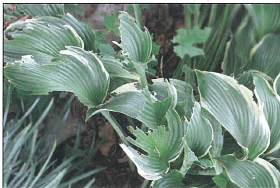
Figure 12. Deer feeding activity on hosta is often signaled by torn leaves that have tattered edges.

Diagnosing animal damage often depends on looking for details associated with how the animal feeds. Deer do not have upper front teeth. They have lower front teeth, and a tough pad instead of upper front teeth. When deer feed, they pinch-and-pull plant material between their lower teeth and the pad. This typically produces ragged edges rather than clean cuts on foliage, and tips of twigs may look like toothpicks because the outer bark has been pulled off. Rabbits have very sharp upper and lower front teeth and when a rabbit bites, their incisors cross at a 45 degree angle. So, they produce clean cuts that are angled at 45 degrees.