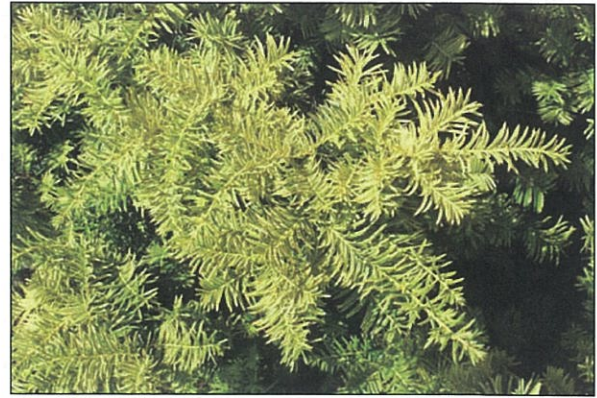
Figure 3. Taxus ‘Helen Corbit’ foliage is variegated with needles trimmed in yellow.

These examples do not prove there is nothing wrong with the plant. After all, the Taxus and trident maple may very well also have herbicide injury, and there may still be diseases on the pine and linden. Nevertheless, knowing what is normal for a particular plant provides a great early perspective in the diagnostic process.