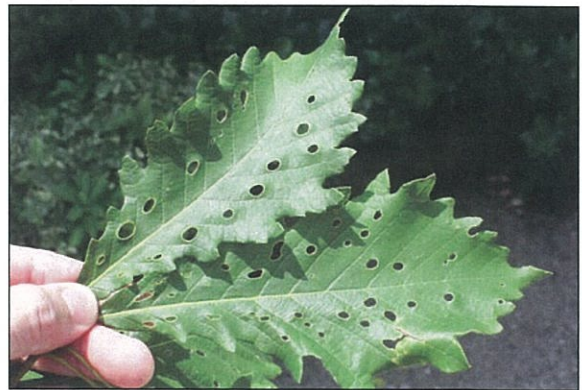
Figure 17. Damage from the oak shothole leafmining fly.

This inquiry involves a whole series of important questions, some of which can be answered only by others, some of which you can determine from evidence at hand. For example, what is the plant's transplant history? Looking at a declining 40-foot tree can be a puzzle that is pretty easily put together when you discover the tree was transplanted two years previously. On younger plants, transplant history is often quite evident. A declining rhododendron that has branches growing out of the