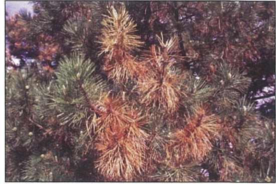
Figure 11. Diplodia ( Sphaeropsis ) tip blight of pine is characterized by browning and stunting of new shoots.

do you see that looks abnormal? The key to diagnosis is often in such details, sometimes related to others who help with the diagnosis, such as a diagnostic lab technician or coworker in your company.