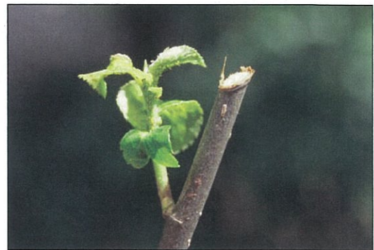
Figure 13. Rabbit feeding damage is characterized by cuts made at 45 degree angles.