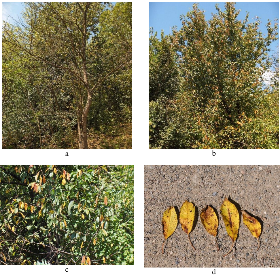
Figure 1. Aspects of Phloeosporrella padi attack on Cerasus avium trees (a, b, c) and leaves completely dried after pathogen attack

The existence of Phloeosporrella padi fungus inside the wild cherry populations from spontaneous flora draws attention to the protection strategy of the cherries in the orchards from this area. And this came from the necessity to start those protection strategy from the undoubted existence of a quantity of the inoculum that would pose the problem of applying a number of treatments every year (IMRE J. HOLB, 2013). The number of treatments from the disease control strategy depend mainly on the evolution of the existing pedoclimatic conditions (KRANZ J., ROTEN J., 1988).