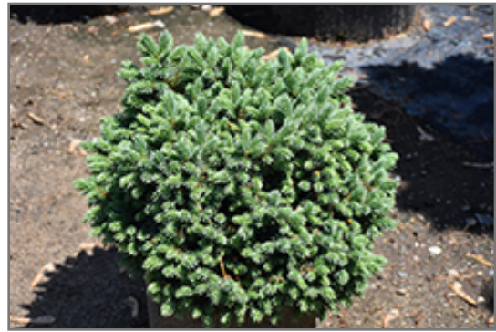
Jasper Engelmann Spruce