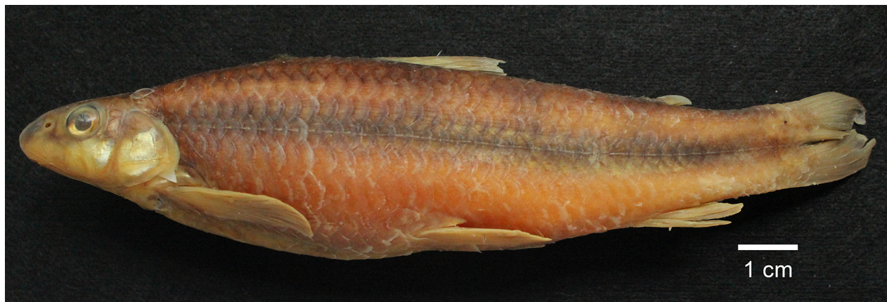
Figure 3. Specimen of Apareiodon piracicabae (LEP-UFRRJ 1565).

LEP-UFRRJ 0984, 11 specimens. Brazil, São Paulo, Paraíba do Sul River after PCH Lavrinhas, Lavrinhas (22°33'48" S 44°51'38" W), A. Iacone, 03/VII/2013, LEP-UFRRJ 0985, 1 specimen. Brazil, São Paulo, Paraíba do Sul River, Queluz (22°32'13" S, 044°46'26" W), B. F. Terra et al., 27/I/2013, LEP-UFRRJ 1081, 1 specimen. Brazil, São Paulo, São Roque Stream, Paraíba do Sul river basin (22°31'13" S, 044°40'26" W), B. F. Terra et al., 16/I/2013, LEP-UFRRJ 1082, 1 specimen. Brazil, Queluz, São Roque Stream, Paraíba do Sul river basin, Queluz (22°31'13" S, 044°40'26" W), B. F. Terra et al., 19/III/2013, LEP-UFRRJ 1211, 7 specimens. Brazil, Queluz, São Roque Stream, Paraíba do Sul river basin, Queluz (22°31'13" S, 044°40'26" W), B. F. Terra et al., 01/IV/2013, LEP-UFRRJ 1212, 2 specimens. Brazil, Queluz, São Roque Stream, Paraíba do Sul river basin, Queluz (22°31'13" S, 044°40'26" W), B. F. Terra et al., 01/IV/2013, LEP-UFRRJ 1213, 3 specimens. Brazil, Queluz, São Roque Stream, Paraíba do Sul river basin, Queluz (22°31'13" S, 044°40'26" W), B. C. T. Pinto, 17/X/2008, LEP-UFRRJ 1453, 1 specimen. Brazil, São Paulo, Entupido Stream, Queluz (22°33'45" S, 044°48'45" W), B. C. T. Pinto, 20/XI/2009, LEP-UFRRJ 1454, 11 specimens. Brazil, São Paulo, Entupido Stream, Queluz (22°33'45" S, 044°48'45" W), F. L. K. Salgado et al., 22/VIII/2009, LEP-UFRRJ 1467, 27 specimens. Brazil, Rio de Janeiro, Paraíba do Sul River, Barra