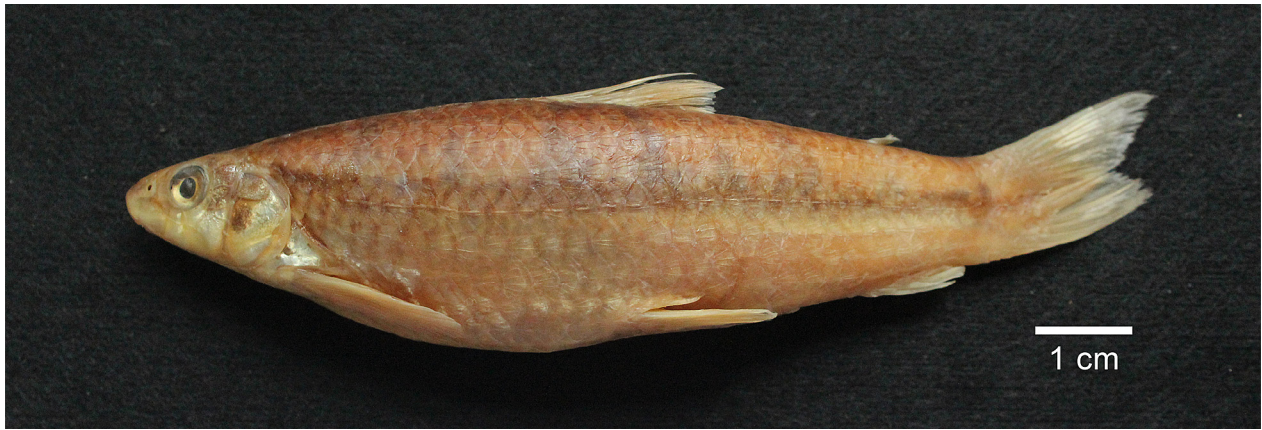
Figure 2. Specimen of Apareiodon itapicuruensis (LEP-UFRRJ 1455).