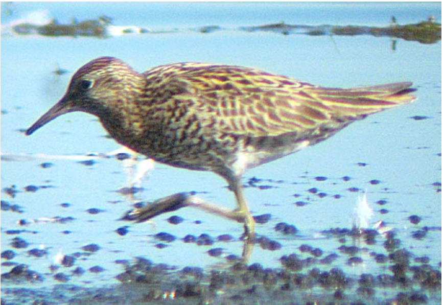
Above: Pink-footed Goose, Kissena Park, Flushing, Queens , 28 Dec 2008. Below: Sharp-tailed Sandpiper, Jamaica Bay, Queens , 4 Aug 2008. These Queens County sightings involve species native to Eurasia and both represent the third accepted NYS records.