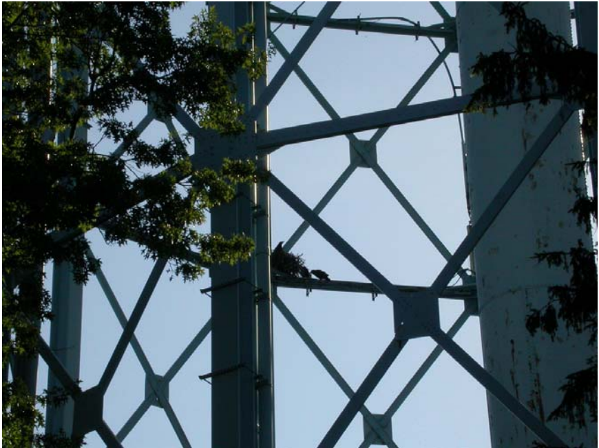
Common Raven nest site, Kew Gardens, Queens County, 31 May 2010