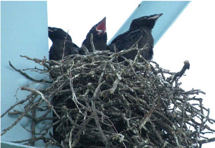
Common Raven nest, Kew Gardens, Queens : 16 May 2010 (top) & 21 May 2010 (bottom), both photos © Seth Ausubel; see pp. 216-219.