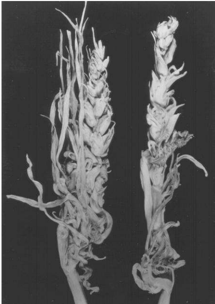
Figure 3. Wheat heads abnormally enlarged and deformed by downy mildew.

The most characteristic symptoms are the proliferation of florets and the development of distorted, twisted, and abnormally large panicles (Figures 1 and 2) or heads (Figure 3). When downy mildew infects wheat, the heads have a more open appearance than healthy heads, and the chaff may be fleshy and green. The beards of bearded wheats are distorted and abnormally long (Figure 3, left). Diseased heads yield no viable grain. The stems (culms) below the affected heads are often thick and deformed. A virus carried by the fungus may influence the expression of symptoms in host plants.