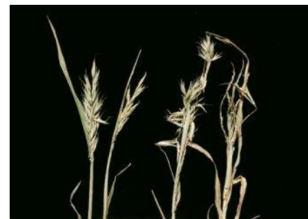
Figure 2. Oat plants variously distorted by downy mildew.