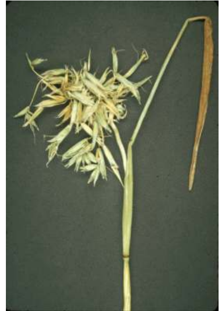
Figure 1. Oat panicle deformed by downy mildew.

Affected small-grain or grass plants often tiller excessively. Many of the tillers grow only a few inches before they wither, turn brown, and die. Such plants appear as dense, dead clumps. Diseased plants may appear somewhat stunted to severely dwarfed and deformed with short, thickened or warty leaves that need to be stiff and upright. The upper leaves also may be twisted and curled. Some leaves will have yellow stripes, or will turn almost completely yellow and fleshy. Such affected plants rarely head-out. Some may die prematurely; others may remain green a few days longer than healthy plants.