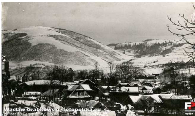
Fig. 5. Jarmuta Hill in 1967