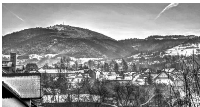
Fig. 6. Jarmuta Hill in 2017 (Photo by P. Chachuła, 2 January 2017)

The thickness of the sill is about 100m. It is built of fine-porphyrific amphibole andesite, which contains plates (up to a few mm long) of euhedral plagioclase and elongated phenocrysts