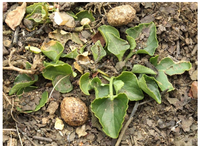
Heath Dog-violet Viola canina , Hartfordbridge Flats, 11 July 2015

Large areas have already been cleared of invasive conifers and the barer areas proved quite rich. I was delighted that Heath Violet Viola canina was in numerous places across the site, mostly in small numbers but at one spot there were in excess of a hundred plants.