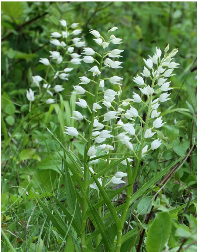
Narrow-leaved Helleborine Cephalanthera longifolia, East Hampshire Hangers, 23 May 2015