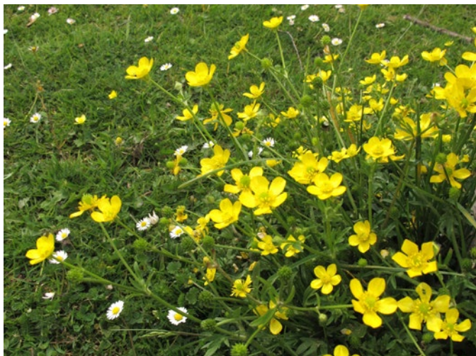
Hairy Buttercup Ranunculus sardous, Mill Lawn, Burley, 23 June 2015

* NA Ranunculus sardous (Hairy Buttercup): Tetrads: SU21G, SU51E, SZ29W (1979), SZ29Y.