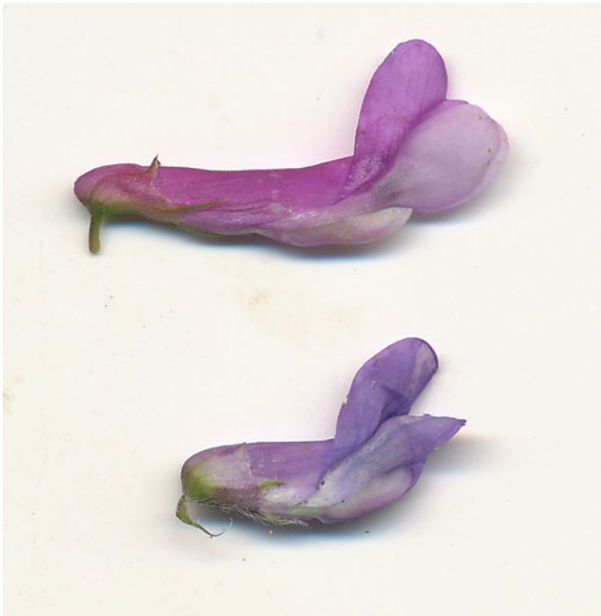
Fodder Vetch Vicia villosa (top) and Tufted Vetch V. cracca (bottom), Ashmansworth 14 July 2015