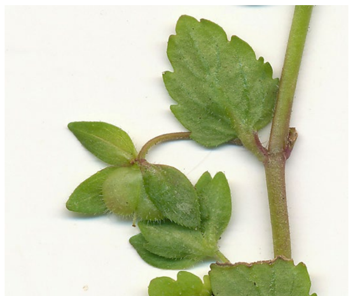
Green Field-speedwell Veronica agrestis , Rotherwick, 8 April 2015 (Tony Mundell)

X Elytrordeum langei ( Elytrigia repens x Hordeum secalinum ): Voucher specimen collected for expert confirmation. A patch with long rhizomes at Stratfield Saye 6815 6145 in hedgerow beside a footpath along an arable field edge, in full sun. Very tall, growing to 185cm with inflorescence to 22cm, 8mm awns on glumes and 10mm awns on lemmas, glaucous stems and leaves. E. repens grows within 100m and Hordeum secalinum is in a wet meadow c. 160m away, Tony Mundell & Anna Stewart 25 Jun 2015.