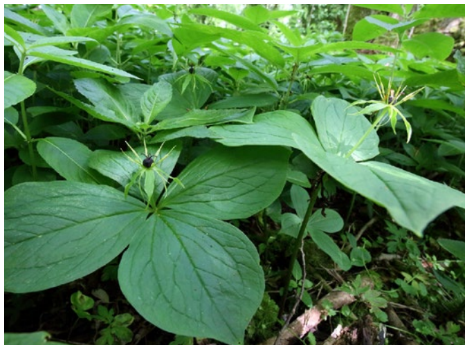
Herb-paris Paris quadrifolia, Oakshott Hanger, 23 May 2015