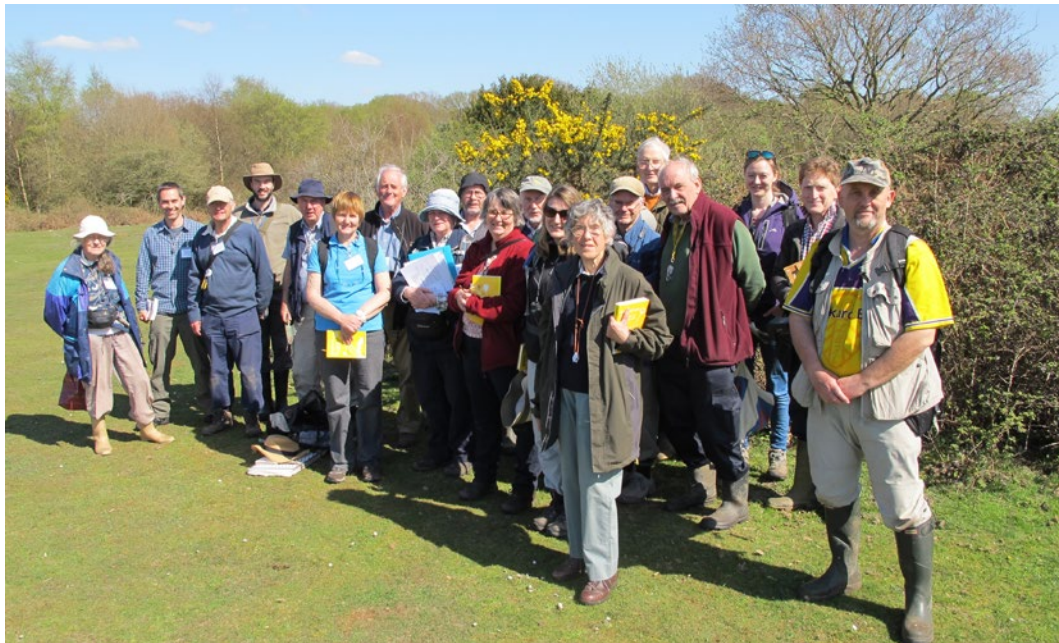
Taraxacologists at the joint Flora Group/BSBI workshop, April 2015 (see p.3)

Tel: 01252 614516, e-mail: VC12recorder@hantsplants.net