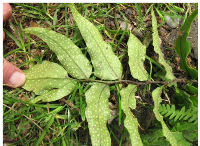
Japanese Holly-fern Cyrtomium fortunei, Pondtail Heath, 28 May 2015