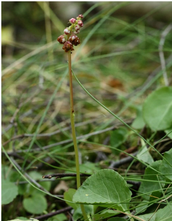
Common Wintergreen Pyrola minor, Hartfordbridge Flats, 11 July 2015

Towards the eastern end of the site there are still many Scots Pine Pinus sylvestris , with a sprinkling of Corsican Pine P. nigra subsp. laricio and a couple of Maritime Pines P. pinaster with huge cones. As we walked through the Scots Pines where the ground was dominated by mosses I said it looked like typical habitat for Common Wintergreen Pyrola minor – and within a minute we had found it!