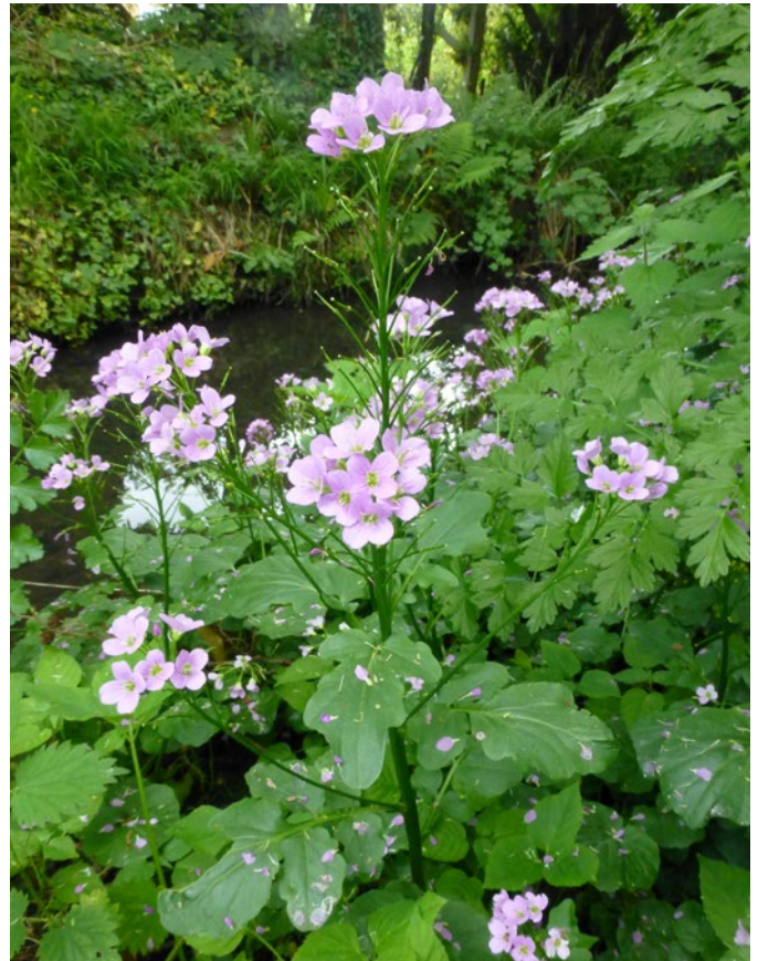
Greater Cuckooflower Cardamine raphanifolia, Brookly Stream, Fleet, 19 May 2015