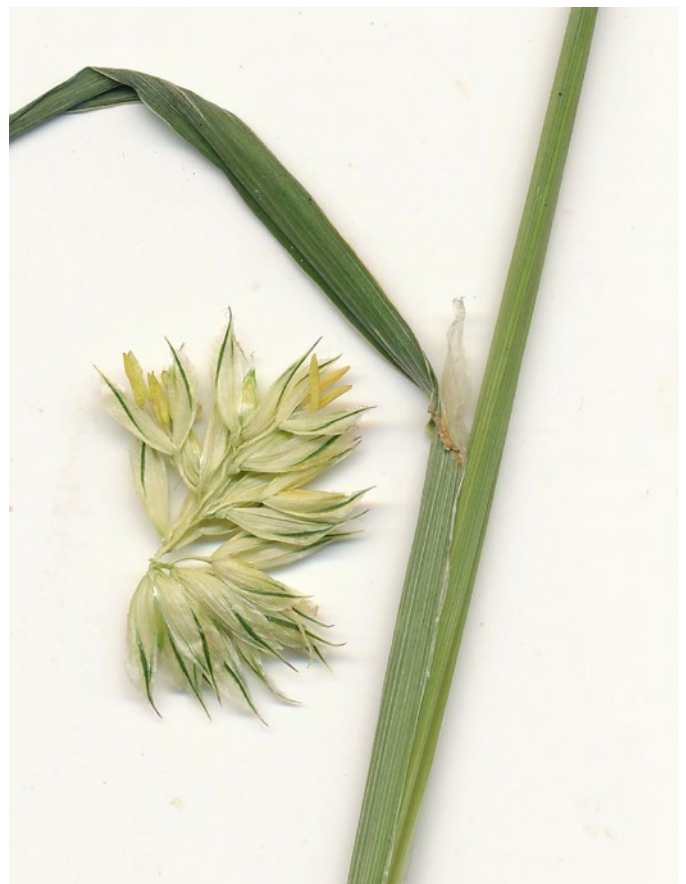
Lesser Canary-grass Phalaris minor specimen from Stratfield Saye, 25 June 2015

Of course most of the unusual finds are of alien species. These include Lesser Canary-grass Phalaris minor (third record for Hants), Perfoliate Alexanders Smyrniun perfoliatum (second record for Hants, the previous being in 1932), White Butterbur Petasites albus (second record for Hants, the previous being in 1945), St Dabeoc's Heath Daboecia cantabrica (third record for Hants), Greater Honeywort Cerinth major (fifth record for Hants) and Caucasian Comfrey Symphytum caucasicum (sixth record for Hants). Further details of these are given below.