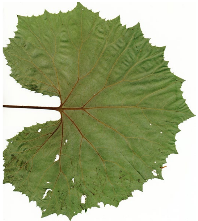
White Butterbur Petasites albus, alongside Hangers Way, The Candovers, Hartley Mauditt, 10 March 2015 and pressed leaf showing distinctive venation