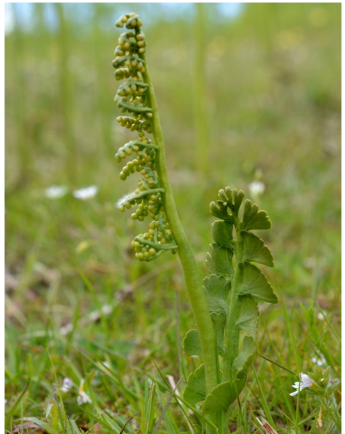
Moonwort Botrychium lunaria, Linwood, 9 June 2015