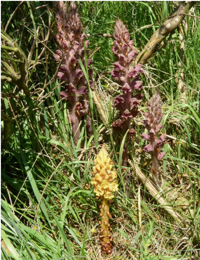
Yellow form of Greater Broomrape Orobanchae rapum-genistae , Ashford Hill Meadows, 11 June 2015 (Simon Melville)