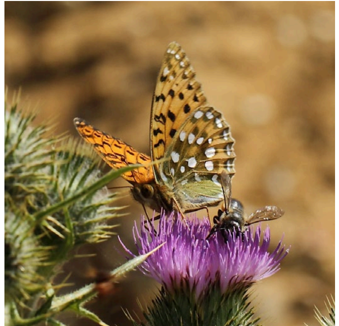
Dark-green Fritillary (on Spear Thistle Cirsium vulgare , Hartfordbridge Flats, 11 July 2015 (Gareth Knass)

and Gareth Knass) we managed to not only make a comprehensive list of the vascular plants present but we also listed 10 butterfly species (including several Dark Green Fritillaries), 13 birds, four grasshopper species, numerous mosses and some lichens. Apart from the mosses John also recorded 13 Rubus microspecies, one of which, R. marshallii , has a stronghold in Surrey/West Sussex, but is rare in VC12.