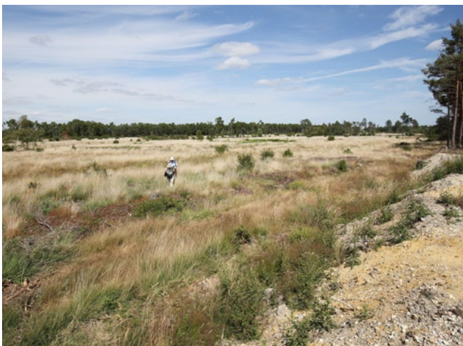
View across the western part of the site (Gareth Knass)

Hampshire & Isle of Wight Wildlife Trust have recently taken on the management of Hartfordbridge Flats for the private owner. The site is part of Castle Bottom to Yateley Common Site of Special Scientific Interest (SSSI). It is a strip of heathland immediately south of Blackbushe Airport and the A30 about 1.6km long and 180m wide. The Hampshire Flora Group had been requested to make a baseline botanical survey before grazing begins on the site, so the plan was to record all the plants we could find.