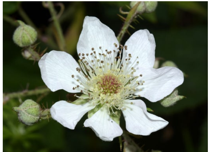
Rubus moylei flower (with 7 petals) (an abundant Hampshire species), Gosport, 20 June 2015