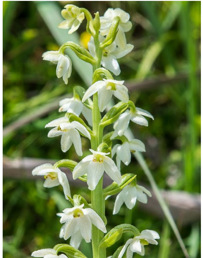
Peloric Lesser Butterfly-orchid Platanthera bifolia, nr. Wilverley, 23 June 2015

Among the pleasures of being a recorder are the invitations to visit 'unknown territory' - usually private land owned or managed by people who want to commit to doing the best thing for nature on their patch. First this season I had the opportunity to visit the peripheral