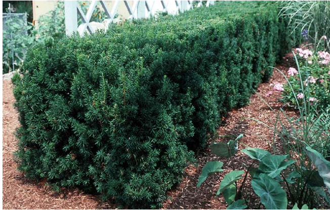
Hicks Yew ( T. x media 'Hicksii')