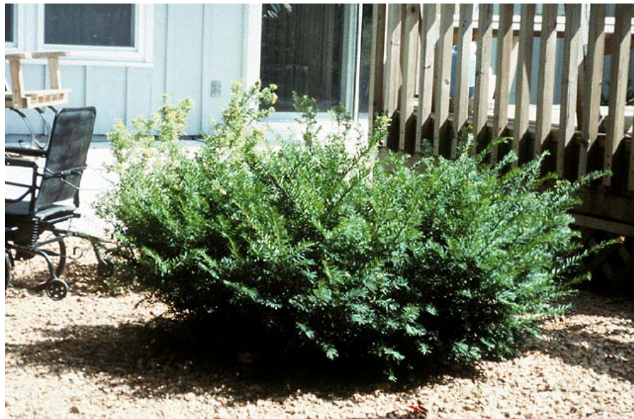
Dense Yew ( T. x media 'Densiformis')