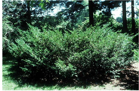
Taunton Yew ( T. x media 'Tauntonii')