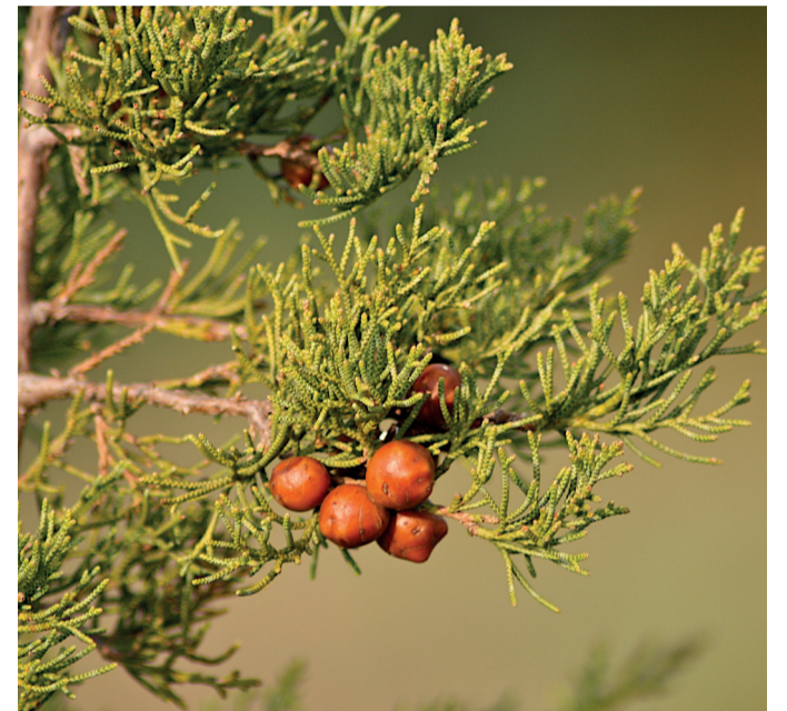
Reddish berry-like fruits (galbulus): these seed cones take 2 years to mature.

threatened in coastal zones by the new human settlements and tourism pressure especially during summer periods. The habitat loss and fragmentation over the last years has led to an undoubted decline and isolation of local populations 15, 18 . The cause is not only urban development, but also artificial plantations principally for coastal dune stabilisation, made with pines ( Pinus pinea , Pinus halepensis , etc.), or exotic species such as black locust ( Robinia pseudacacia ), French tamarisk ( Tamarix gallica ), or desert false indigo ( Amorpha fruticosa ) 18 . Furthermore, the spreading of recently introduced alien plant species, such as American agave ( Agave americana ), tree of heaven ( Ailanthus altissima ) from China, and the succulent plants of genus Carpobrotus from South Africa, are interfering with native sand dune and cliff vegetation communities dominated by this juniper 18, 28, 29 . Wild fires are another important threat for this species, since its adaptation and resistance to fire is very low, due to its high flammability caused by the presence of aromatic substances, and its poor post-fire