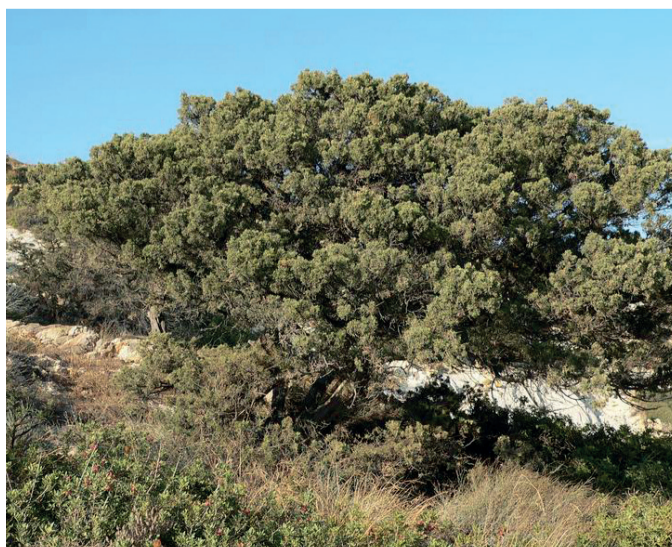
Large Phoenician juniper on limestone xeric soil in Milos (Aegean Islands, Greece)

There are no serious pathogens affecting this species 1 . However, the habitats of Phoenician juniper are constantly