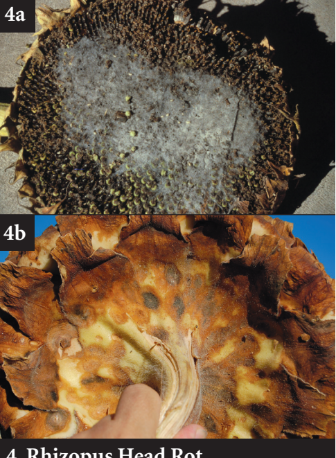
4. Rhizopus Head Rot