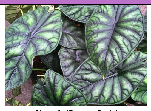
Alocasia 'Dragon Scale'