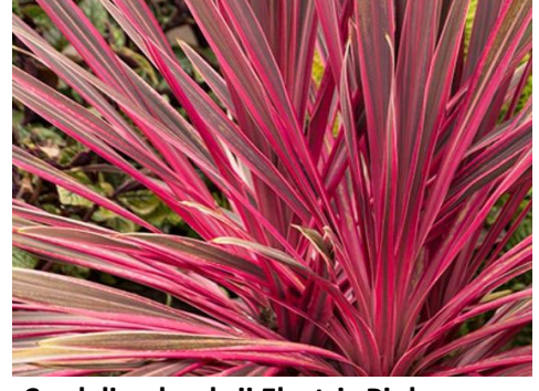
Cordyline banksii Electric Pink PP19213