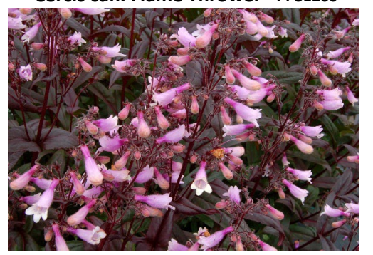
Penstemon 'Dark Towers'