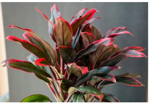
Cordyline fruticosa 'Red Compact'