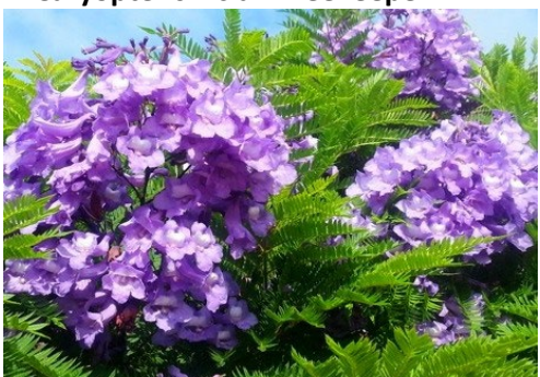
Jacaranda m. Bonsai Blue PP26574