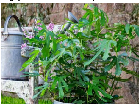
Ficus carica 'Little Miss Figgy' PP27929