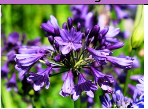
Agapanthus Ever Amethyst™ PP30163