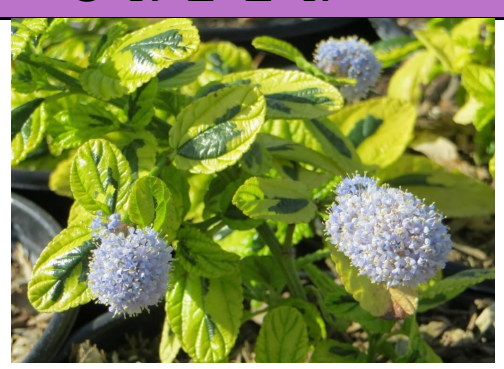
Ceanothus g. h. 'Diamond Heights'