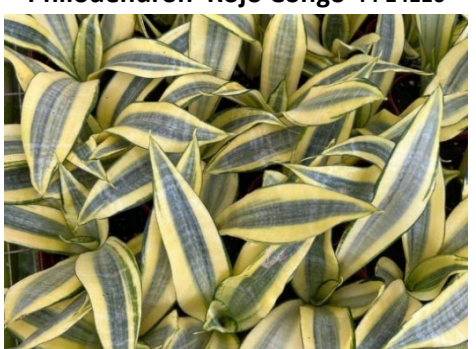
Sansevieria trifasciata 'Gold Dust'