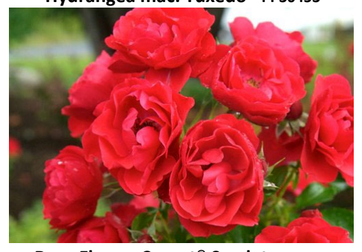
Rosa Flower Carpet® Scarlet PP17373