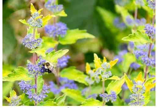
Caryopteris x clan. Beekeeper™ PPAF