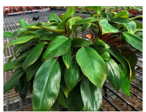
Philodendron 'Rojo Congo' PP14116

Alocasia 'Dragon Scale' Calathea 'Compact Star' Calathea insignis Calathea picturata Calathea roseopicta 'Medallion' Calathea roseopicta 'Surprise Star' Codiaeum variegatum 'Petra' Codiaeum variegatum 'Sunny Star' Cordyline fruticosa 'Red Compact' Dracaena 'Golden Heart' Dracaena reflexa 'Song of India' Dracaena reflexa 'Song of Jamaica' Ficus elastica 'Mini Burgundy' Ficus elastica 'Tineke' Ficus lyrata 'Little Sunshine' Hoya carnosa 'Krimson Queen' Hoya kerrii 'Snow Amore' PPAF Monstera deliciosa Philodendron 'Birkin' Philodendron 'Queen of China' PPAF Philodendron 'Ring of Fire' PPAF Philodendron 'Rojo Congo' PP14116 Sansevieria 'Superba Futura' Sansevieria trifasciata 'Black Gold' Sansevieria trifasciata 'Gold Dust' Sansevieria trifasciata 'Jade Pagoda' Sansevieria zevlanica Zamioculcas zamiifolia 'Zenzi'