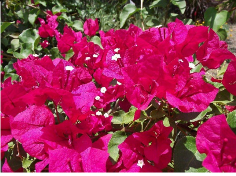
Bougainvillea 'Barbara Karst'