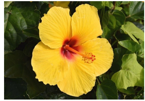
Hibiscus Tradewinds™ Sunny Wind PP17624