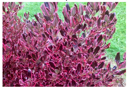
Coprosma Pacific™ Sunrise PP27648