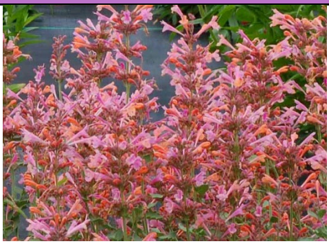
Agastache Kudos™ Ambrosia PP25614