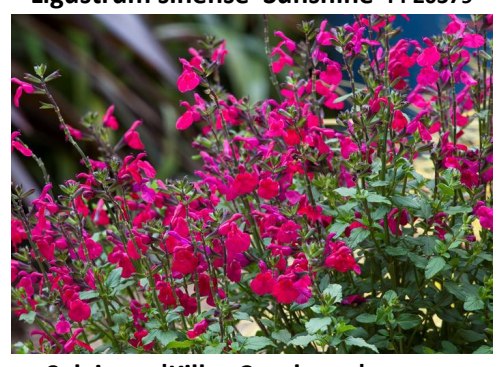
Salvia m. 'Killer Cranberry' PP26609