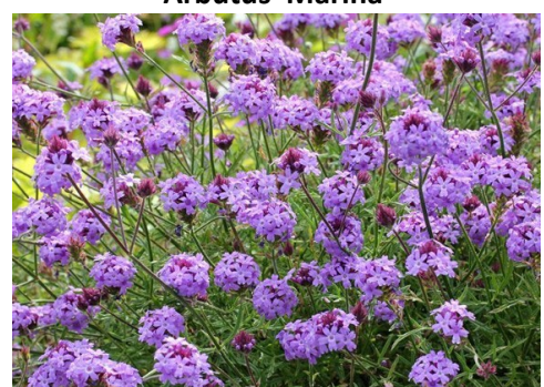
Verbena lilacina 'De la Mina'

"In natural settings, plants tend to form interdependent groups where each works with the others to make the most of limited sunlight, water and nutrients."