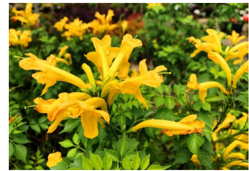
Tecomaria Cape Town™ Yellow PP31261