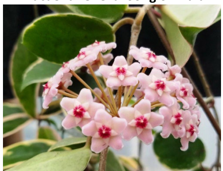
Hoya carnosa 'Krimson Queen'