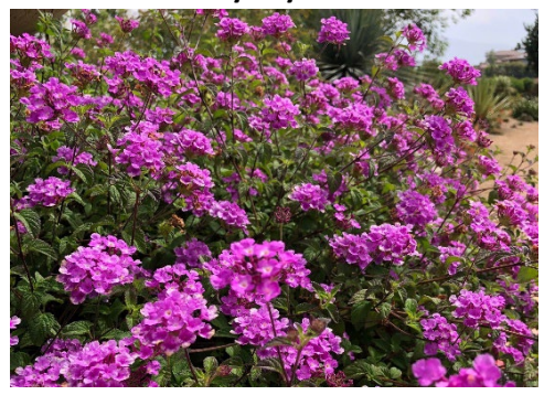
Lantana m. Super Purple™ PP32353