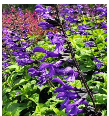
Salvia Bodacious® 'Rhythm & Blues' PP29585

Heuchera Northern Exposure® series Lavandula s. Javelin Forte™ series Lavandula Vintro Forte Blue Lavandula Vintro White Leucanthemum Western Star™ Leo Leucanthemum Western Star™ Libra Leucanthemum Western Star™ Taurus Penstemon Cha Cha™ Cherry PP28163 Penstemon Cha Cha™ Hot Pink PP26699 Penstemon Cha Cha™ Lavender PP26700 Penstemon Cha Cha™ Pink PP26673 Penstemon Cha Cha™ Purple PP26698 Penstemon 'Dark Towers' PP20013 Phygelius ColorBurst™ series Salvia Bodacious® 'Rhythm & Blues' PP29585