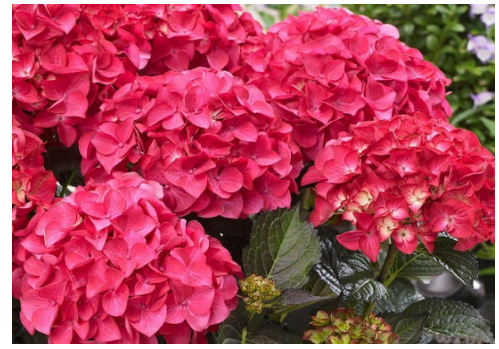
Hydrangea mac. Tuxedo® PP30453