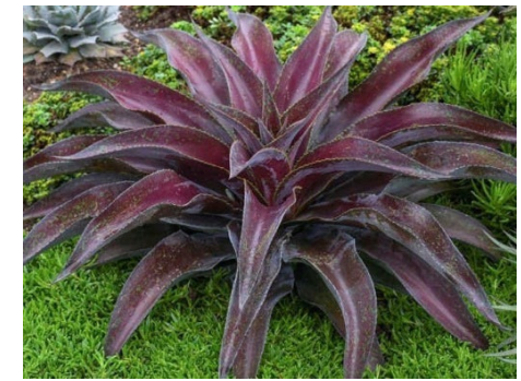
Mangave 'Mission to Mars' PP29393