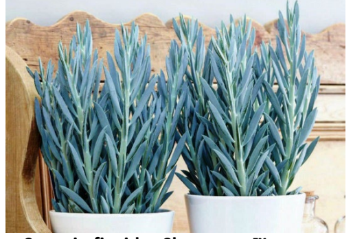
Senecio ficoides Skyscraper™ PP22188