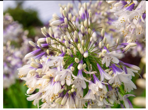
Agapanthus Ever Twilight™ PP30162

Achillea (varieties) Agapanthus africanus Summer Sky™ Agapanthus Ever™ series Agastache 'Blue Boa' PP24050 Agastache Kudos™ series Albizia julibrissin Ombrella™ Albizia julibrissin 'Summer Chocolate' Bignonia cap. 'Tangerine Beauty' Buddleia d. Butterfly Candy™ series Buddleia d. Butterfly Towers™ Magenta Buddleia d. Buzz™ Hot Raspberry Buddleia d. High Five™ Purple PP30285 Buddleia hybrid Ultra Violet™ Callistemon Bottle Pop™ Neon Pink Callistemon v. Light Show® PP27547 Callistemon viminalis Slim™ PP24444 Campsis 'Golden Treasure' Campsis Indian Summer® PP13139 Campsis Summer Jazz® Fire PP23917 Caryopteris incana Pavilion™ series Caryopteris x clan. Beekeeper™ PPAF Cercis can. Flame Thrower® PP31260 Cuphea Hummingbird's Lunch PP24538 Distictis buccinatoria Gaura lind. Belleza® Light Pink Grevillea 'Eternal Blaze' PP34216 Grevillea 'Eternal Pink Glory' PP34215 Grevillea 'Eternal Sunshine' PPAF Grevillea 'Spirit of ANZAC' PP29372 Jacaranda m. Bonsai Blue PP26574 Lantana s. Super Purple™ PP32353 Lavandula s. Javelin Forte™ series Leonotus leonurus Lonicera x heckrottii 'Goldflame' Pandorea jasm. 'Rosea' Penstemon Cha Cha™ series Penstemon 'Dark Towers' PP20013 Pimelea ferruginea 'Magenta Mist' Salvia Bodacious® 'Rhythm & Blues' PP Salvia cleve. 'Winifred Gilman' Salvia greggii Salvia 'Wendy's Wish' Tecomaria Cape Town™ series Tecomaria capensis Riot Red™ Verbena 'Homestead Purple' Verbena lilacina 'De La Mina' Vitex x Chicagoland Blues™ PPAF Vitex x Summertime Blues™ PPAF