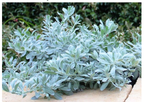
Eremophila glabra 'Grey Horizon' PP29275