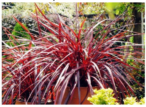
Cordyline Festival™ Burgundy PP14224