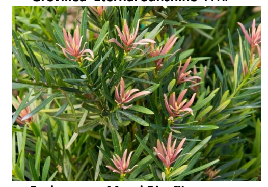
Podocarpus Mood Ring™ PP28583