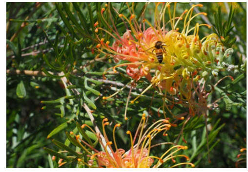
Grevillea 'Eternal Sunshine' PPAF