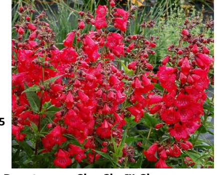
Penstemon Cha Cha™ Cherry PP28163