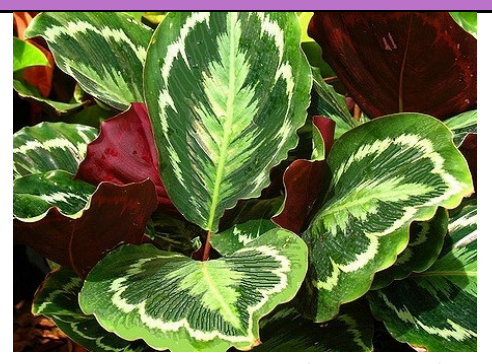
Calathea roseopicta 'Medallion'