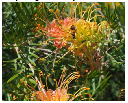
Grevillea 'Eternal Sunshine' PPAF