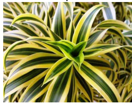
Dracaena reflexa 'Song of India'