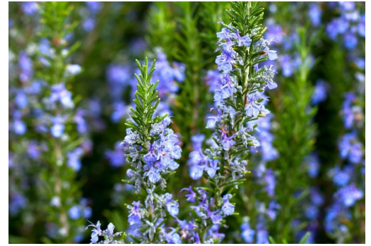
Rosmarinus off. 'Tuscan Blue'