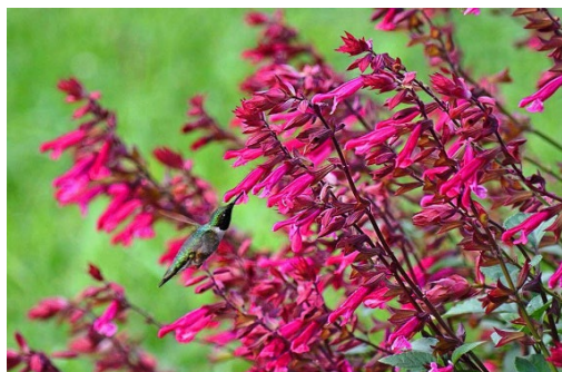
Salvia 'Wendy's Wish'