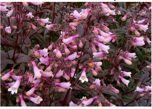
Penstemon 'Dark Towers' PP20013