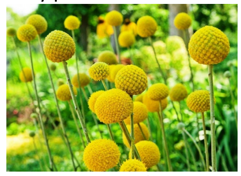
Craspedia globosa Golf™ Beauty PPAF