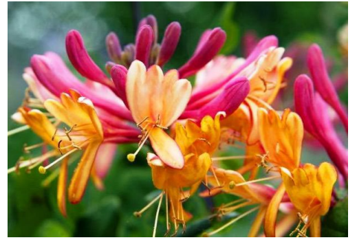
Lonicera x heckrottii 'Goldflame'