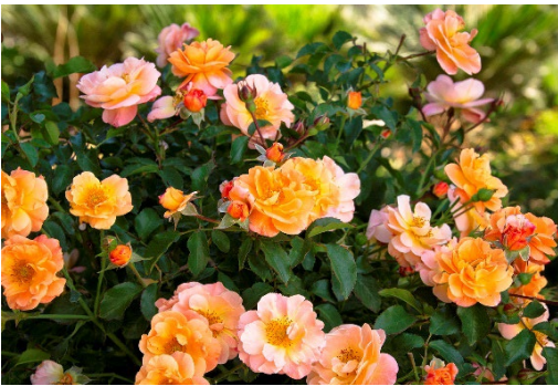
Rosa Flower Carpet® Amber PP17098