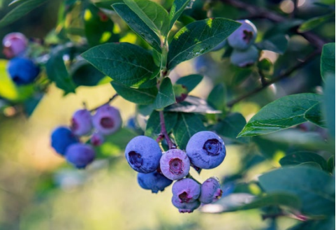
Vaccinium corymbosum 'Jubilee'