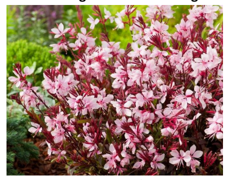
Gaura lind. Belleza® Light Pink