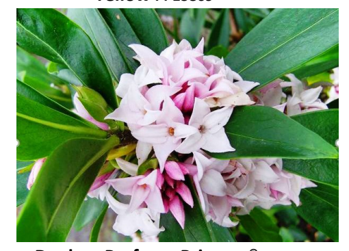
Daphne Perfume Princess® PP27662

Amber PP17098 Apple Blossom PP10293 Coral PP14441 Mini Cherry PPAF Pink Supreme PP19206 Red PP11308 Scarlet PP17373 White Yellow PP13869