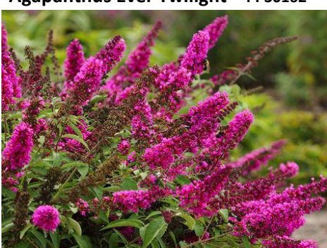
Buddleia d. Buzz™ Hot Raspberry