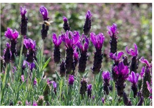
Lavandula s. Javelin Forte™ Deep Purple