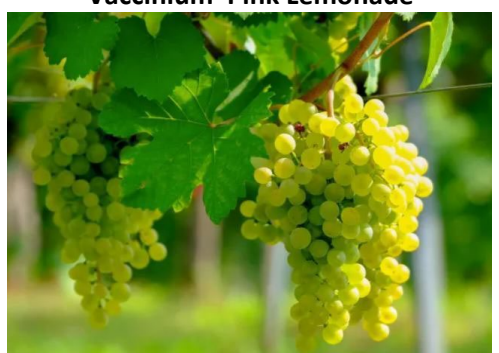
Vitis labrusca 'Interlaken'