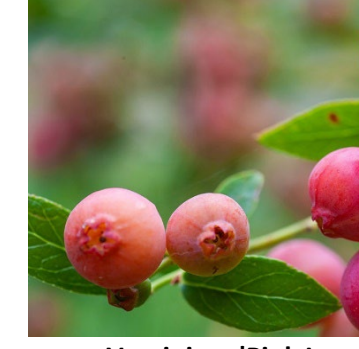
Vaccinium 'Pink Lemonade'