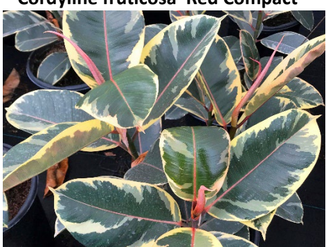
Ficus elastica 'Tineke'