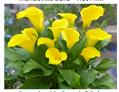
Zantedeschia Captain® Solo