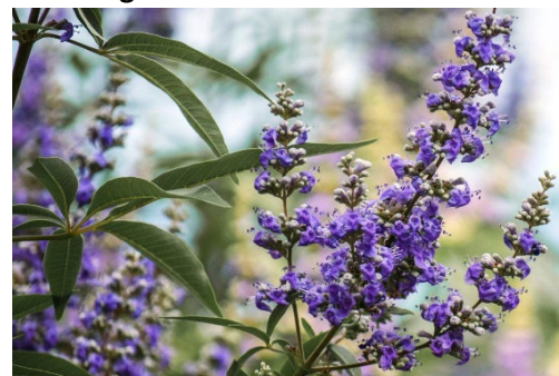
Vitex x Chicagoland Blues™ PP31659