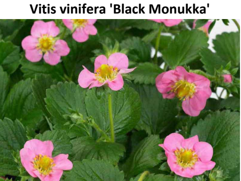
Fragaria x ananassa 'Gasana'