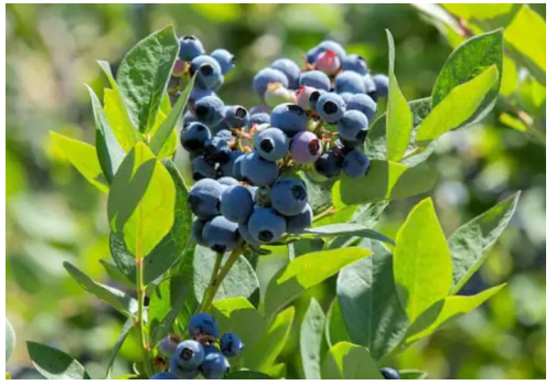
Vaccinium x 'Sunshine Blue'