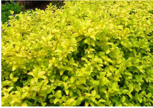
Ligustrum sinense 'Sunshine' PP20379