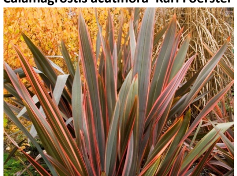
Phormium 'Maori Queen'