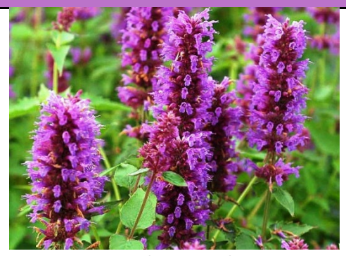
Agastache 'Blue Boa' PP24050