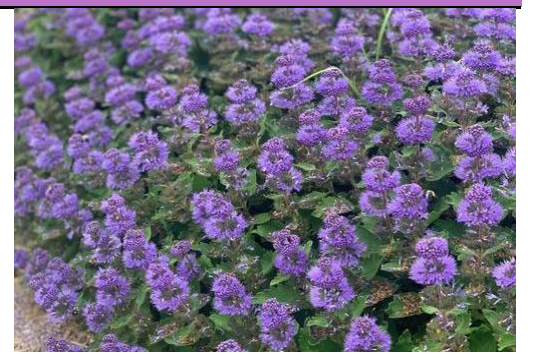
Caryopteris in. Pavilion™ Blue PPAF