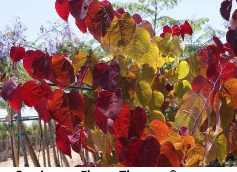
Cercis can. Flame Thrower® PP31260

Phormium 'Maori Queen' Gaura Belleza® Compact Light Pink Lavandula allardii 'Meerlo' PP25559 Penstemon h. 'Margarita BOP'