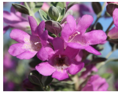
Leucophyllum 'San Antonio Rose' PP33454