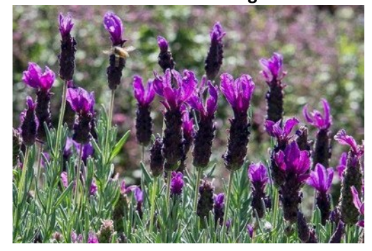
Lavandula Javelin Forte™ Deep Purple