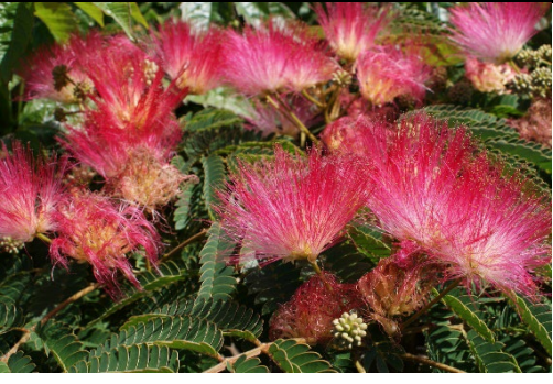
Albizia julibrissin Ombrella™