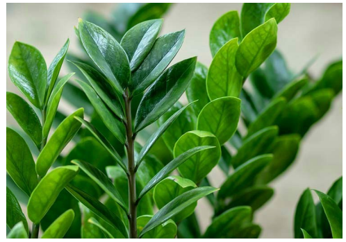
Zamioculcas zamiifolia 'Zenzi'