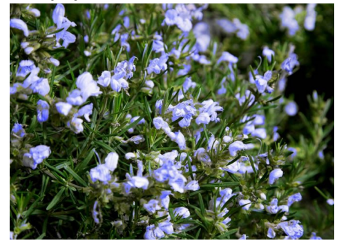
Rosmarinus o. 'Roman Beauty' PP18129