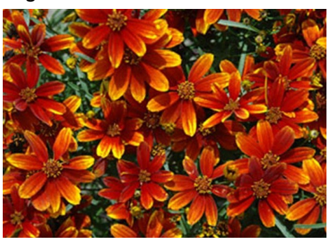
Coreopsis 'Ladybird' PP27362