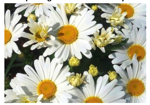
Leucanthemum Western Star™ Leo