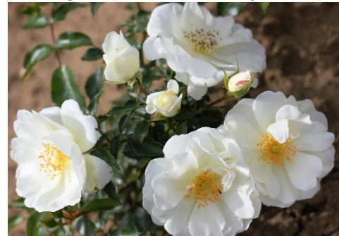
Rosa Flower Carpet® White