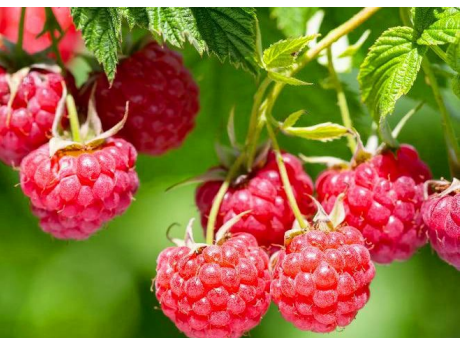
Rubus idaeus v. str. 'Willamette'