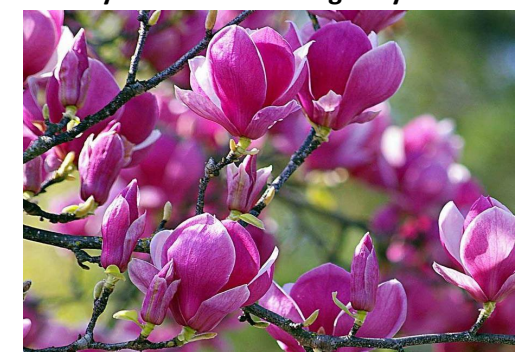
Magnolia soul. Black Tulip™ PPAF