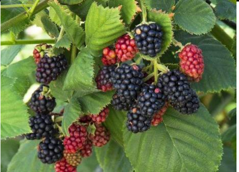
Rubus Watson Black Satin