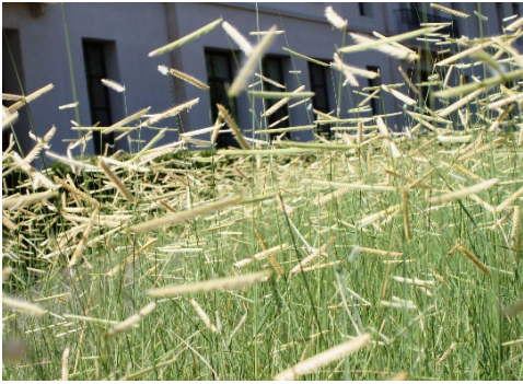
Boutelous gracilis 'Blonde Ambition'