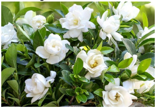
Gardenia jasminoides 'Veitchii'