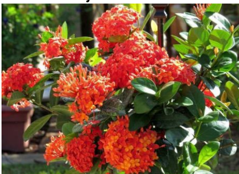
Ixora coccinea 'Maui Red'