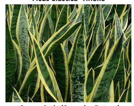
Sansevieria 'Superba Futura'