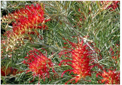
Grevillea 'Spirit of ANZAC' PP29372