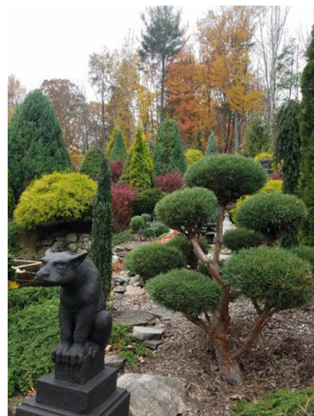
D'Esopo Garden, Avon, CT