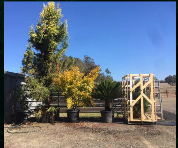
In line for planting