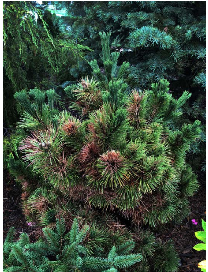
Pinus thunbergii , tenuous at best

indoor plant in my sunroom. I read all I could about the tree. I fawned over that tree. I monitored its soil water level. I misted it to maintain optimal humidity. By February 2018, it was turning gray, piece by piece. Its branches became brittle, its needles mean. I didn't take a picture of it. I was depressed and didn't want a memento of any kind. I suffered through destroying it while getting needles like cactus barbs stuck in my fingers. Not being able to take it anymore, I just dumped the whole remaining thing into a garbage bag. Done! Good riddance to bad tidings! $160 for the tree and $100 for shipping, plus pain and suffering. All down the drain!