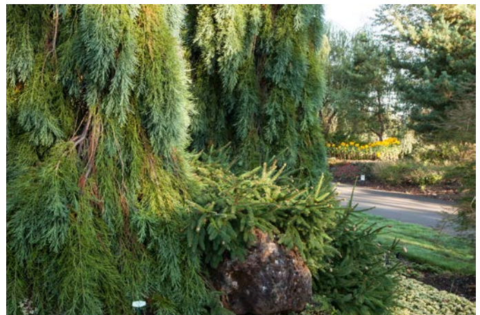
The Oregon Garden