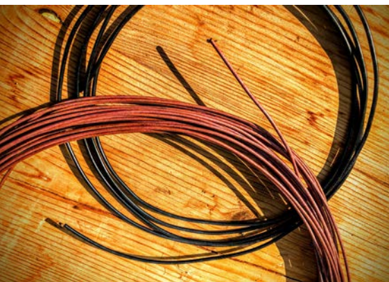
Bonsai tools and wire

next to the trunk line, pushing it into the soil at the angle you'll be spiraling the trunk. Two inches is usually enough to secure the wire into the soil. Then start wrapping the wire around the trunk at about a 45° angle, bypassing the branches and spacing the wire evenly all the way up the trunk.