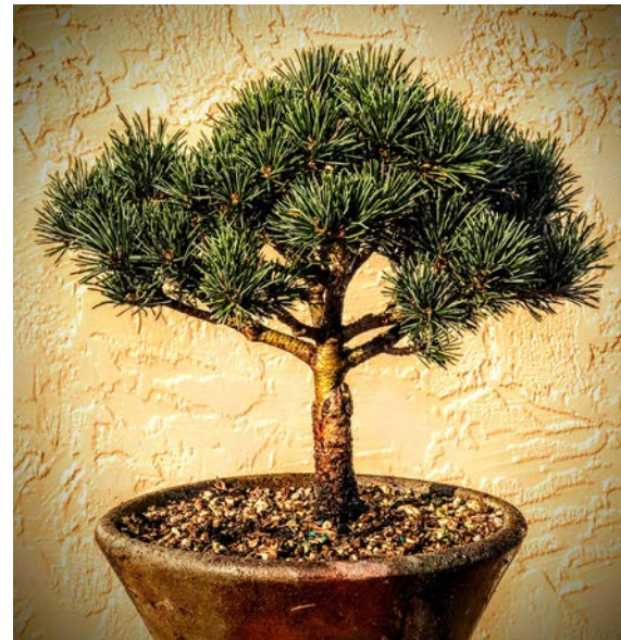
A great example of a nice little pine that has never been wired. Pinus parviflora 'Regenhold Broom'

Wire comes in rolls of various diameters.