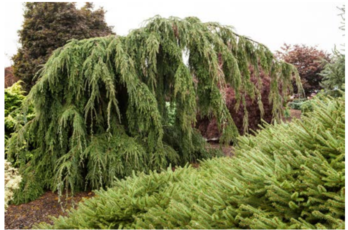
Views of Iseli Nursery

has matured over the years, and Iseli has augmented the plantings with ceramics and other hardscape, so that, even if you have visited before on other ACS trips, you will marvel at how the garden has grown and changed. We have an entire morning planned here, with espresso (practically a Pacific Northwest requirement) and snacks to fortify us as we explore a true conifer paradise.