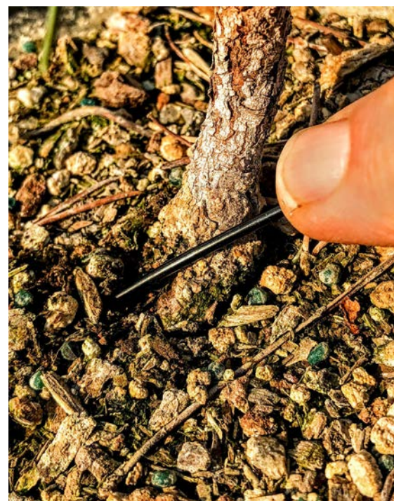
Wire inserted 2" into the soil

temperamental and others are more forgiving.