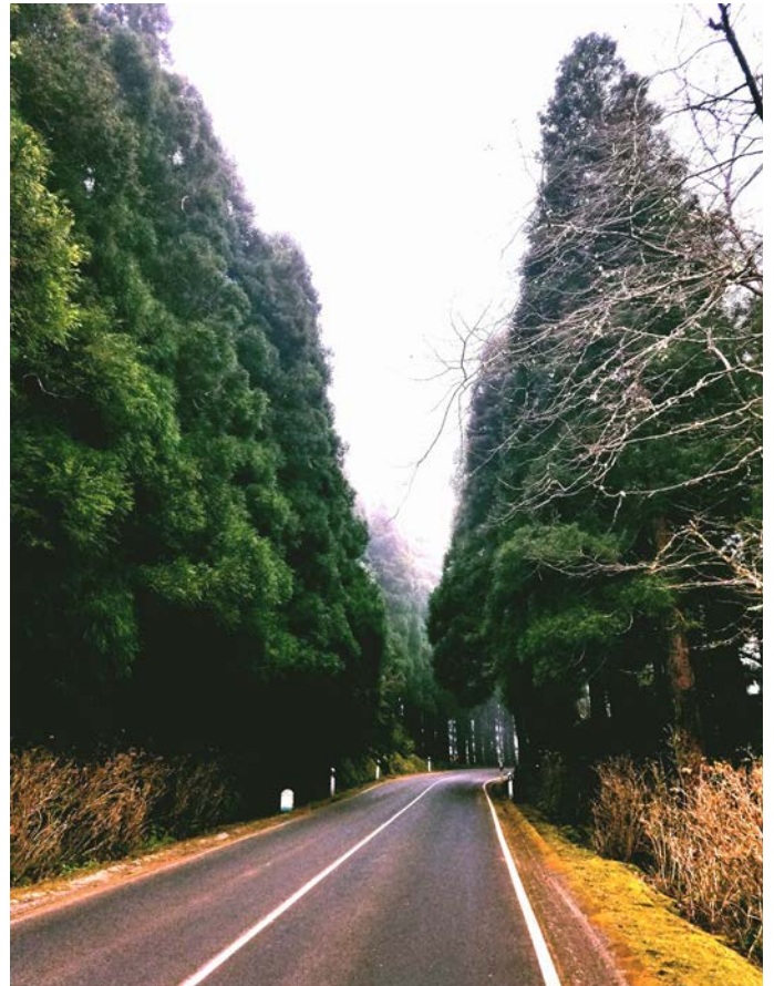
Cryptomeria japonica along the roads