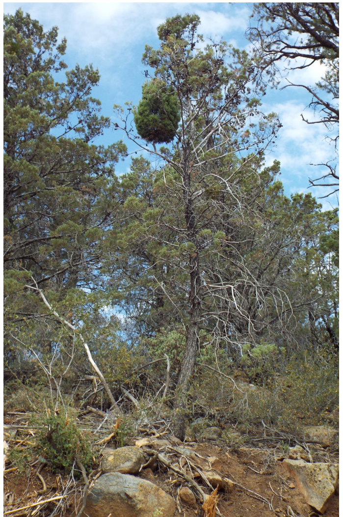
Cupressus nevadensis witch's broom

Cupressus nevadensis is closely related to Cupressus arizonica . Thus, it might be expected that performance of this species in gardens of the Southeast would not be good. To my knowledge, however, the only Southeast-garden trialing of this plant is in the Cox Arboretum, just north of Atlanta, Georgia. Both of Tom's two, small specimens have exhibited vigorous steely-blue growth and have shown no ill effects from excessive moisture and humidity. Provided with a site having good drainage that generally stays on the dry side and receives full sun, Cupressus nevadensis may offer an uncommon addition to any collector's garden. The biggest challenge, of course, might be locating and purchasing a specimen. If you are hoping to stumble across this plant at your favorite nursery, forget about it. After extensive internet