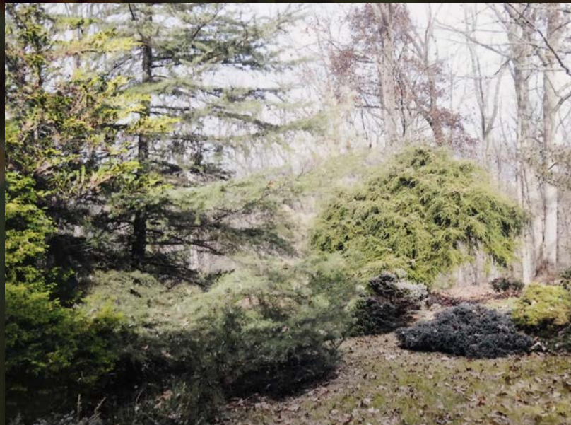
View into the conifer garden