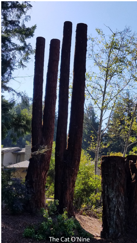
The Cat O'Nine