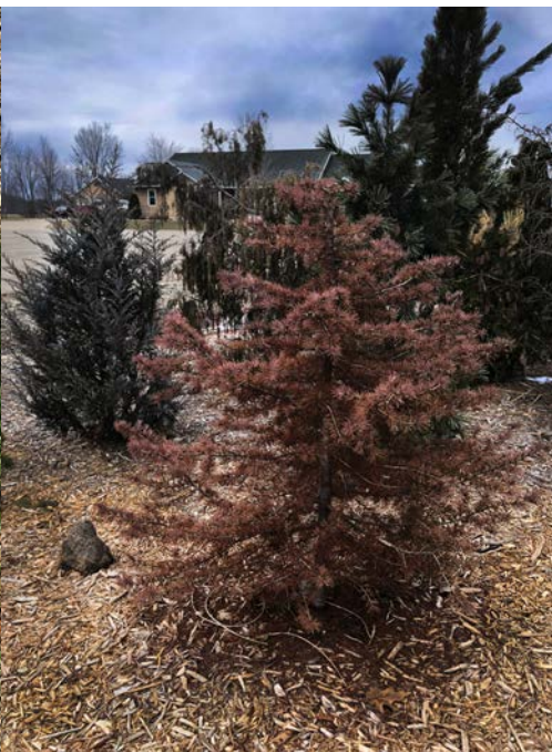
'Bush's Electra' moribund