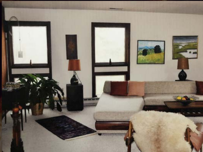
Interior view of the Henne home