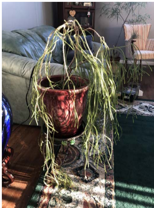
Dacrydium cupressinum in happier times