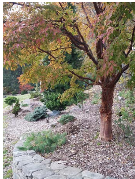
Magyar Garden, New Hartford, CT