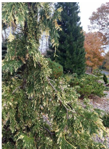
Magyar Garden, New Hartford, CT

At the bottom of Sandy's garden is a beautiful Cupressus nootkatensis 'Pendula' (weeping Alaska cypress), inadvertently limbed up by marauding deer, but otherwise rather dense. In the center of everything is a broad expanse of verdant lawn, where ACS attendees will relax under a tent and savor a catered lunch. A mixed deciduous/