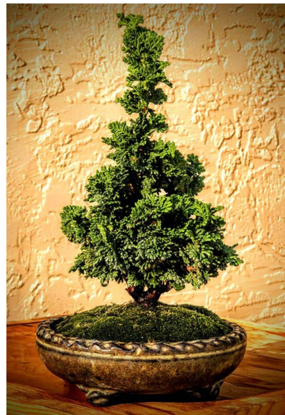
Thuja occidentalis 'IslPrim' Primo® wired for five years

If developing bonsai trees becomes your passion, and you truly enjoy it, you will find that, in time, you'll have many trees in your collection. With an outdoor conifer garden, there is a lot of down time, with nothing to do but watch it grow. With a bonsai collection to care for, you'll have a constant program of tending your trees that will keep you busy throughout the year.