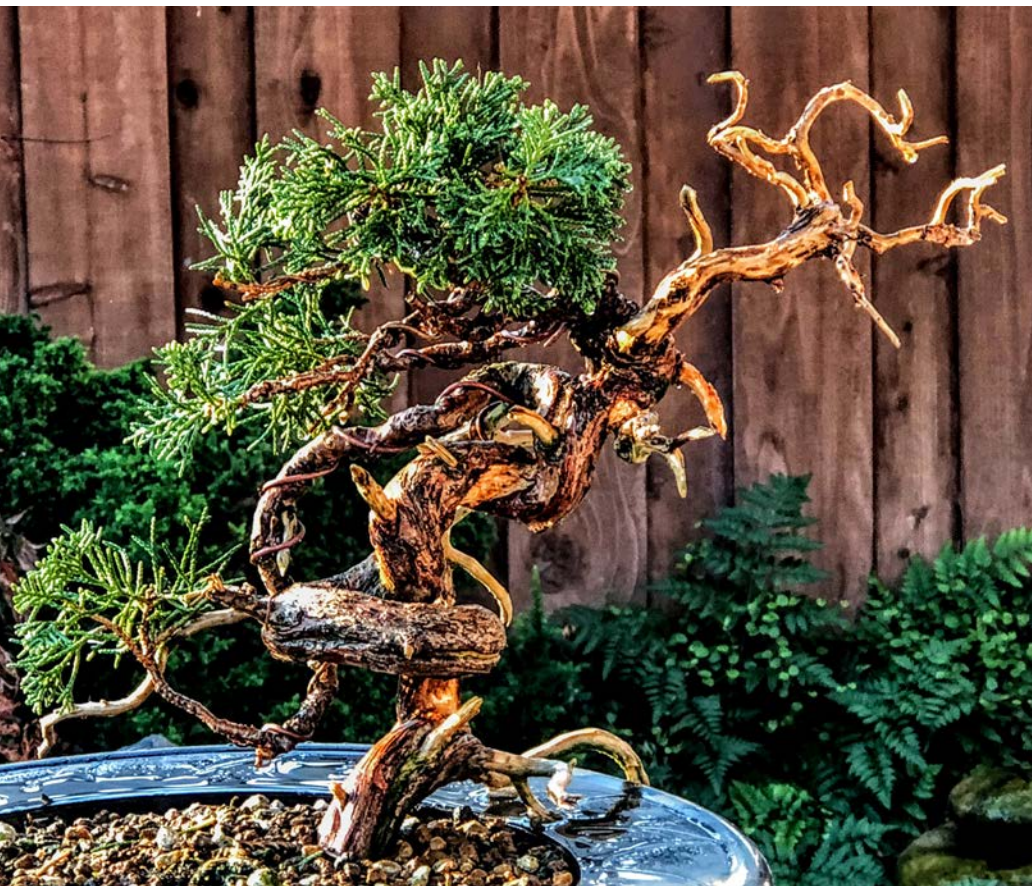
This is an example of a shape that can be achieved over years