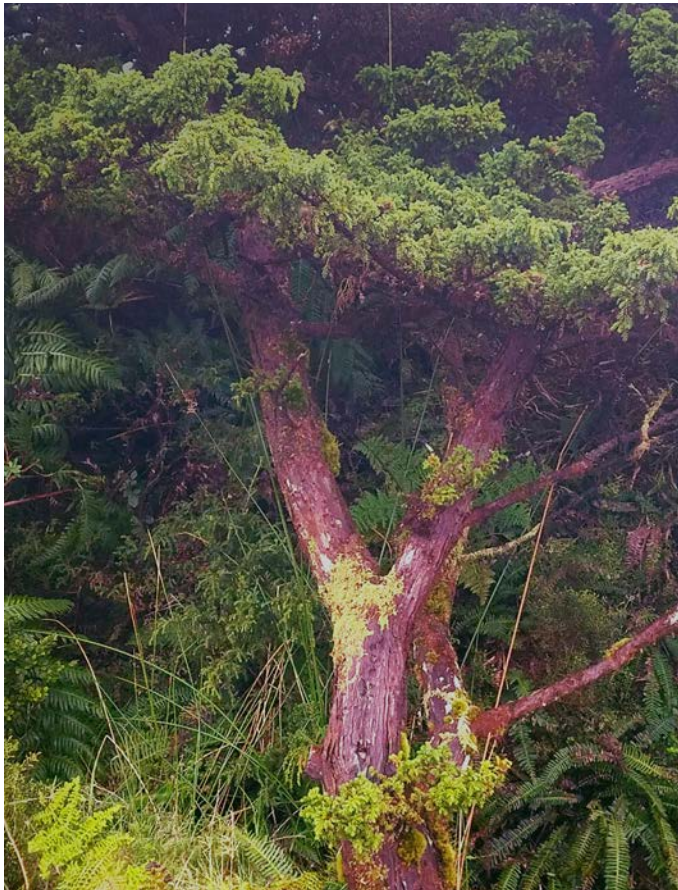
Juniperus brevifolia as seen in the wild