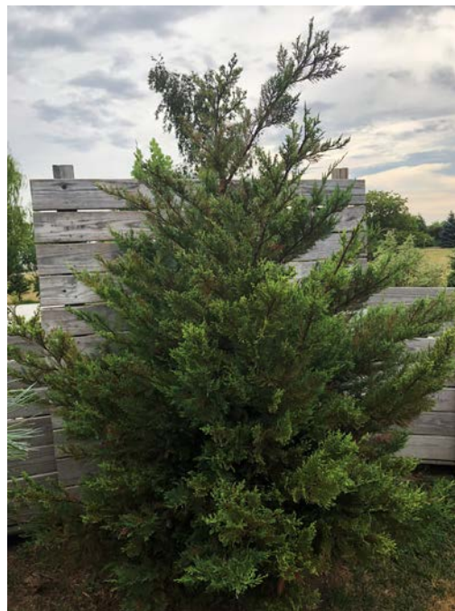
Semi-recovered 'Irish Eyes'