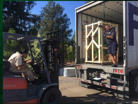
At last arrived

Well — here it is arriving at the Circle Oak Ranch in Petaluma, CA.