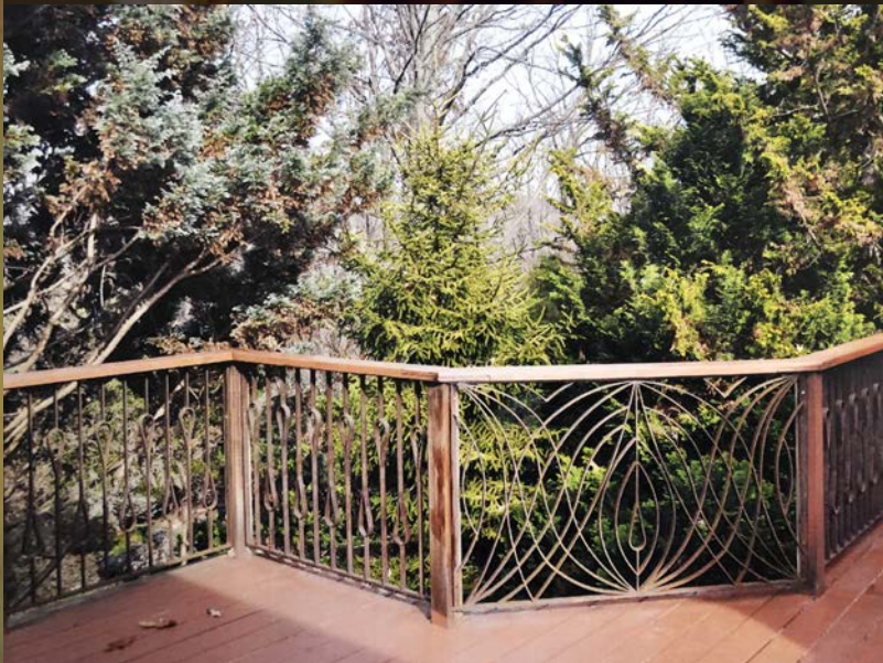
View from the deck