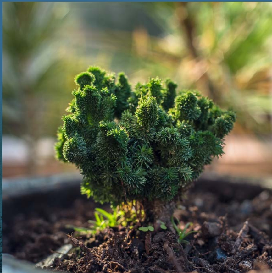
Thuja plicata 'Haley Bop'