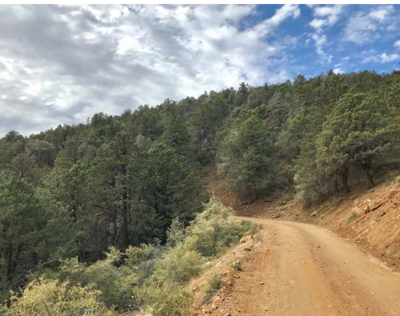
Mixed Forest of Cupressus nevadensis and Pinus monophylla

both in this country and around the world. However, I am always looking to add to my list of new discoveries. While I have to admit that there are a good number of conifers native to my home area of the Southeast, most have already been checked off my list. So, I had to cast my net farther, and, in this instance, several thousand miles farther away.