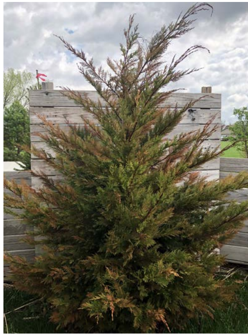
Post-winter 'Irish Eyes'