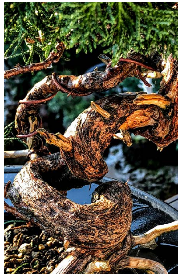
Close up of twists and contortions achieved by wiring

The key criterion for a plant that is bonsai-adaptable is the leaf or needle size. The larger the leaf or needle size of a plant, the larger a bonsai tree must be, in order to achieve a good size relationship.