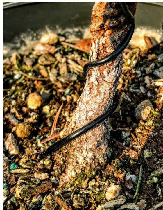
Wiring of the trunk at 45° angle

When I started looking for my first bonsai plant, I had no idea of the various strengths or weaknesses of the many trees. Going to a nursery and choosing just any plant was my demise. I now know some conifers are