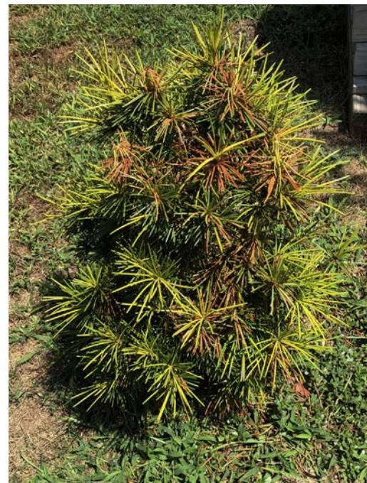
Partially burned umbrella pine

another conifer: "I didn't know you could raise Cedrus deodara in Michigan." Well, she was right. I couldn't. Two prophetic warnings that came true.