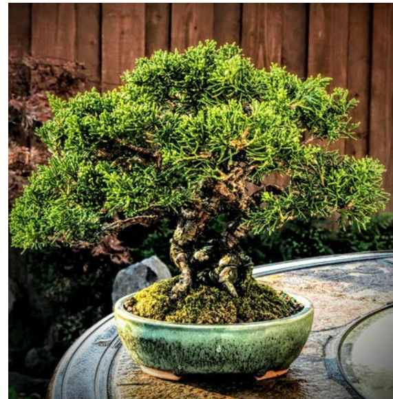
Juniperus chinensis 'Shimpaku kishu' never wired and right out of a 4-inch pot

Make sure that you choose wire large enough in diameter to have the strength to hold the bends you want in the branches to be wired. Having three rolls of various diameters will take care of most of your needs.