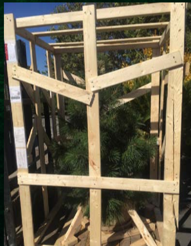
Resting in its crate