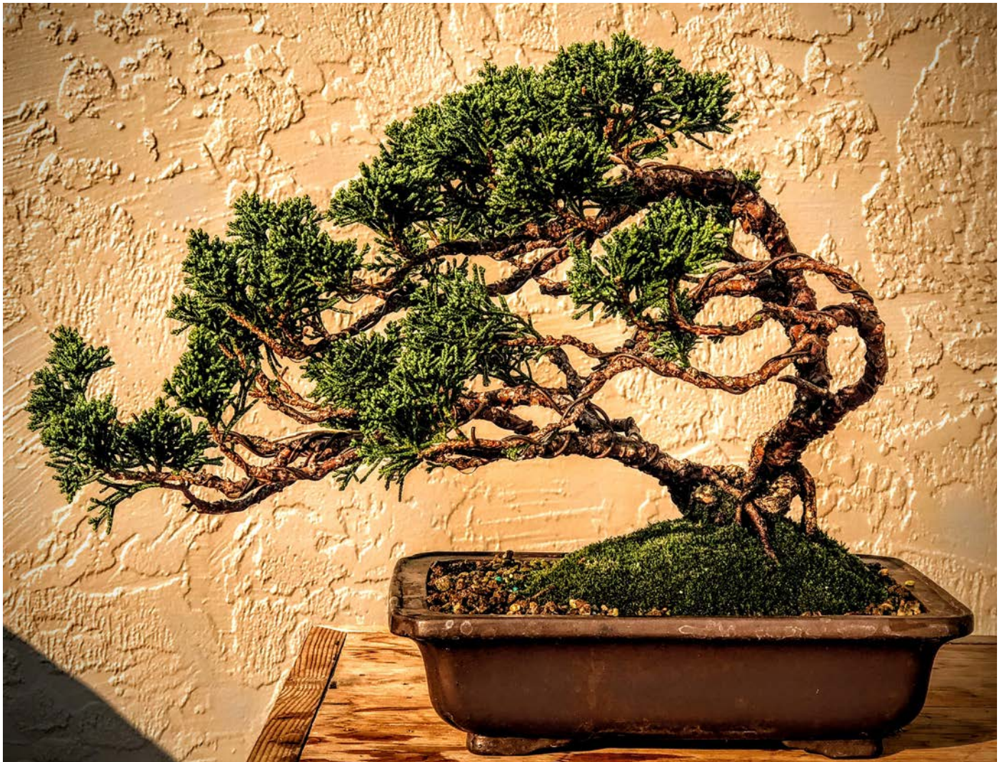
A rock-planted juniper that is wind-influenced with dead wood features. Juniperus chinensis 'San Jose'

Every morning, I spend a couple of relaxing hours outside, working on my bonsai trees. This is the most cherished time of day for me, working on my trees and taking care of their needs. I'm also the president of our bonsai club here in San Jose, California. Many of my closest friends are club members. Weekly, we attend workshops together and exchange information about our various experiences doing bonsai. My time outside in the environment of my conifer garden, along with having a large collection of bonsai trees, has brought me closer to nature and the joys of life. I hope that you will experience this same joy with bonsai.