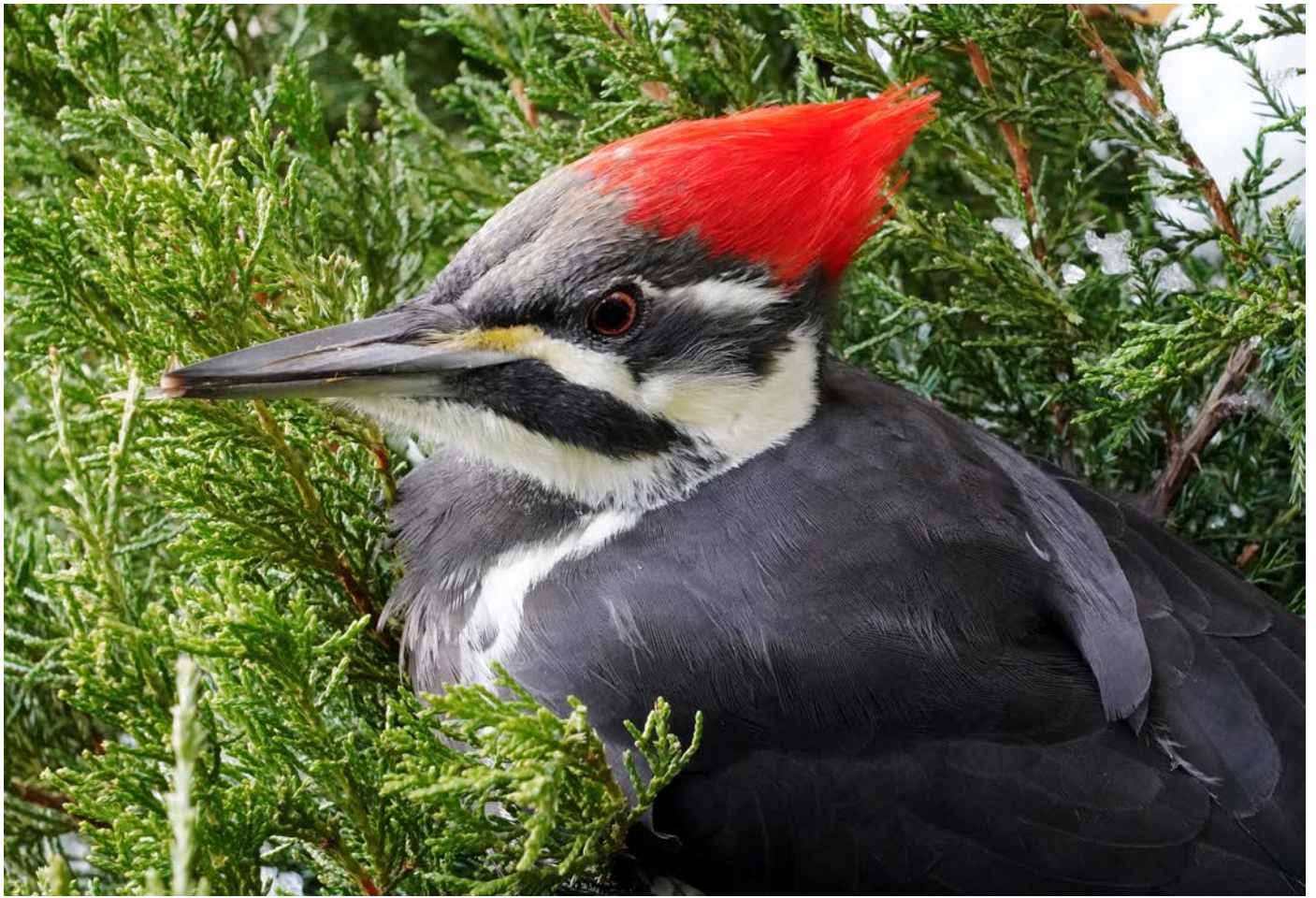
Pileated woodpecker ( Dryocopus pileatus ) adding color to a juniper on my property.

The pileated woodpecker is mostly a sedentary inhabitant of deciduous forests in eastern North America, the Great Lakes, the boreal forests of Canada, and parts of the Pacific Coast.