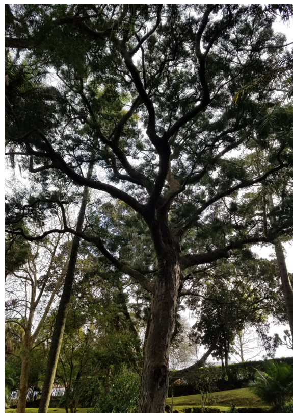
Huge Arocarpus falcatus in Jardim António Borges