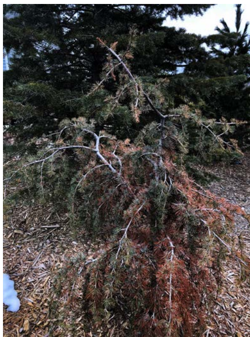
Burned and dying Cedrus libani var. stenacoma

This past, fourth winter would prove to be a death-knell for 'Irish Eyes', or so I thought. I really believed I would have to remove the tree. However, as warmer days grew in number, it started to green up again (something it never had to do in the previous three years). The