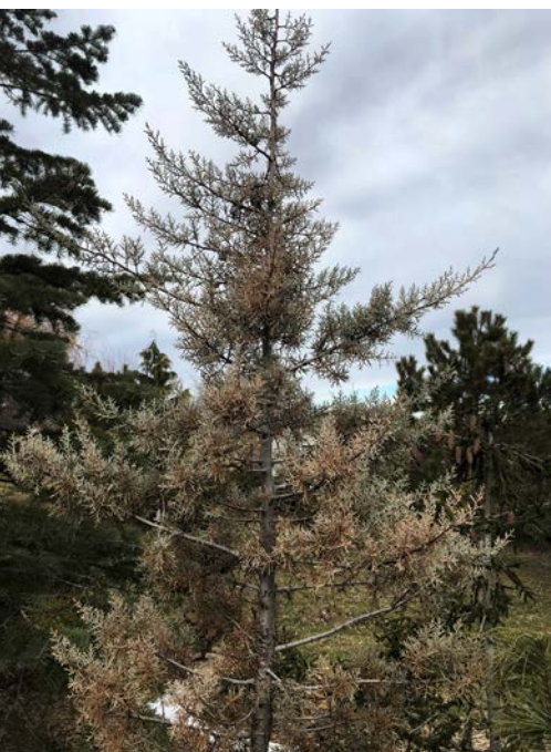
'Blue Ice' before its final execution

This past, fourth winter would prove to be a death-knell for 'Irish Eyes', or so I thought. I really believed I would have to remove the tree. However, as warmer days grew in number, it started to green up again (something it never had to do in the previous three years). The