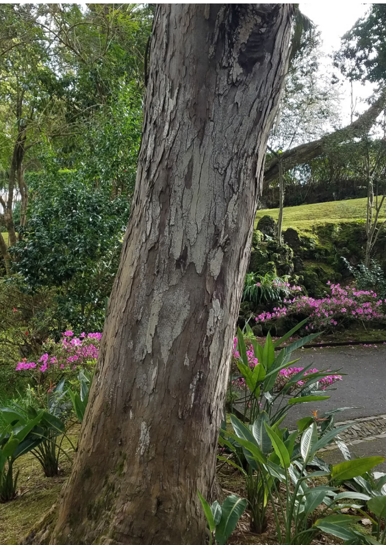
Massive trunk of Afrocarpus falcatus

Conifers such as Agathis australis , Araucaria heterophylla , A. columnaris , and Afrocarpus falcatus are as large as I've ever seen. Another of the garden's noble trees is the Indian rubber tree ( Ficus elastica ) with its wide-spreading, fluted trunk. This is a well laid out and easy to walk, free, public garden, now owned by the city. Reminiscent of the Buenos Aires Botanical Garden in Argentina, it's a great place to relax.