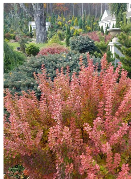
D'Esopo Garden, Avon, CT