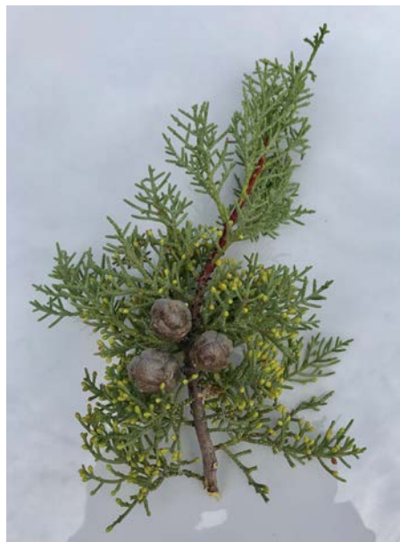
Cupressus nevadensis cones and foliage

I continued driving up the road, hoping to find a sign officially designating the Bodfish Paiute Cypress Botanical Area, but none was to be found. Only a marker for the Sequoia National Forest was present. Feeling I had gone far enough, I found a wide spot in the road and parked. Not another soul was to be seen, and I had the whole place to myself for my brief in situ encounter. Walking back down the road, I found a random tree to examine more closely, noting such things as the aromatic and resinous foliage, the size of the cones, the vertically fissured bark, and anything that could possibly help me in the future to distinguish this particular species from others in the family.