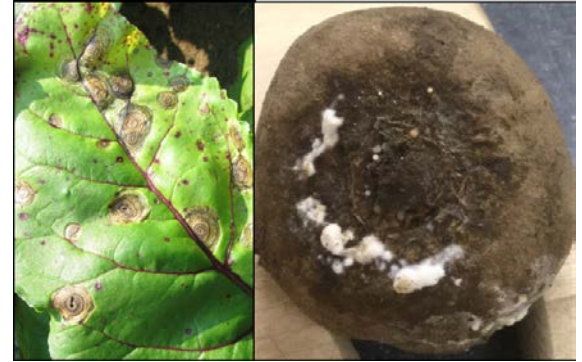
Fig. 1. Symptoms of Phoma leaf spot (left) and Phoma root rot (right).