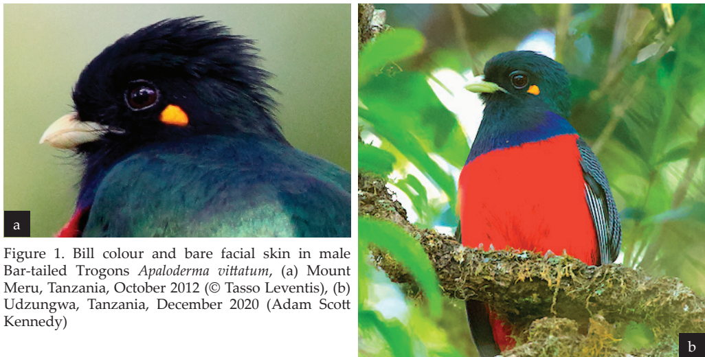
Figure 1. Bill colour and bare facial skin in male Bar-tailed Trogons Apaloderma vittatum , (a) Mount Meru, Tanzania, October 2012, (b) Udzungwa, Tanzania, December 2020

when the light in the photograph shows the colour fully (Fig. 2a,b); four of the five other photographs showed neither ear spot nor gape line, while one showed these features and a yellow supraocular mark (see Discussion and Fig. 4). In seven of eight photographs (88%),