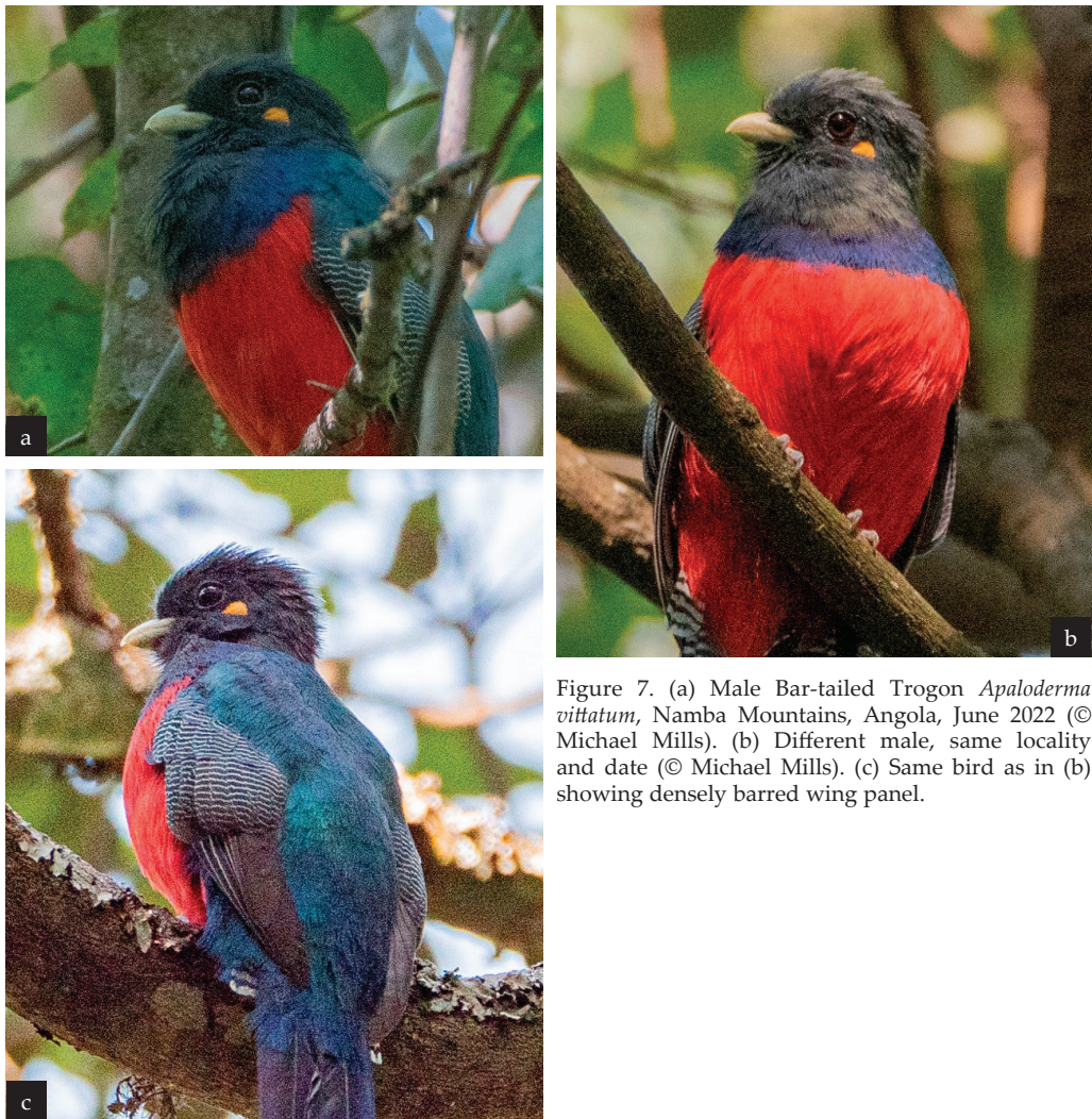
Figure 7. (a) Male Bar-tailed Trogon Apaloderma vittatum , Namba Mountains, Angola, June 2022 (© Michael Mills). (b) Different male, same locality and date (© Michael Mills). (c) Same bird as in (b) showing densely barred wing panel.

Eastern birds exceeds the Tobias threshold for species rank, and we are strongly inclined to judge such elevation appropriate. Given that the Tobias criteria consider ‘a pronounced difference in body part colour’ a major distinction and therefore worthy of a score of 3, our scoring of the bill difference is, arguably, conservative, but it pays respect to the somewhat anomalous description of the bill of Eastern birds in Mozambique as ‘pale aureolin-yellow, slightly pale greenish in tinge’ (Vincent 1935); indeed, there is a degree of variation in bill colour in the photographs used herein, although this may be in part an effect of light (the bird in Fig. 7b and 7c is the same yet the bill colour is a shade yellower in 7b). Certainly, however, the facial appearance that results from the combination of yellow bill and gape-line, when set beside the greenish-white bill on a plainer head, is very striking and can surely be construed as a signal that would form a strong disincentive to hybridisation if populations were ever to meet. (It bears mention that Central and Western females also possess a bare gape-line.)