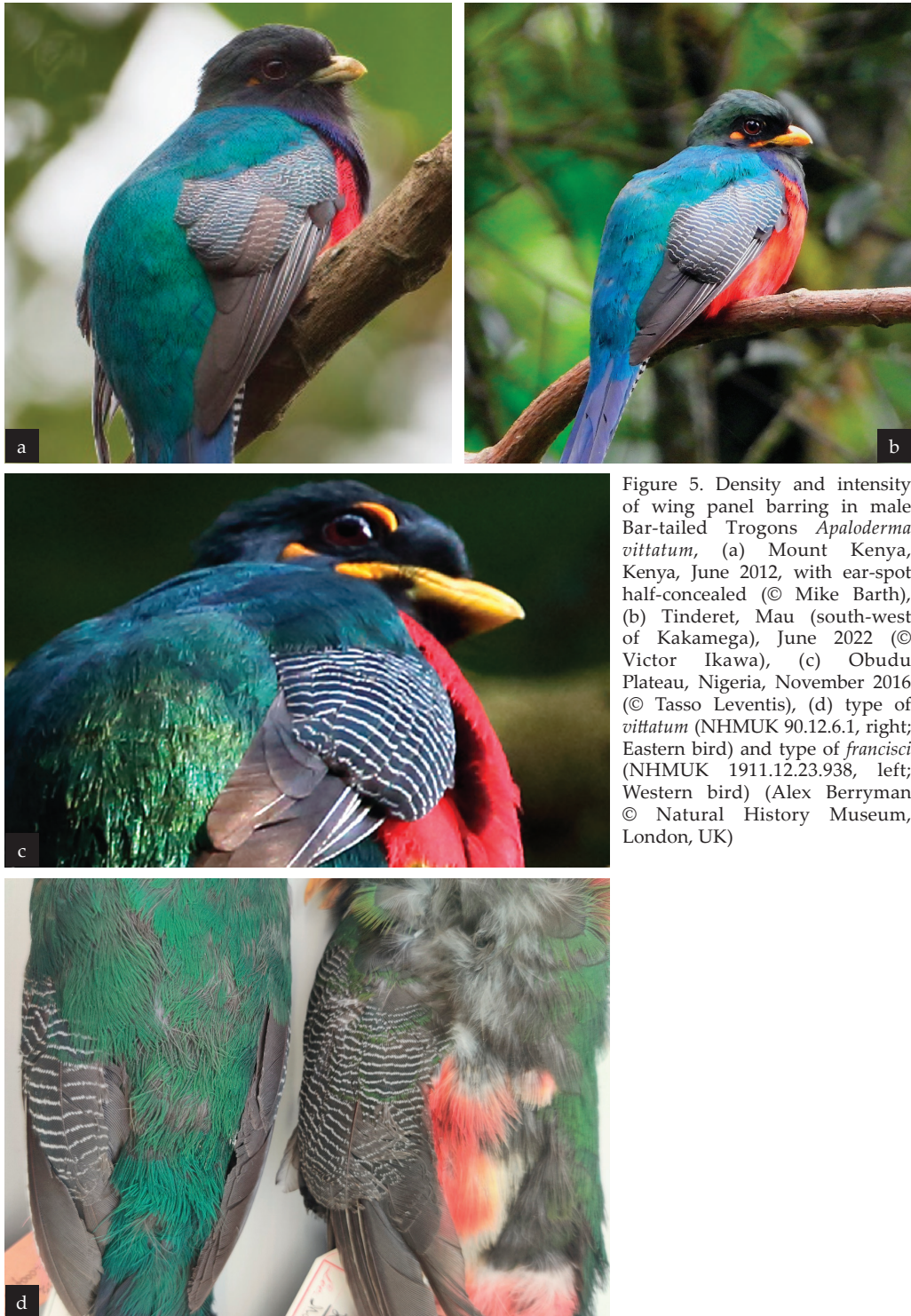
Figure 5. Density and intensity of wing panel barring in male Bar-tailed Trogons Apaloderma vittatum, (a) Mount Kenya, Kenya, June 2012, with ear-spot half-concealed, (b) Tinderet, Mau (south-west of Kakamega), June 2022, (c) Obudu Plateau, Nigeria, November 2016, (d) type of vittatum (NHMUK 90.12.6.1, right; Eastern bird) and type of francisci (NHMUK 1911.12.23.938, left; Western bird)