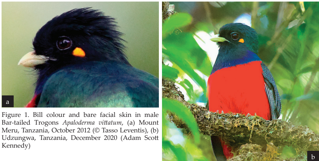
Figure 1. Bill colour and bare facial skin in male Bar-tailed Trogons Apaloderma vittatum , (a) Mount Meru, Tanzania, October 2012, (b) Udzungwa, Tanzania, December 2020

when the light in the photograph shows the colour fully (Fig. 2a,b); four of the five other photographs showed neither ear spot nor gape line, while one showed these features and a yellow supraocular mark (see Discussion and Fig. 4). In seven of eight photographs (88%),