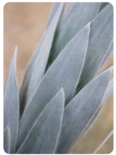
Silver tree