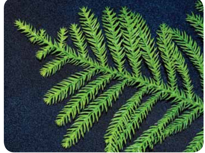
Araucaria cunninghamii. The Arboretum has a number of Araucaria from New Caledonia, Australia, and Chile.