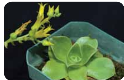
Dudleya stolonifera, the Laguna Beach live forever, is listed as a California Rare species and is known from only six localities.

$50 to sponsor a single plant $500 to sponsor a cultivar $1000 to sponsor a species