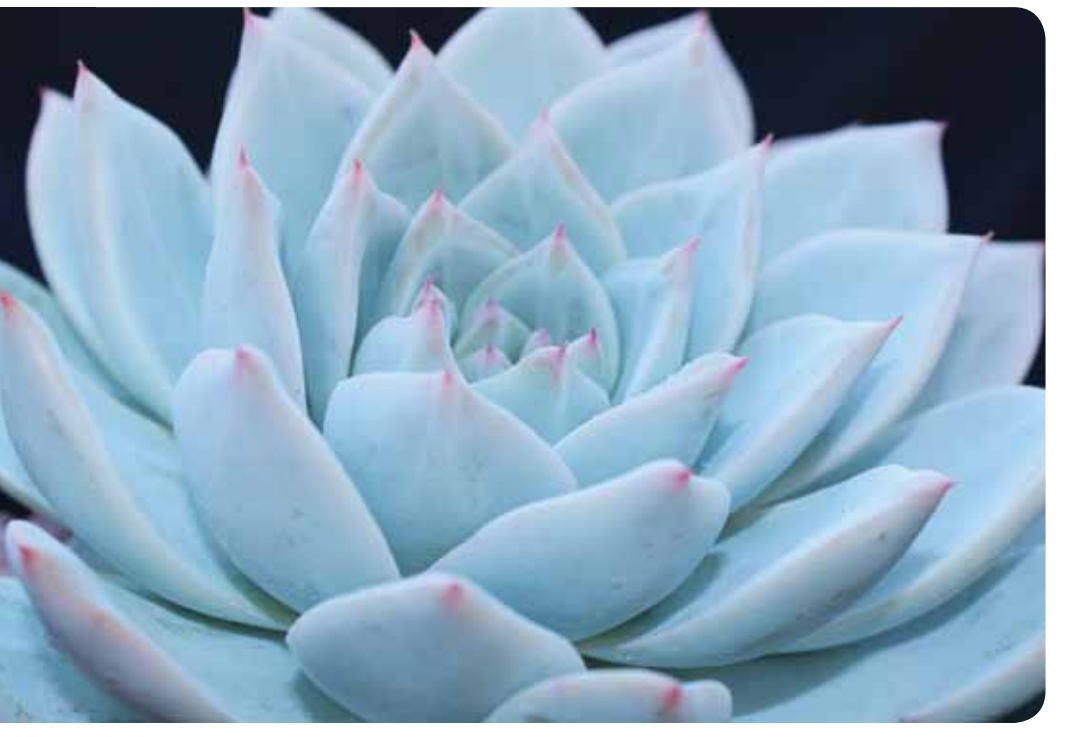
Echeveria colorata X subsessilis, a Bob Grim hybrid that has not been propagated for sale yet.