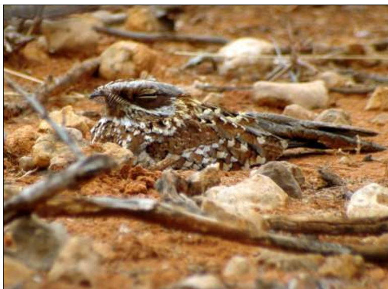
Donaldson-Smith's Nightjar by Angela Pattison

Days 6 & 7: Ban Cade Plains. We have two days to explore this interesting area. The Ban Cade Plains are vast, very scenic and quite different from the previous plains. This is serious lark, pipit, sandgrouse and bustard country. Specifically, we will look for Somali Lark (a different sub-species from the Tuuyo Plains), as well as Lesser Hoopoe-, Somali Short-toed, Desert and Short-tailed Larks. Other possible species include Egyptian and Lappet-faced Vultures, Short-toed Snake Eagle, Lanner Falcon, Somali Courser, Chestnut-headed Sparrow-Lark, Chestnut-bellied and Spotted Sandgrouse, Desert Wheatear and all the previously mentioned bustards.