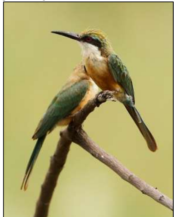
Somali Bee-eater

Day 13: Burco City to Berbera. We make a very early start today and travel across the scenic Golis Range, passing an historic Sheik village along the way. We'll stop at the shoulder of the escarpment to look for the rare Sombre Rock Chat, and perhaps