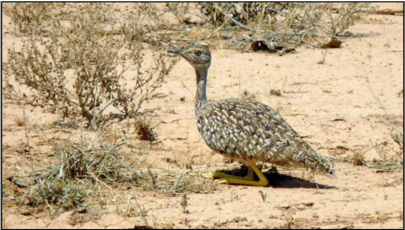
Little Brown Bustard by Angela Pattison

18 th September to 1 st October 2019 (14 days)