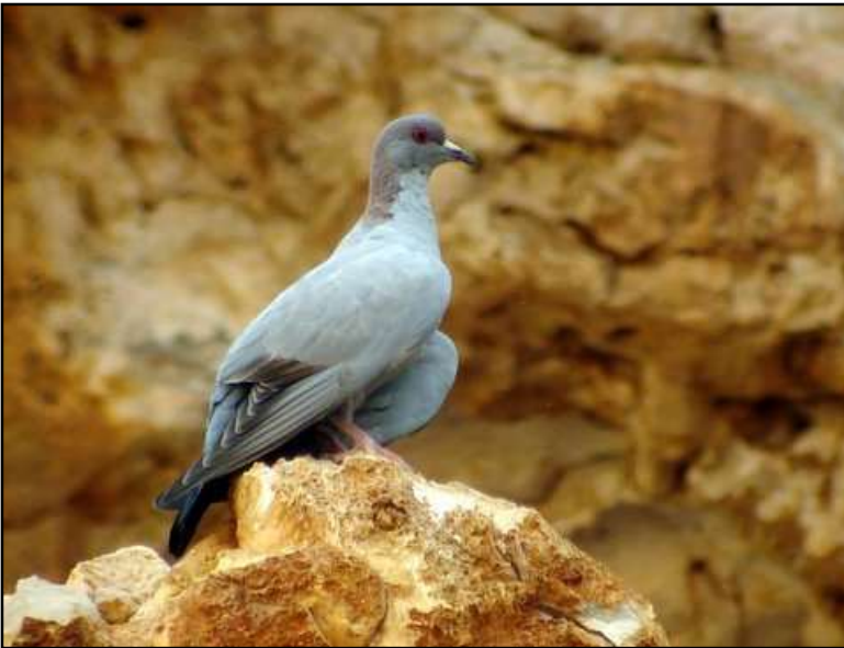
Somali Pigeon by Angela Pattison

a travel day, but we'll nonetheless make several comfort stops en route and keep a watch for any species we might not yet have seen.