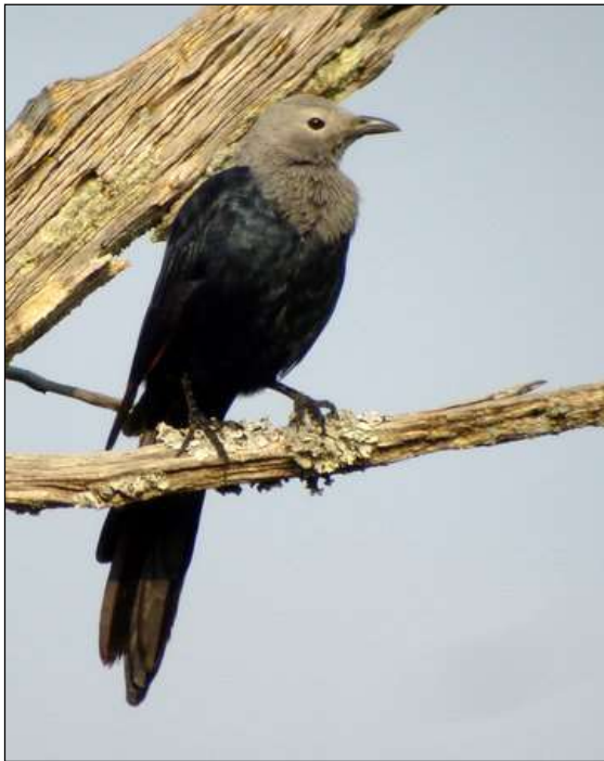
Somali Starling by Angela Pattison

Day 1: Arrival in Hargeisa. Today we arrive in Hargeisa where you will be met by your Rockjumper leader. Thereafter we will transfer to a fairly simple but comfortable hotel in town.