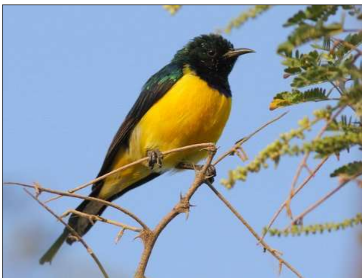
Nile Valley Sunbird

enigmatic remnant of Soemmering's Gazelle attempting a return after a near half-a-century absence, as well as Speke's Gazelle which seem to be doing a little better.