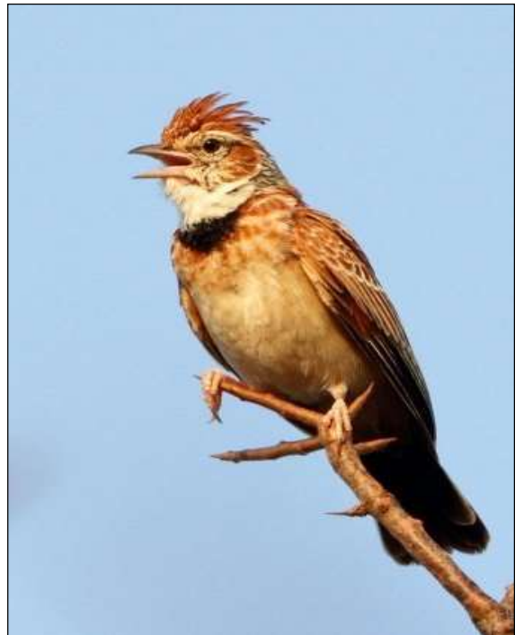
Collared Lark by Jonathan Rossouw

Day 3: Tri-Plains to Burco. Travelling further east to Burco, today we pass through areas of dry mixed woodland and stony hillocks where we could see Nubian Woodpecker, Magpie Starling, Little, Olive and Northern Carmine Bee-eaters, Yellow-breasted Apalis (here of the distinctive viridiceps race, that is sometimes split as Brown-tailed Apalis), Shelley's Sparrow, Upcher's Warbler, White-browed Scrub Robin, Brubru, Somali Crow, Blue-capped and Red-cheeked Cordon-bleus, Somali, Cream-coloured and Double-banded Coursers, Somali Fiscal, Crested Francolin and Vulturine Guineafowl. Just outside Burco City are the Aroori Plains and here we will have further chances for Somali Lark and Little Brown Bustard. Other species we might see in the area include Mourning Collard Dove, Somali Bee-eater, Red-and-yellow Barbet, Steppe Grey Shrike and Blanford's Lark. On this plain there is also an