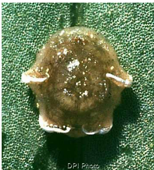
Figure 1. Adult female red wax scale, Ceroplastes rubens Maskell, showing the conspicuous pairs of white bands.