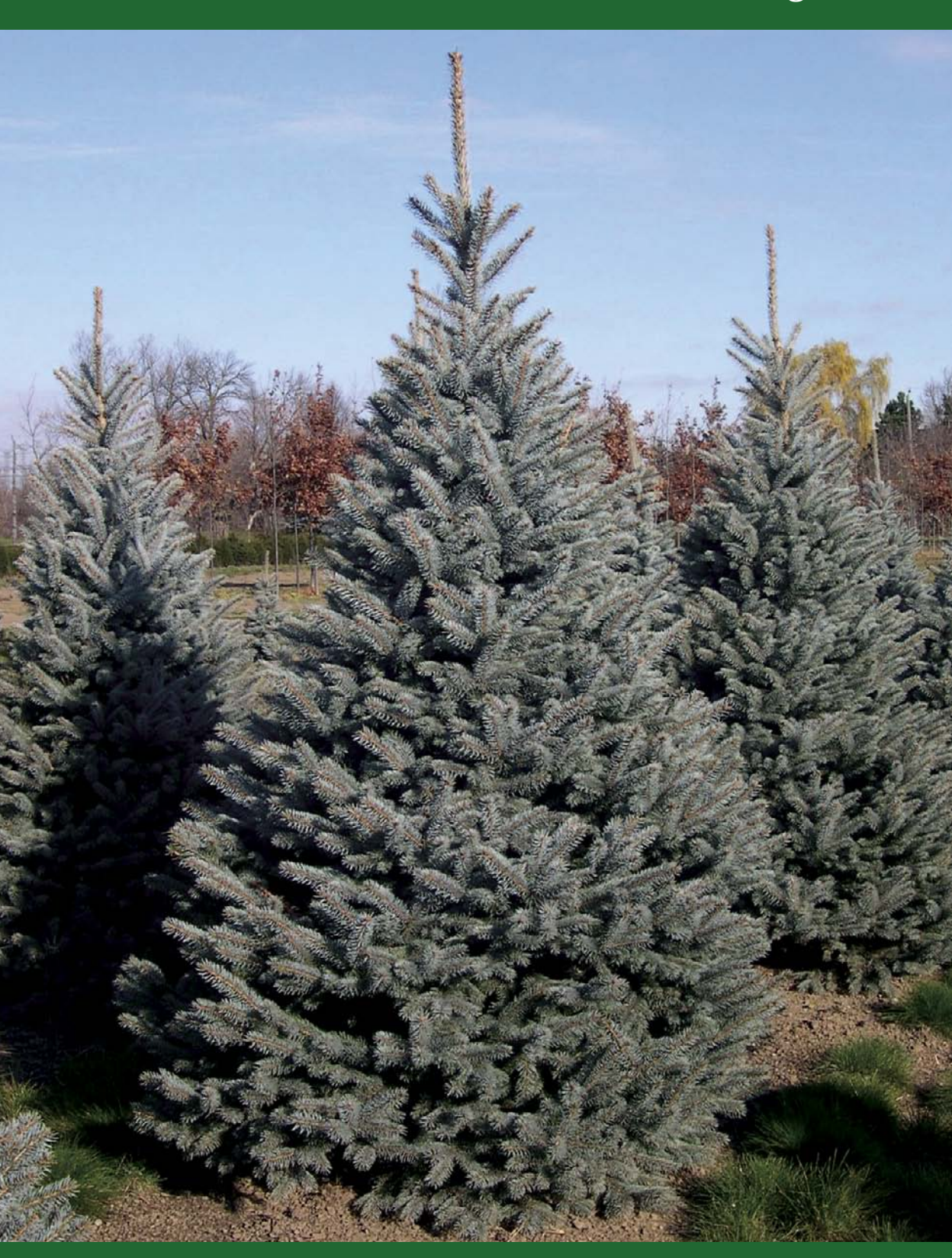
Fat Albert Spruce