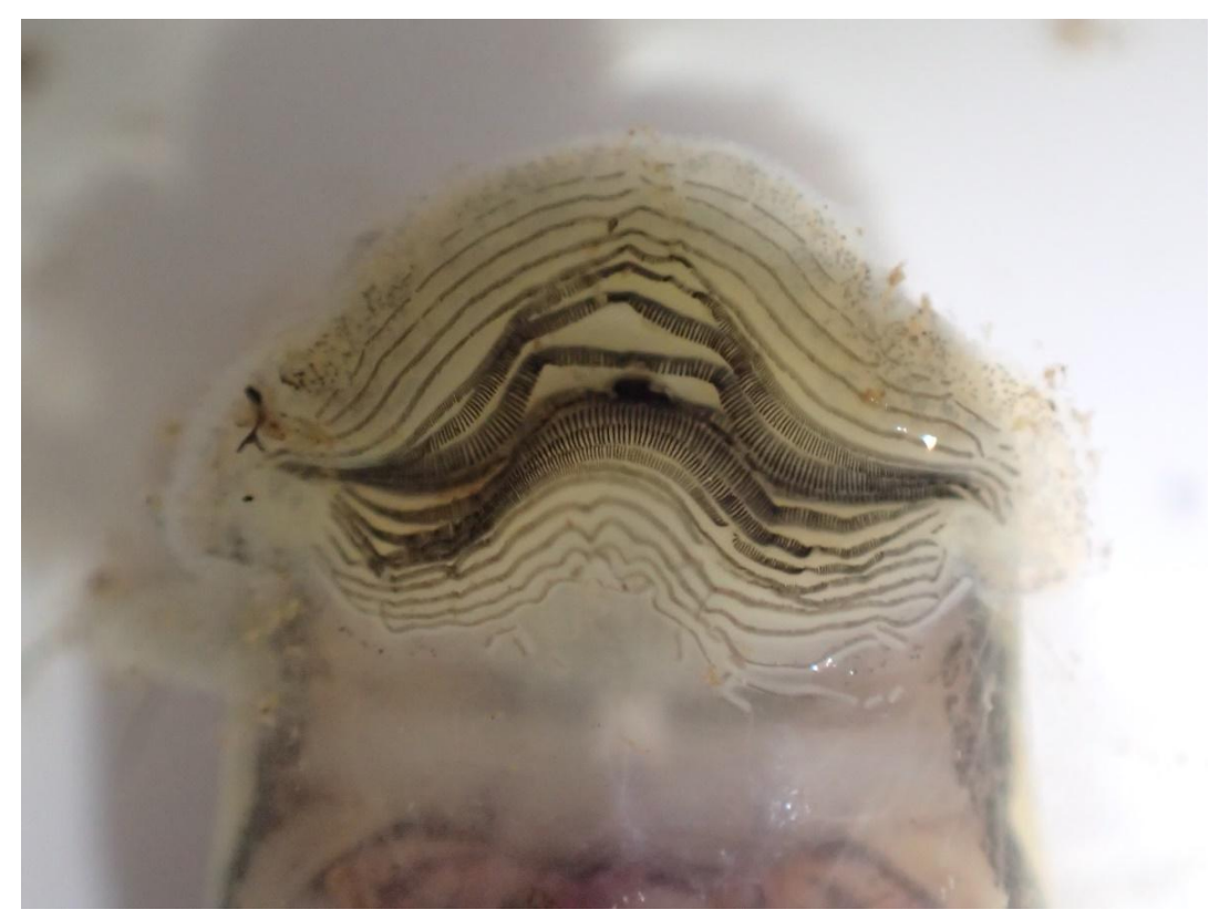
Tadpole mouthpart of Conraua beccarii, locality Komba Forest Stream