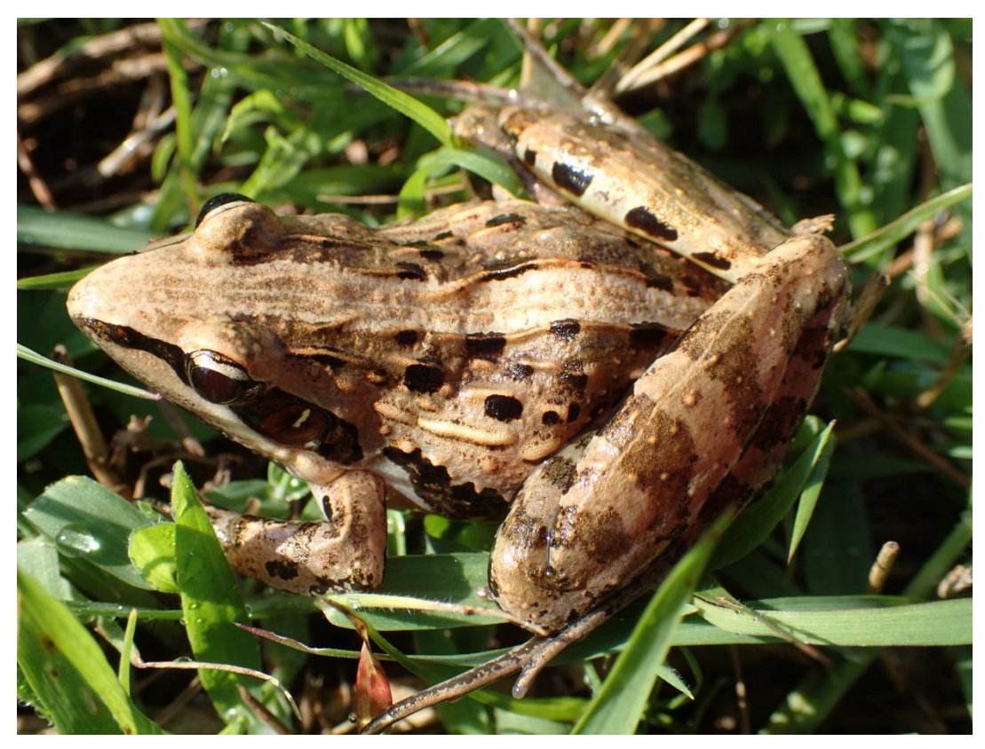
Ptychadena cf. schillukorum, locality: Boka Forest Wetland