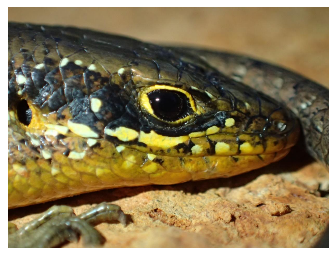
Trachylepis maculilabris, locality: KDA Guest House Bonga