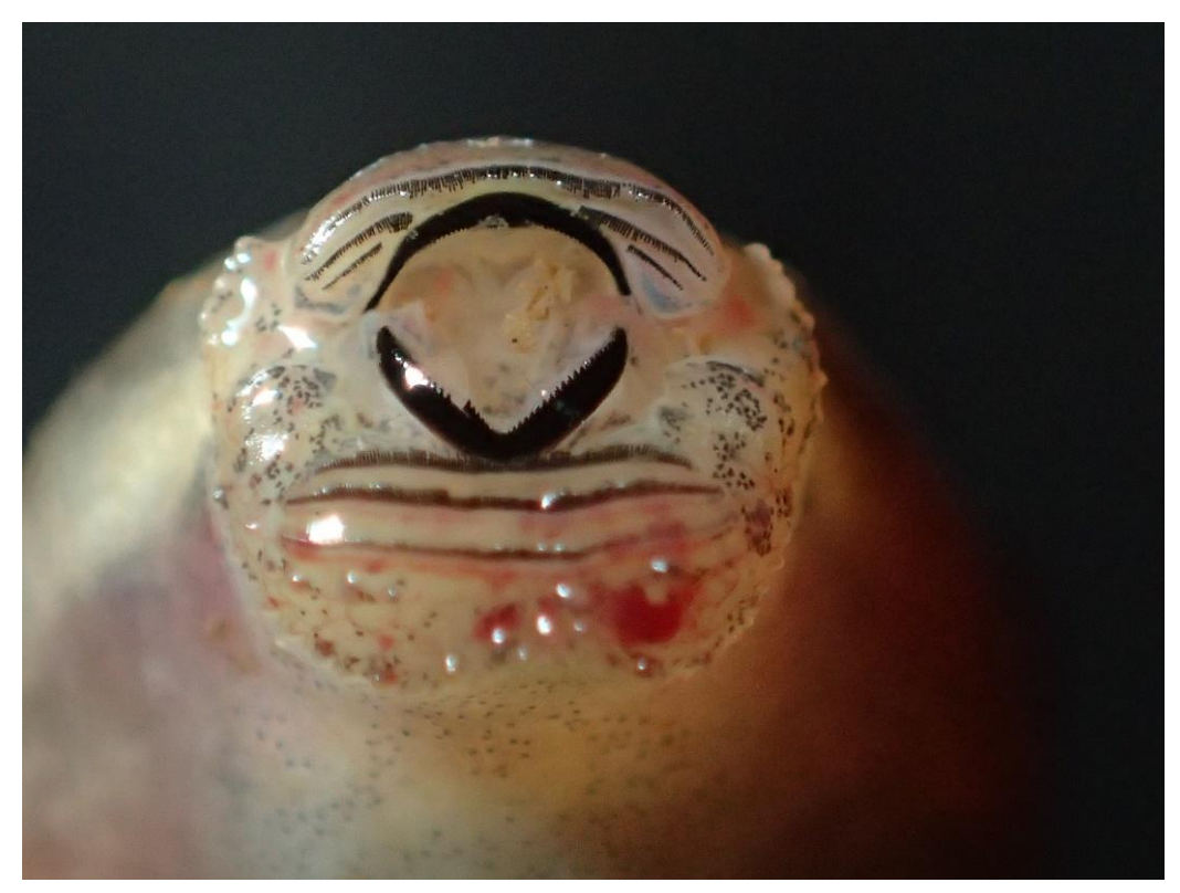
Leptopelis ragazzii tadpole mouthpart, 1st anterior labial tooth row not visible, locality: Komba Forest