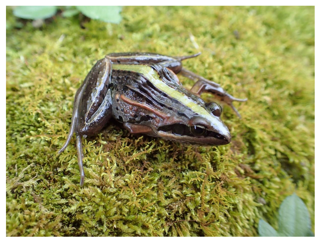
Ptychadena mascareniensis, locality: Shoriri Wetland