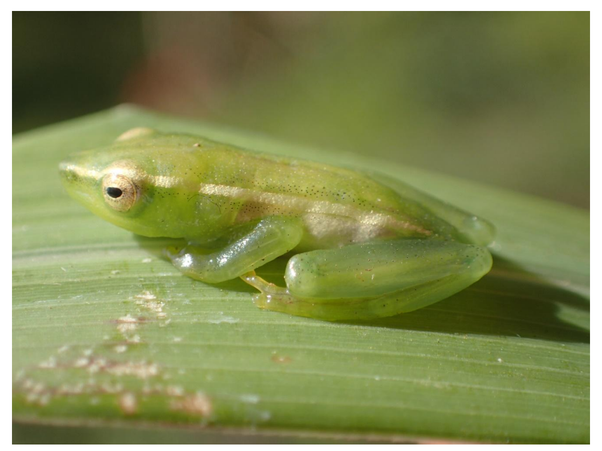
Hyperolius nasutus, locality: Alem Gono Wetland