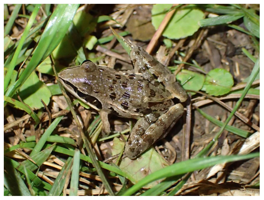
Ptychadena erlangeri, locality Gojeb Wetland