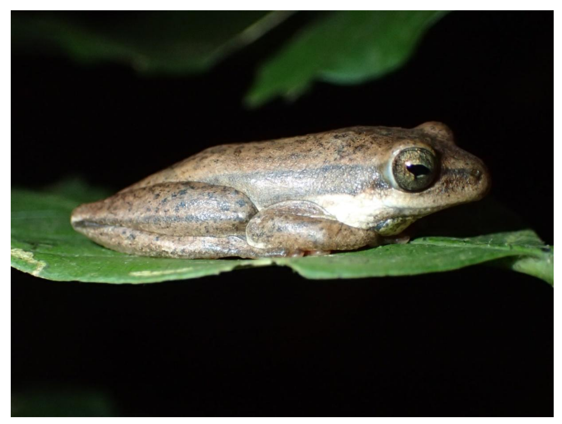
Hyperolius kivuensis, locality Gojeb Wetland