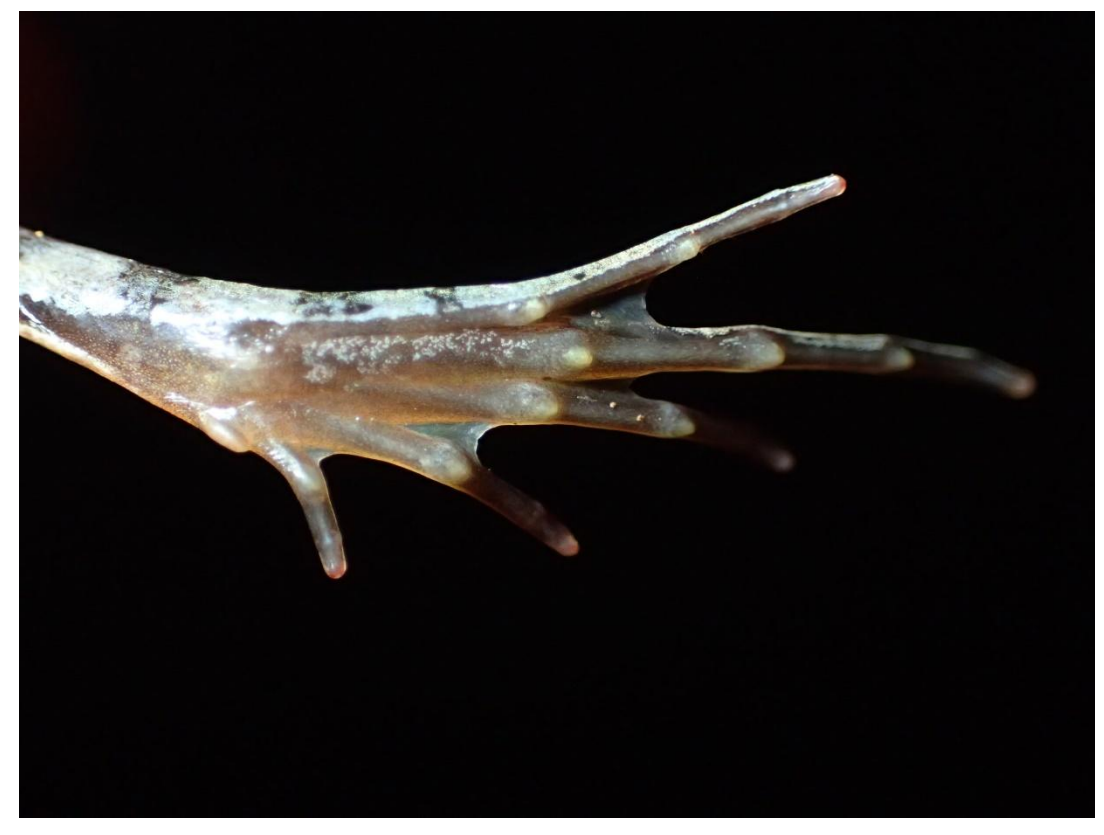
Foot of Ptychadena erlangeri, Gojeb Wetland