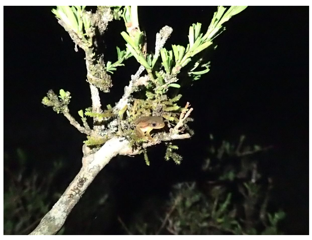
Afrixalus enseticola in untypical microhabitat, locality Gojeb Wetland