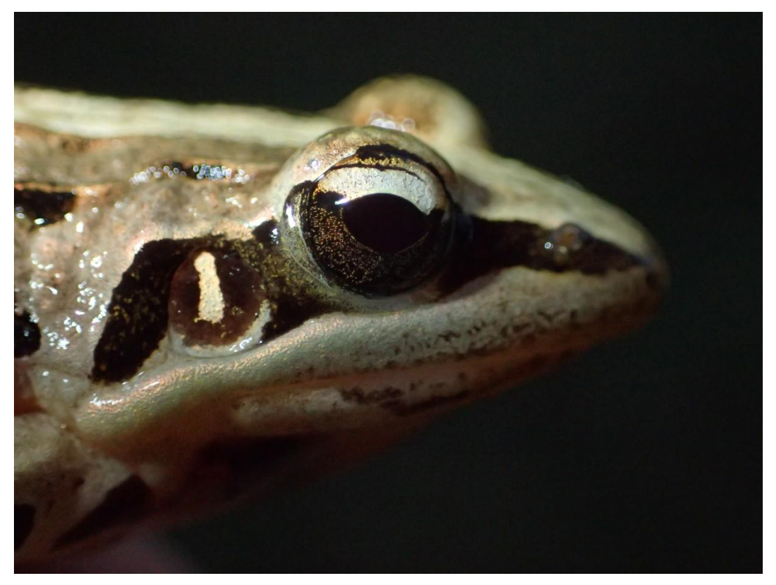
Ptychadena cf. neumanni, locality Gojeb Wetland