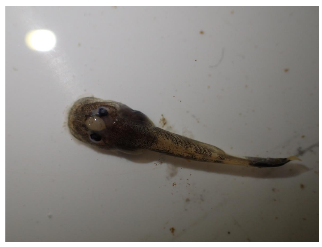
Tadpole of Conraua beccarii, locality Komba Forest Stream