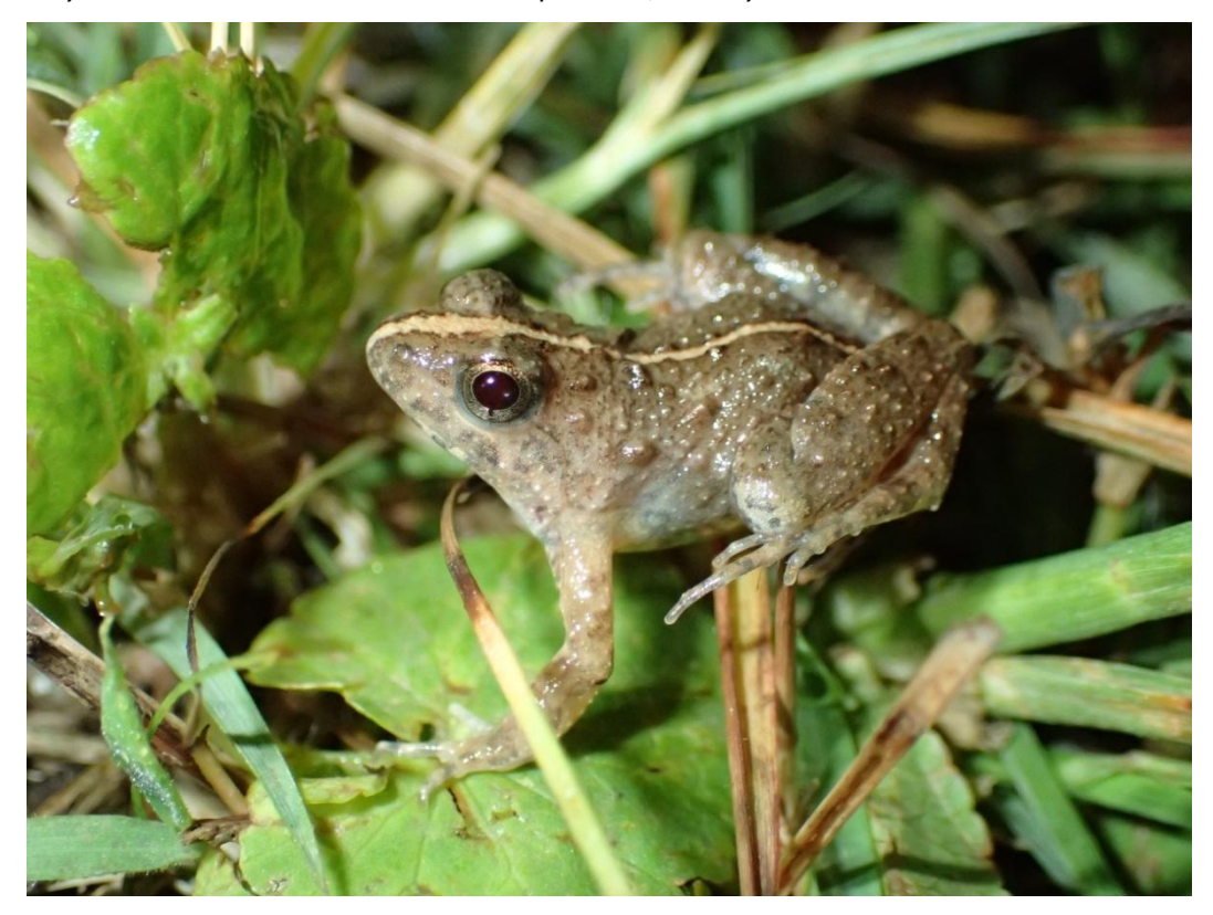
Phrynobatrachus inexpectatus, locality: Boka Forest Wetland