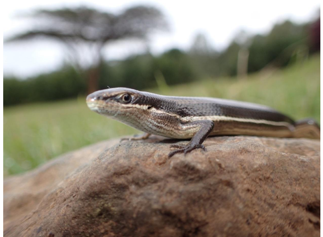
Trachylepis (Mabuya) wingatii, locality: Boka Forest Wetland