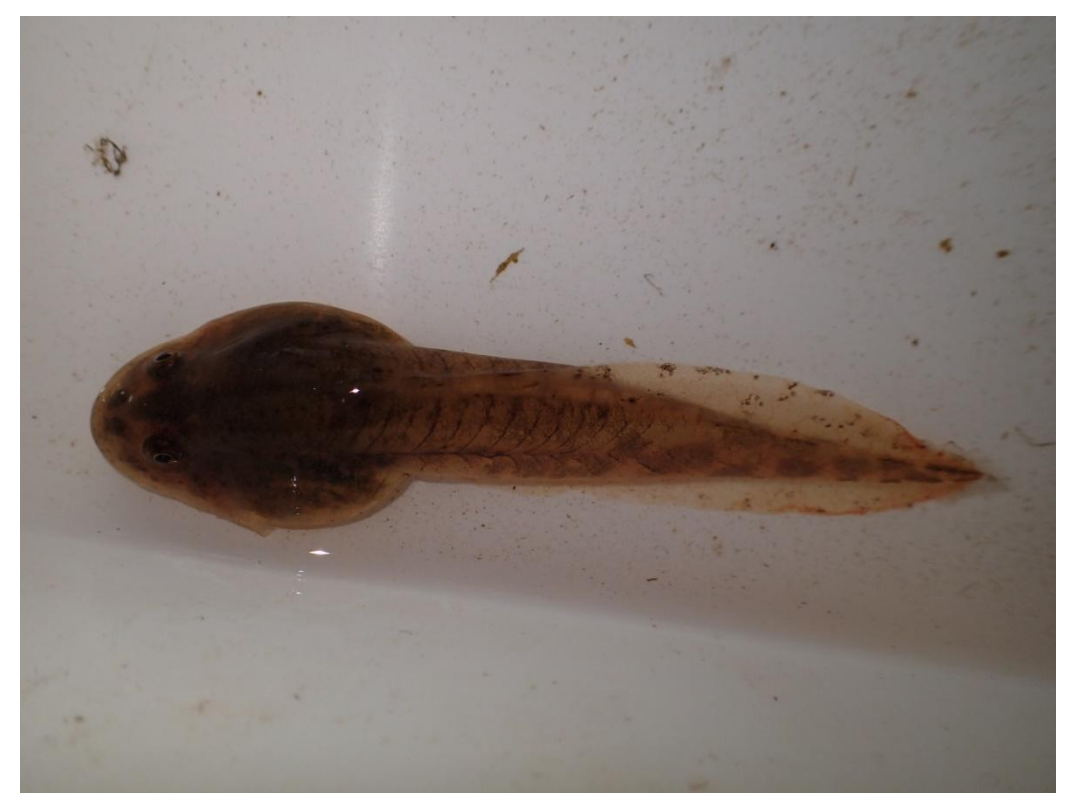
Leptopelis spec., locality Boka Forest Wetland