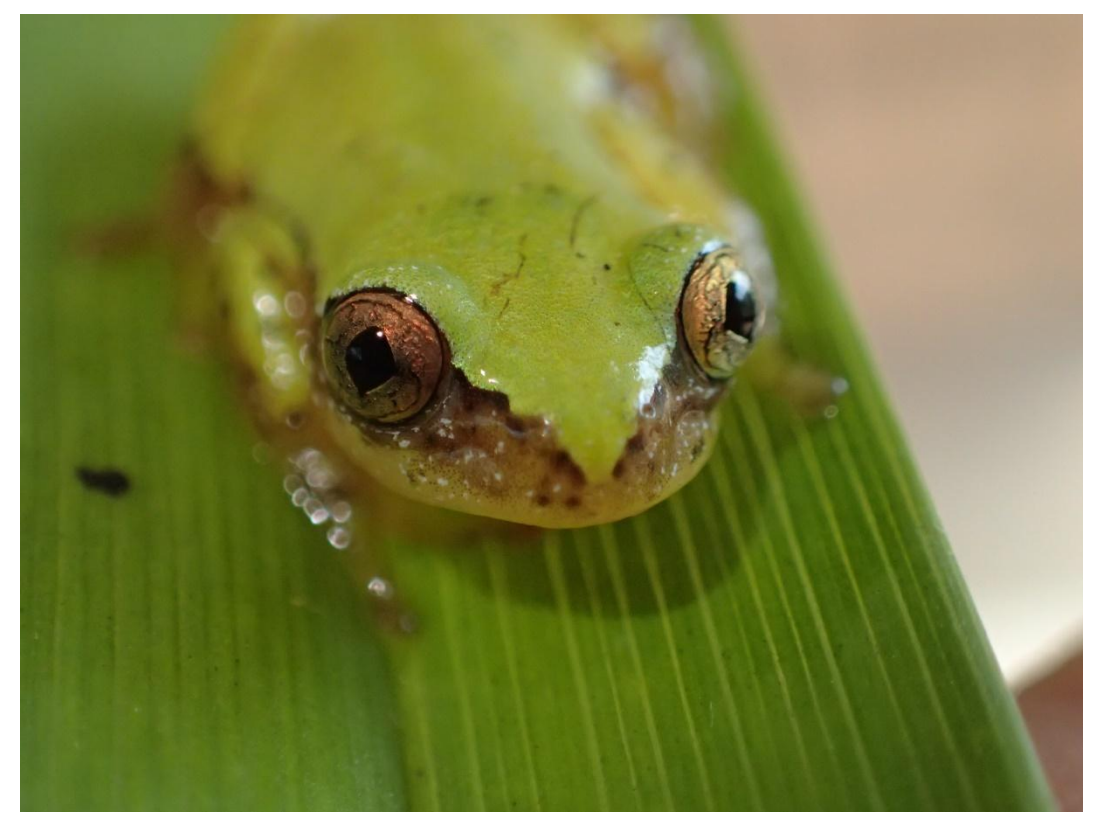
Afrixalus clarkeorum, locality Boka Forest Wetland