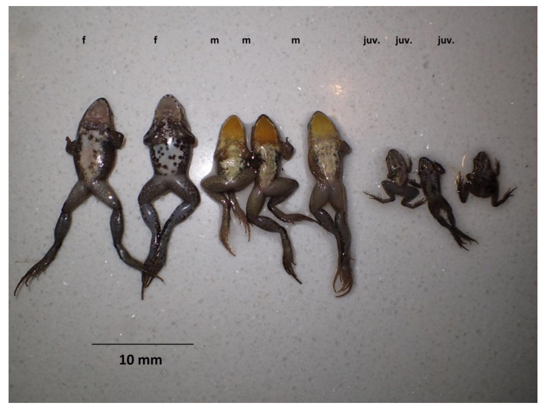
Phrynobatrachus minutus ventral color patterns, locality: Boka Forest Wetland