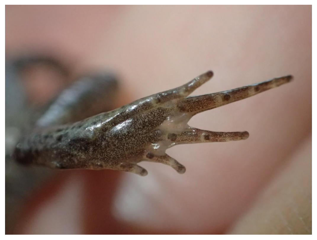
Foot of Phrynobatrachus minutus (female), locality: Shoriri Wetland