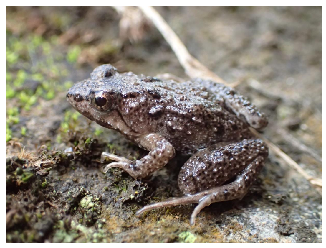
Phrynobatrachus natalensis, locality: Alem Gono Wetland