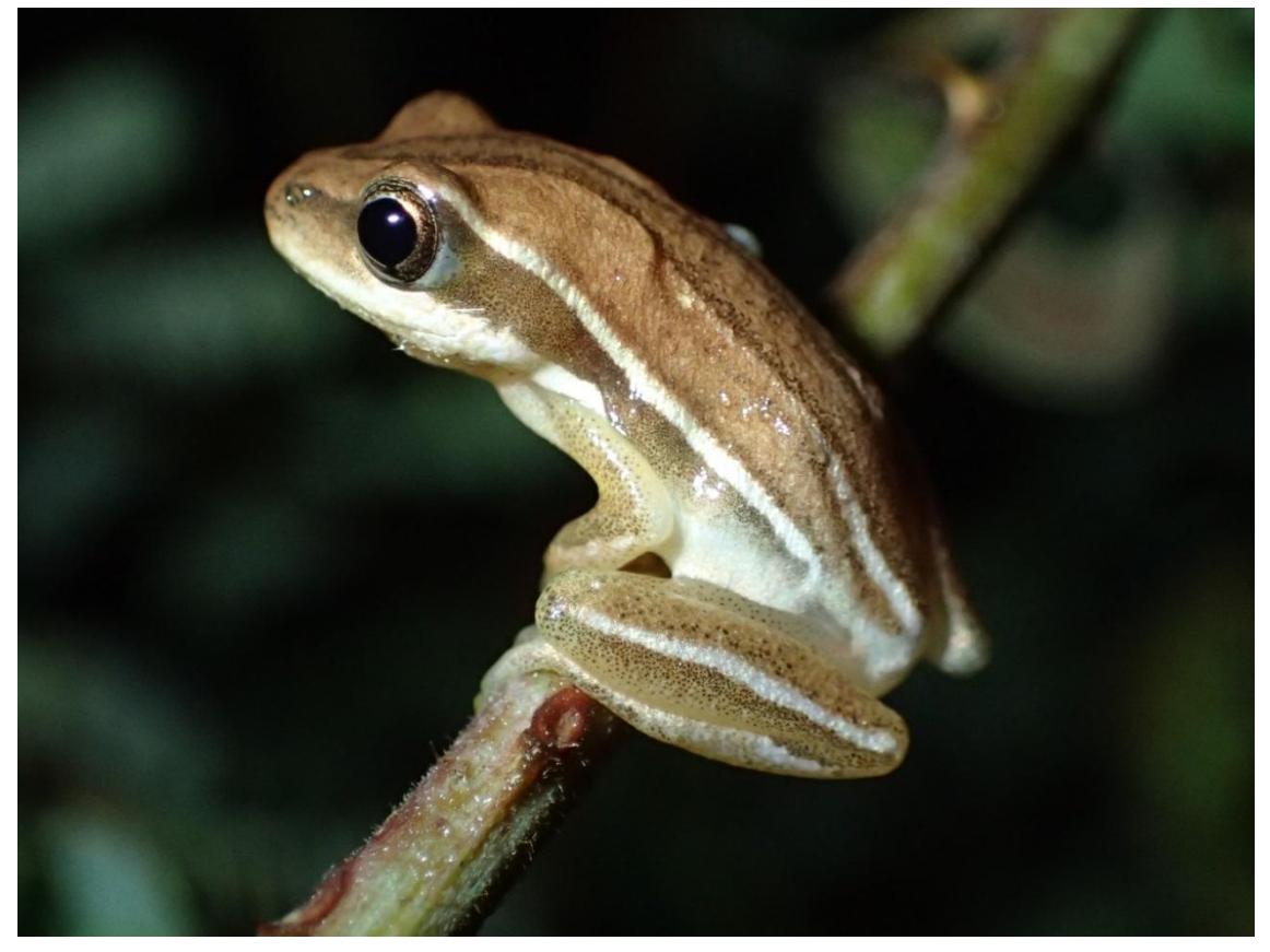
Hyperolius viridiflavus, locality: Gojeb Wetland