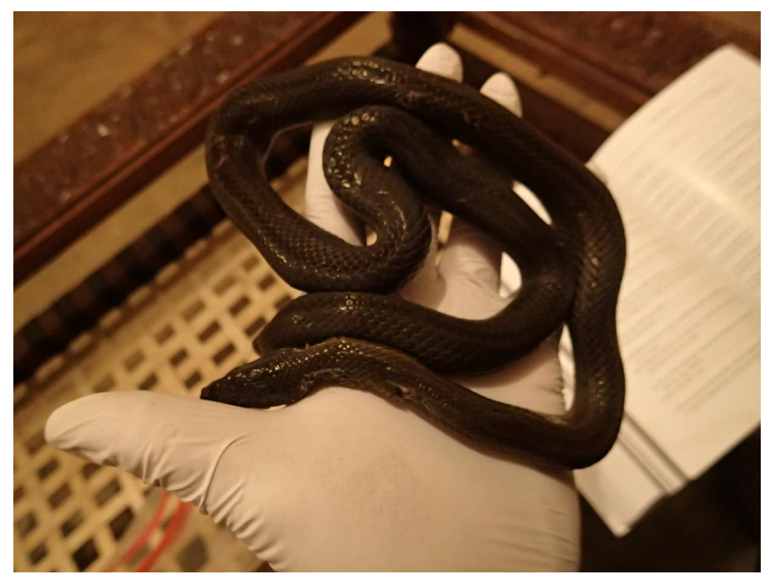
Pseudobodon boehmei, roadkill, locality: road north of Bamboo Forest