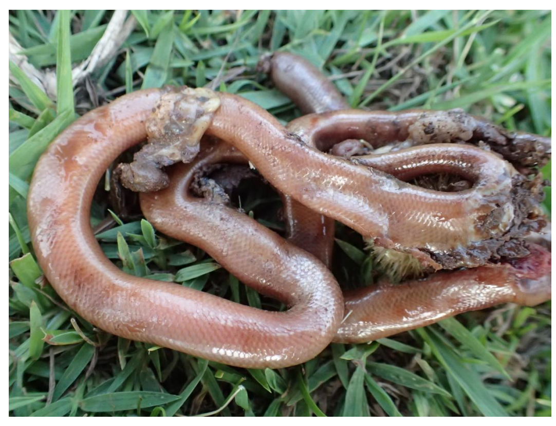
Megatyphlops brevis, roadkill, locality: road between Gojeb Wetland and Boginda Forest