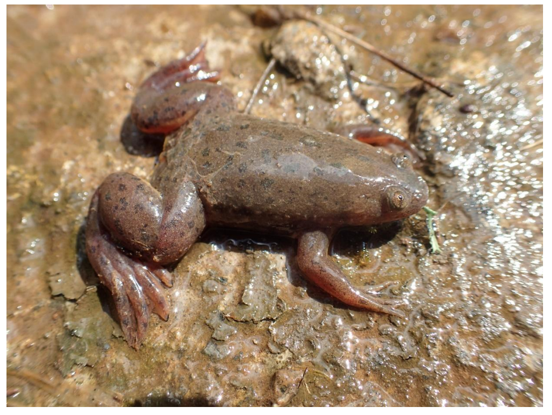
Xenopus clivii, locality: Shoriri Wetland