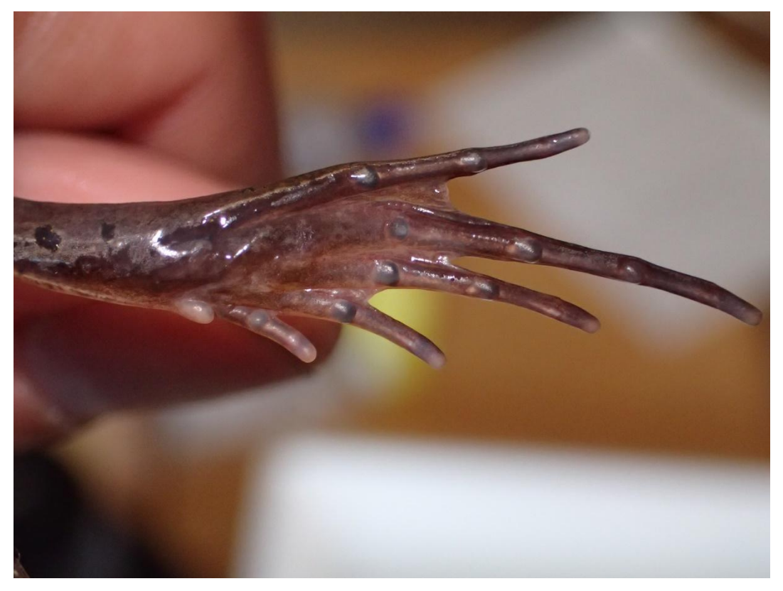
Foot of Ptychadena mascareniensis, locality: Alem Gono Wetland