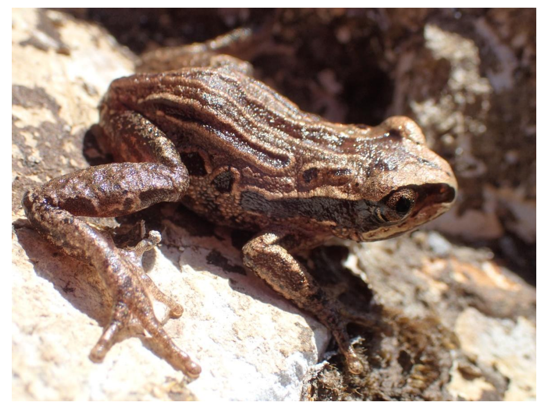
Leptopelis spec., locality Boka Forest Wetland