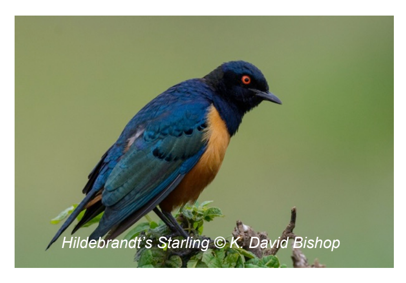
Ph Hildebrandt's Starling Lamprotornis hildebrandti Moderately common in the grounds of Speke Bay Lodge; very common in the central Serengeti (40 in one day) and Tarangire NP.

$ Kenrick's Starling Poeoptera k. kenricki A total of ten along the Magamba Forest Track, West Usambaras