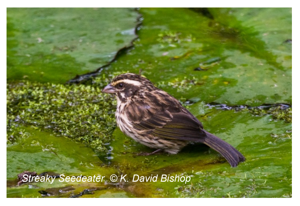
BVD Thick-billed Seedeater Serinus burtoni kilimensis Just one with a mixed flock in the grounds of Gibbs Farm.

Ph Streaky Seedeater Serinus s. striolatus Very common in the Ngorongoro Crater and in the grounds of Gibbs Farm; singles noted in the West Usambaras