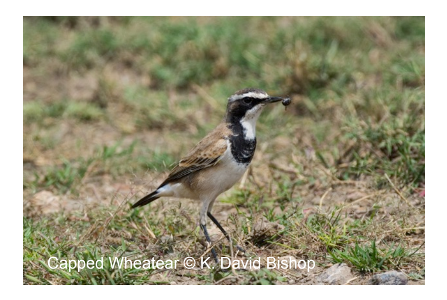
Ph Capped Wheatear Oenanthe pileata livingstoni Common in the short grass plains of the southern Serengeti and Ndutu area. Two in the Ngorongoro Crater.