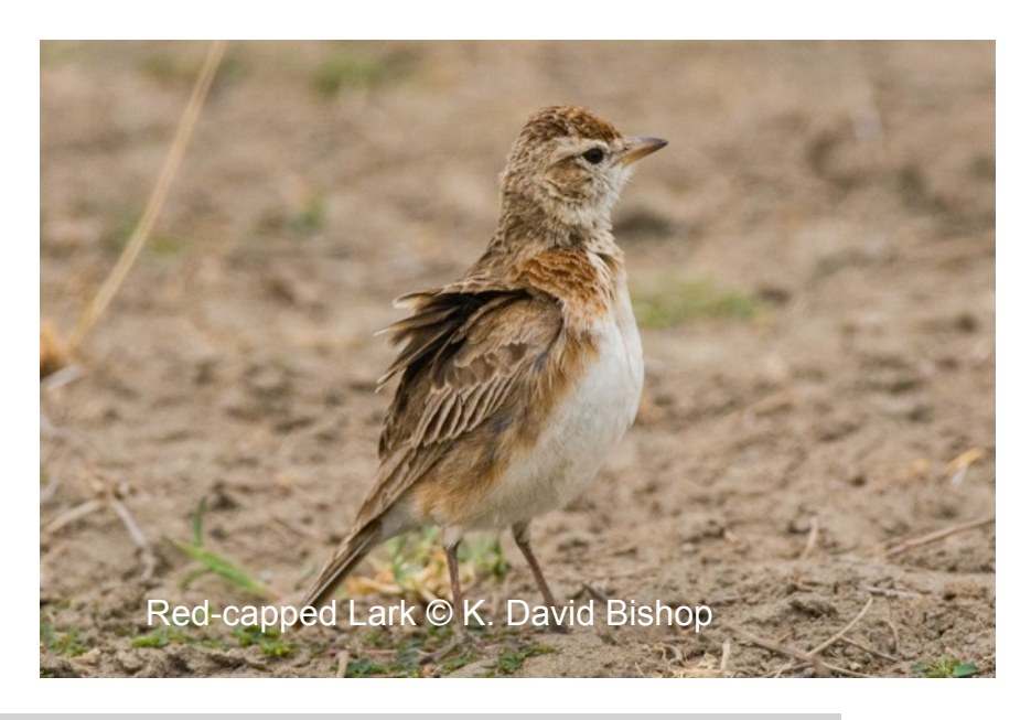
BVD Short-tailed Lark Pseudalaemon fremantlii delamerei One in the short-grass plains near Ndutu – we were distracted by the Cheetah to really appreciate this very local species.