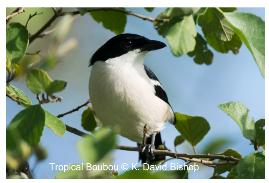
Ph Black-headed Gonolek Laniarius erythrogaster This striking looking and distinctly vocal species was seen well in the grounds of Speke Bay Lodge.

Tropical Boubou Laniarius aethiopicus major and ambiguus This wonderful vocalist was seen and heard commonly in Arusha NP; within montane forest on the upper slopes of Ngorongoro; Tarangire NP; Mikumi NP; Udzungwa NP and in the grounds of the Mediterraneo Hotel, Dar e Salam.