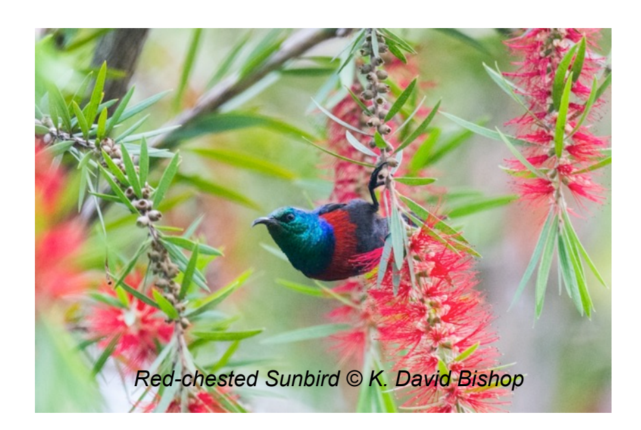
Ph Red-chested Sunbird Cinnyris erythrocercus Common around the city of Mwanza and in the grounds of Speke Bay Lodge, Lake Victoria.

Marico (Mariqua) Sunbird Cinnyris mariquensis suahelicus One male in the grounds of the Serengeti visitor centre.