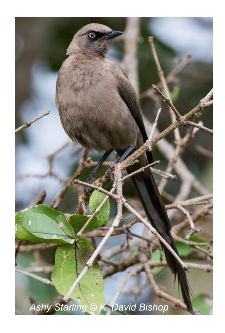
Ph Ashy Starling Lamprotornis (Spreo) unicolor Notably abundant from the moment we entered Tarangire and thereafter throughout the national park.