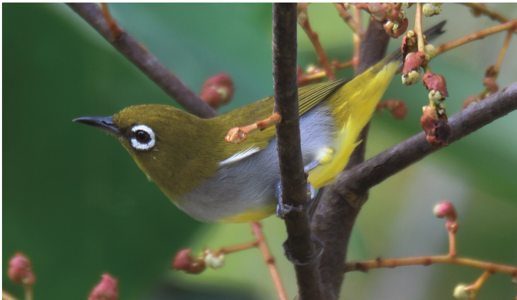
Figure 2. Zosterops 'tahanensis' , Keledang Sayong Forest Reserve, inland Perak state, Peninsular Malaysia; differs from nominate auriventer (which is unknown in life) only by average measurements (see Wells 2017, this issue)