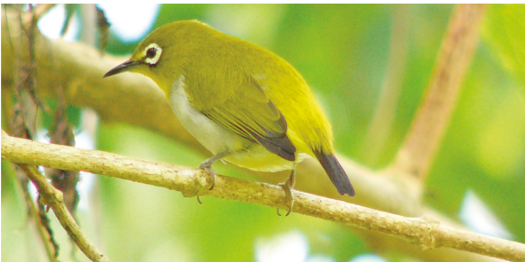
Figure 3. Unidentified coastal white-eye, Damai, Santubong Peninsula, south-west Sarawak, western Borneo