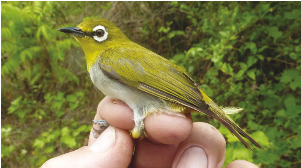
Figure 1. Zosterops (palpebrosus) 'auriventer' (= erwini ), mangrove zone, Khlong Thom district, Krabi Province, peninsular Thailand, i.e., at the proven end-point of erwini range closest to the type locality of nominate auriventer