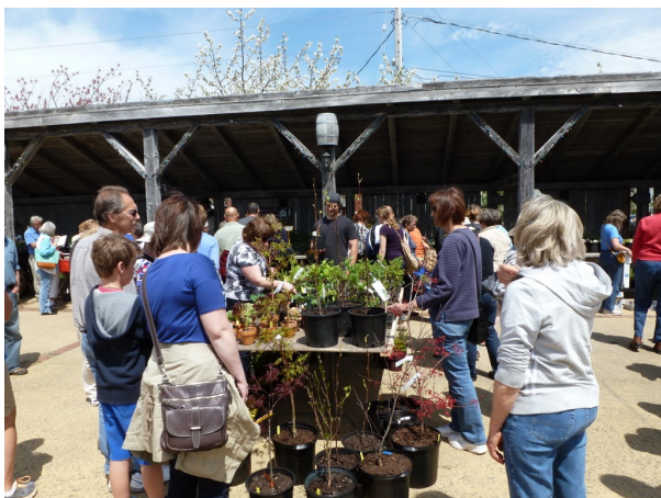
Part of the "Sale Crowd".