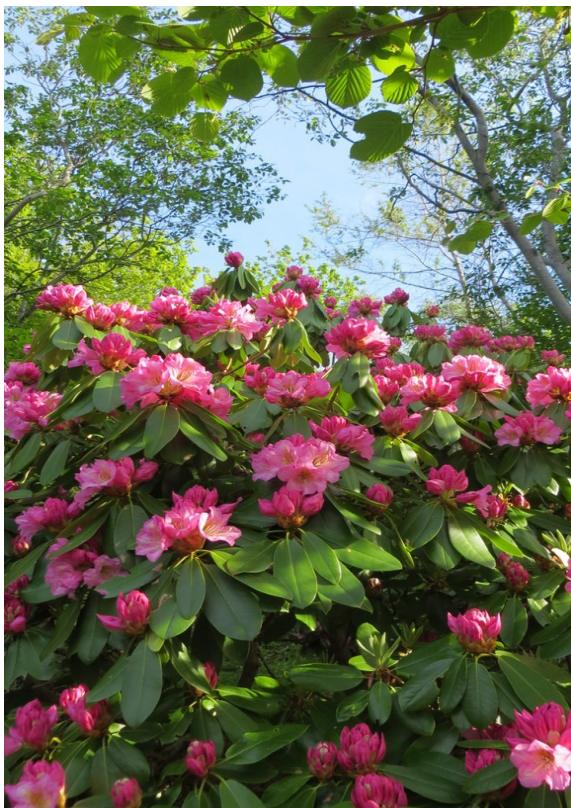
‘Santa Fe’ in Fergusons Cove.