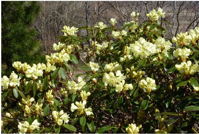
'Nancy Steele' rhododendron at the Annapolis Royal Historic Gardens