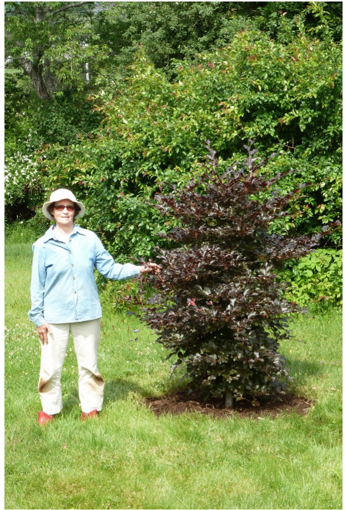
Fagus sylvatica 'Purpurea'

On top of that, the Annapolis Royal Historic Gardens opens on May 15. The Historic Gardens is full of spring-blooming plants and springtime is one of the best times to stroll through the Gardens. Rhododendron "Nancy Steele", bred in Nova Scotia, will be in bloom