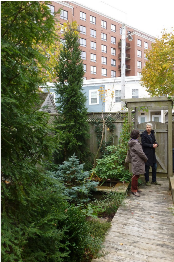
Picea abies 'Christina', five or six years from transplanting.